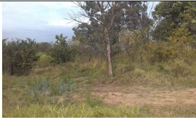
Fig 1. View of area 1

Proposed development: Dam establishment (2)