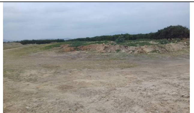
Fig 4. View of area 2