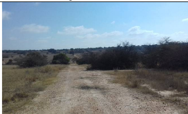
Fig 3: View of area 2