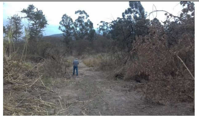
Fig 2. View of area 1