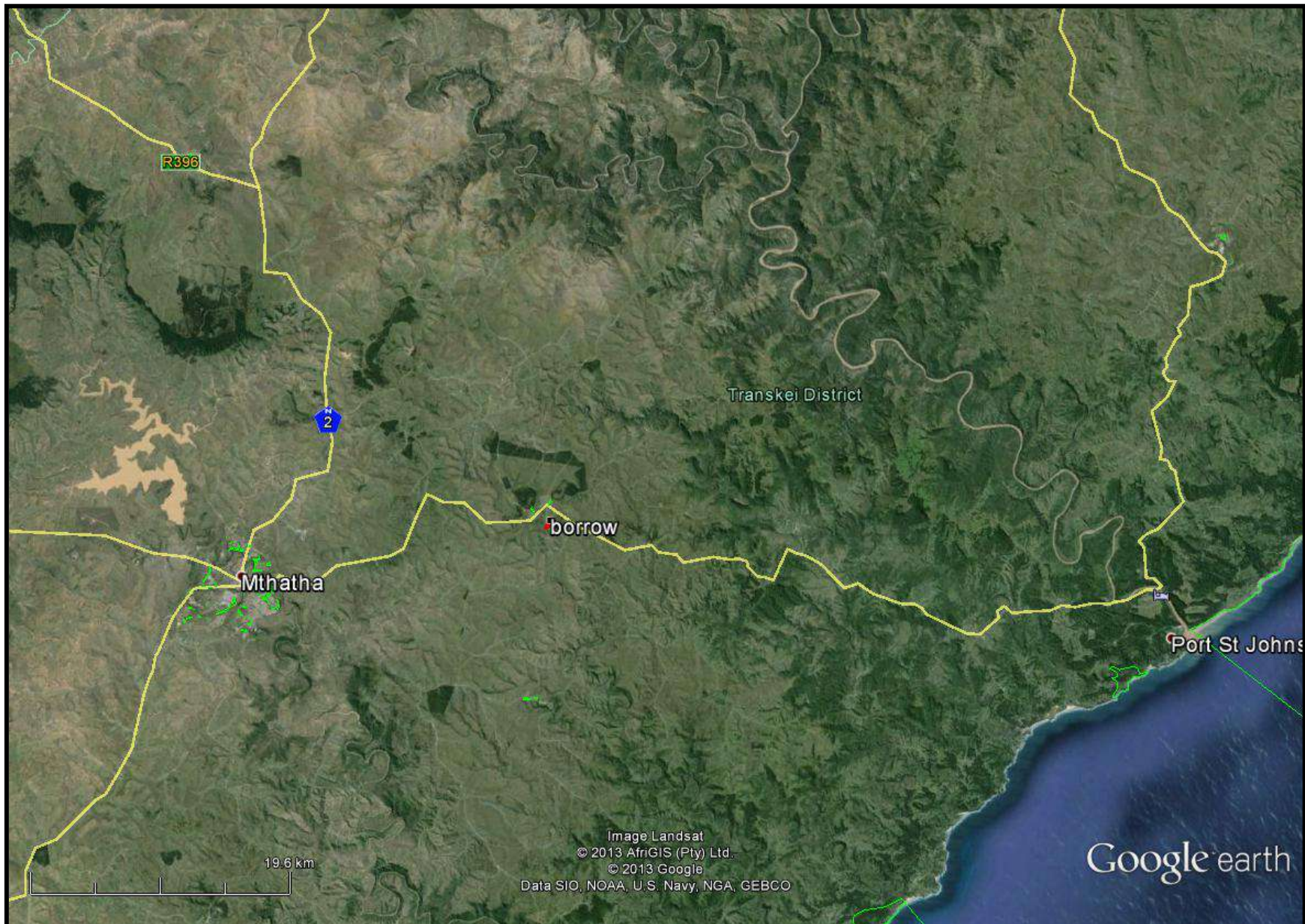
FIG. 1 GENERAL LOCATION OF THE LIBODE BORROW PIT