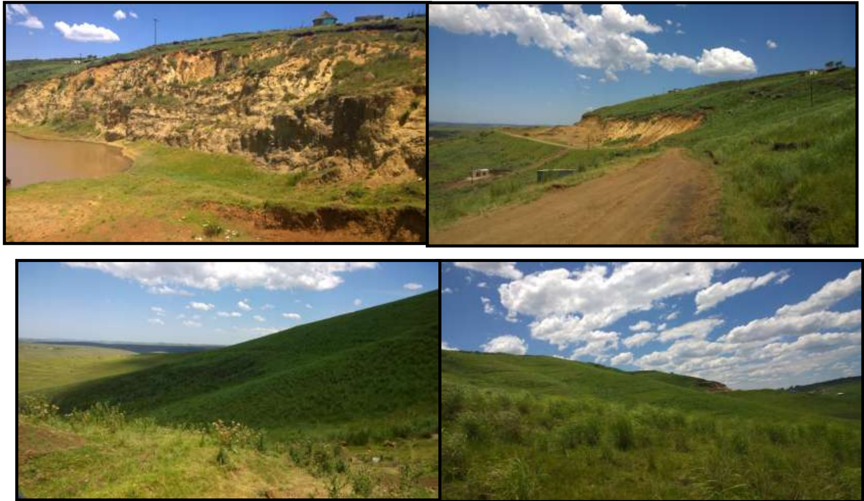
FIG. 4: SCENIC VIEW OF THE BORROW PIT