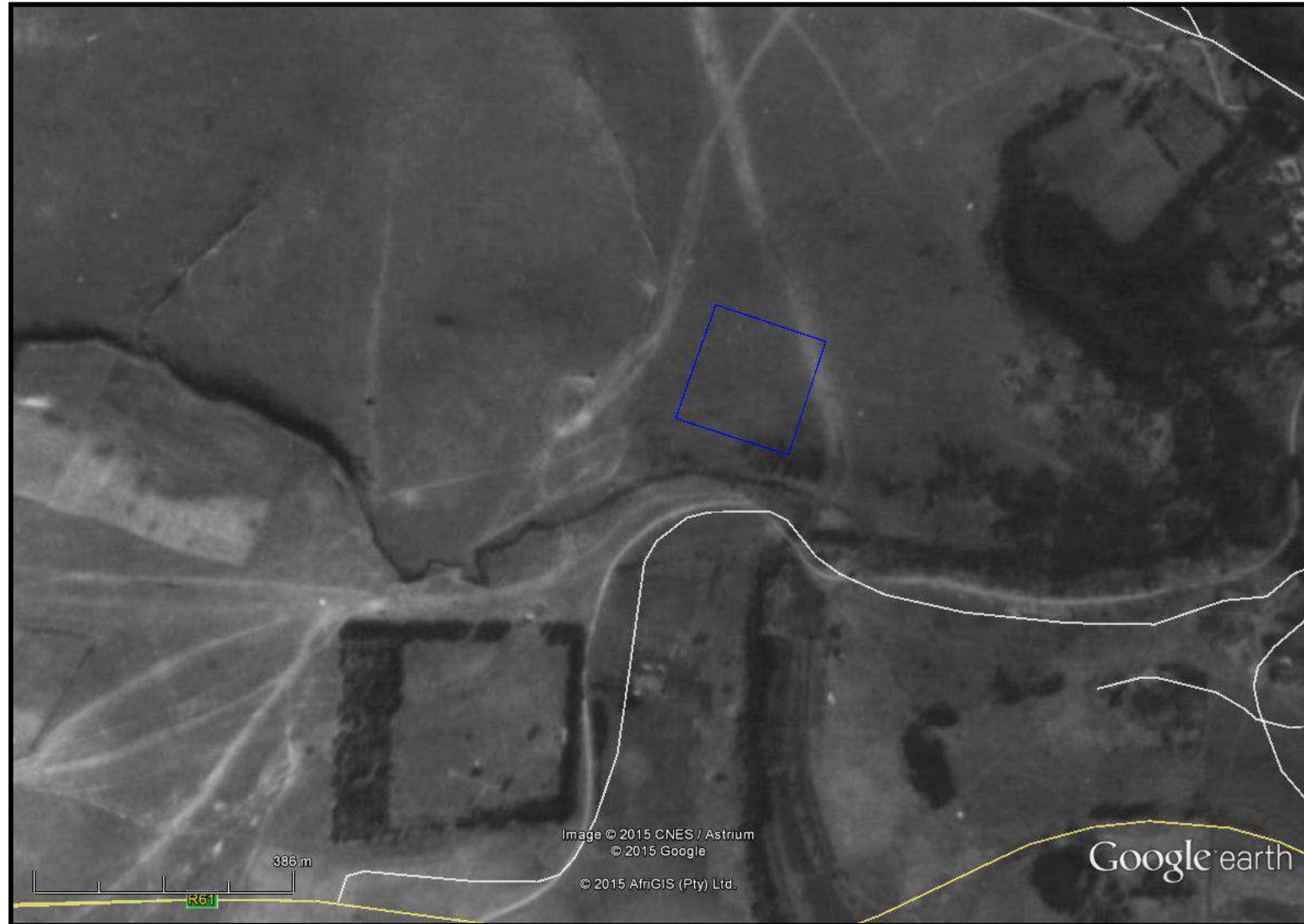
FIG. 4: STUDY AREA IN 1952