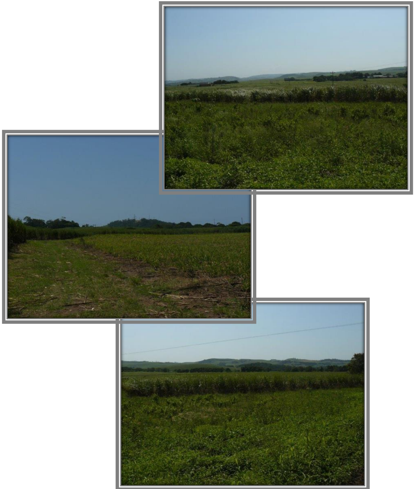
FIGURES 4-6 TYPICAL VIEWS OF THE PROPOSED DEVELOPMENT AREA.