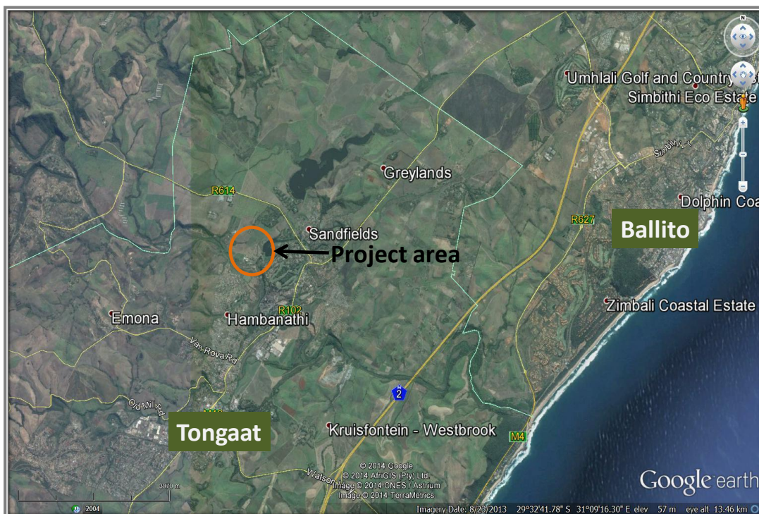
FIGURE 1 LOCATION OF PROPOSED DEVELOPMENT SITE IN REGIONAL CONTEXT.