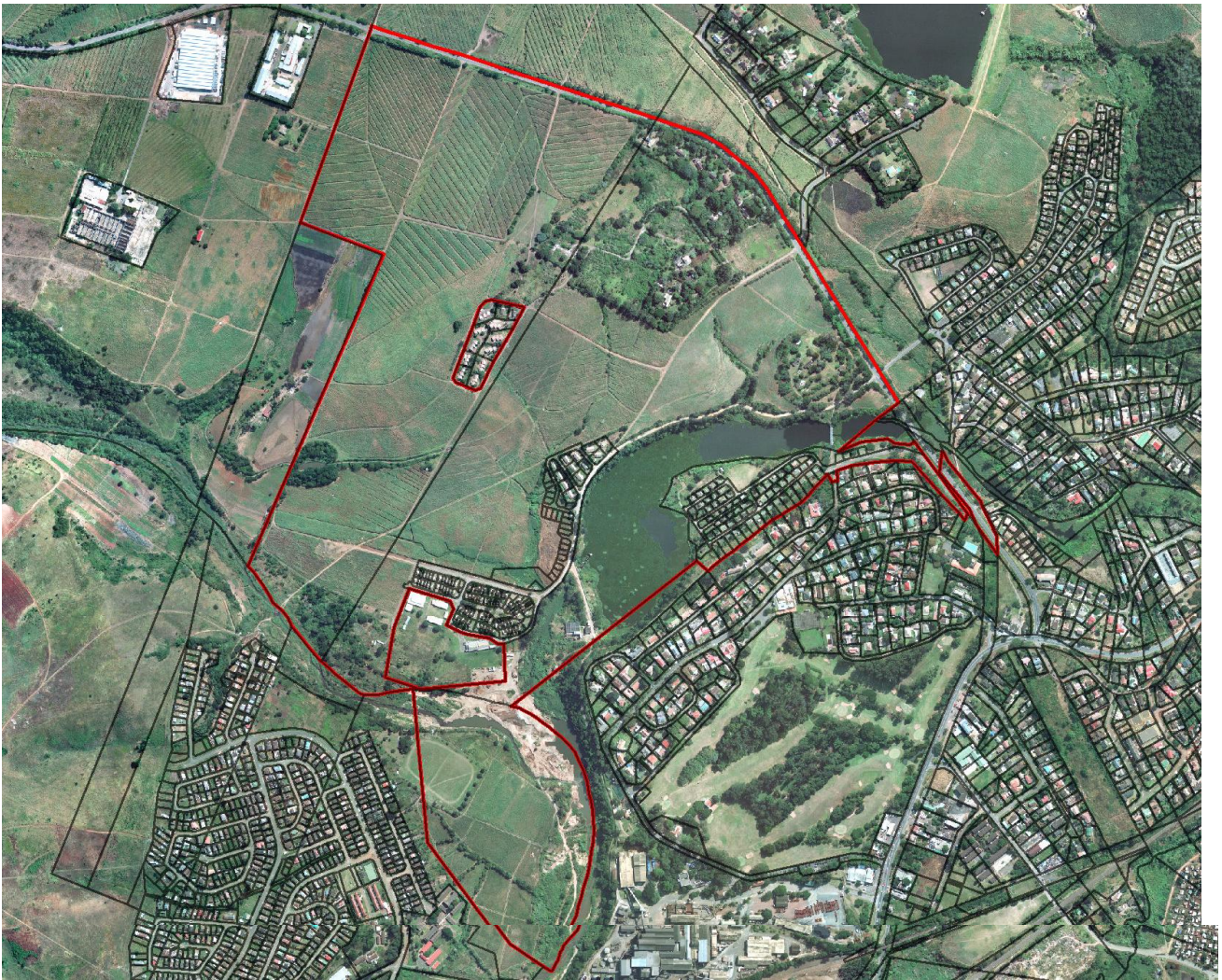
FIGURE 2 LOCATION OF PROPOSED DEVELOPMENT SITE IN LOCAL CONTEXT.