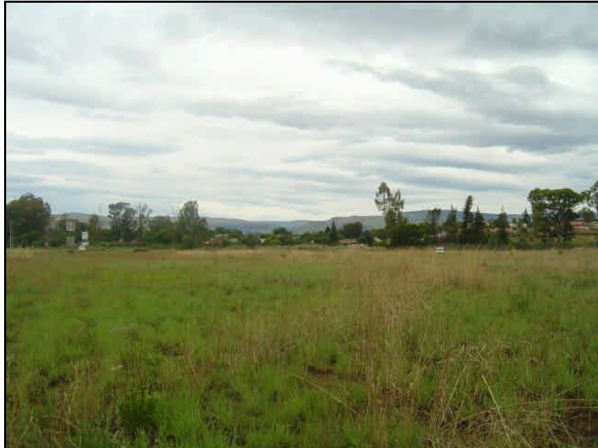
Figure 1 – Site conditions on site

The site consists of some 15 hectares in extent that was previously utilised as farm land.