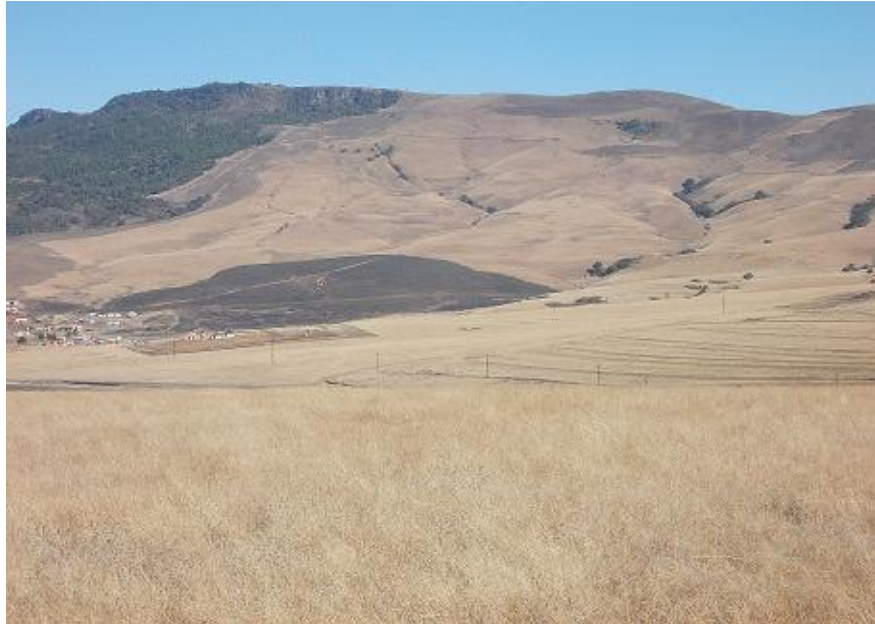
Fig 1. General view of proposed development area

General GPS co-ordinate: S30° 15' 18.3" E29° 49' 09.6"