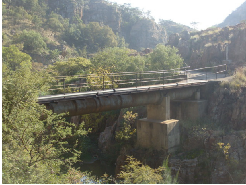
Figure 15 Another structure associated with the tunnel at site no. 10.