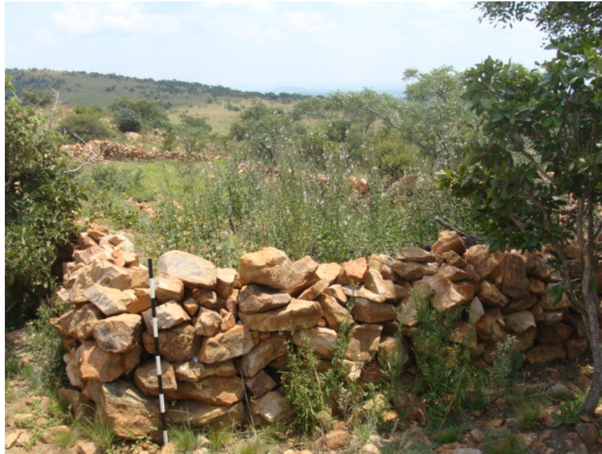
Figure 7 A section of the stone walling at site no. 5.

The site is more than likely not older than 60 years and therefore do not have a historical value. However it is part of the living and social heritage of the people of the area and therefore needs to be preserved.