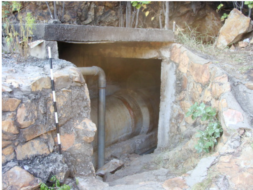
Figure 12 Northern side of the tunnel.

The site is more than likely older than 60 years and therefore have a historical value. Since many similar sites are still in use, it constantly is undergoing change. Therefore this one is an example of our country's industrial heritage. It therefore needs to be preserved.