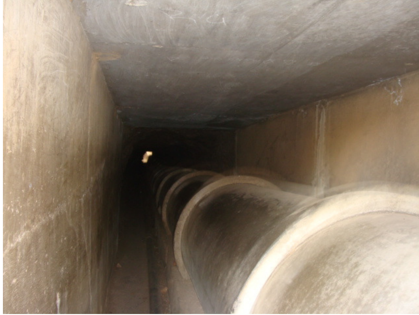
Figure 13 A view of the inside of the tunnel.