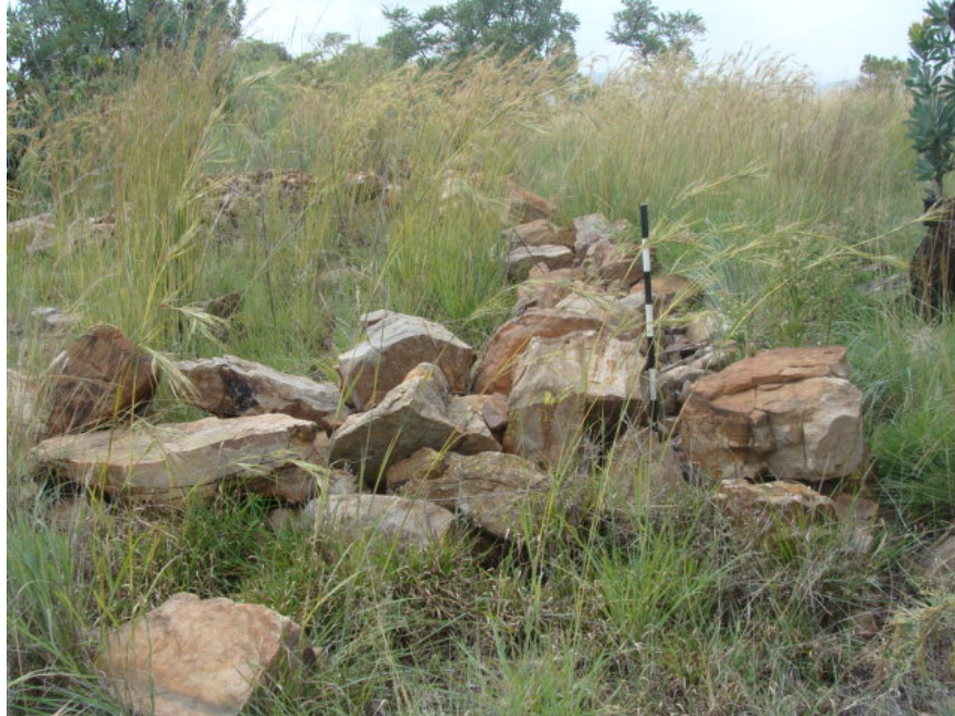
Figure 5 A section of the stone walling at site no. 3.