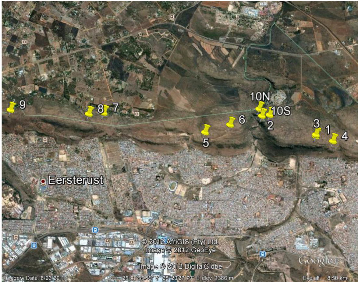
Figure 16 Google image indicating the ten sites on the resort.

Combined with the natural resources the resort is indeed a precious asset that should be managed with the necessary care. The cultural heritage of the Moretele Resort includes the last phase of human history.