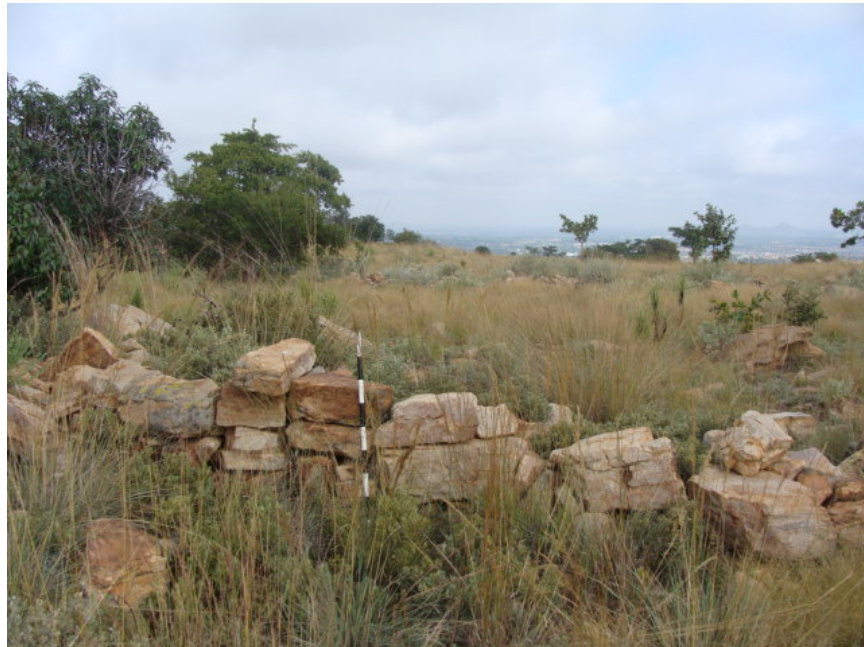
Figure 10 A section of the stone walling at site no. 8.