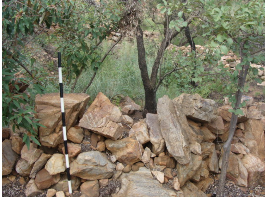
Figure 3 A section of the stone walling at site no. 2.