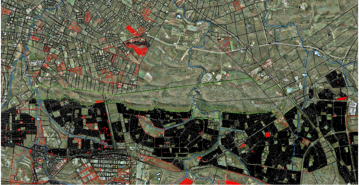
Figure 2 The boundaries of the resort are shown in green.