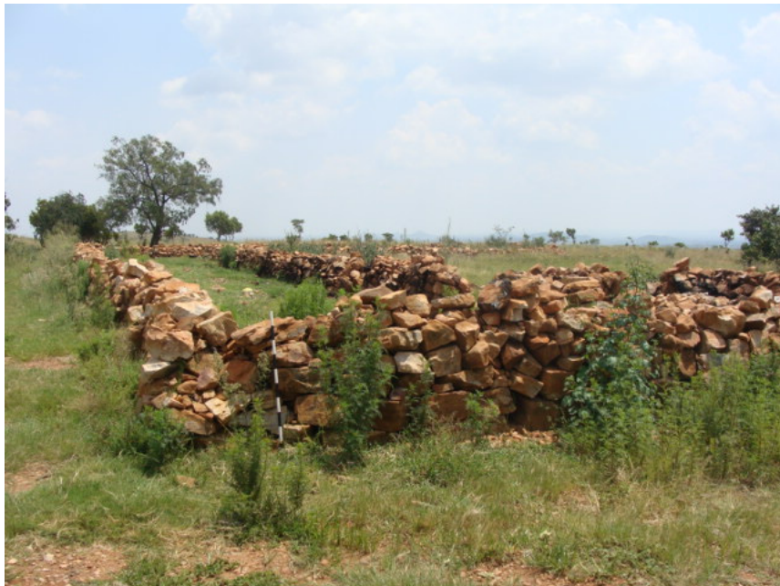
Figure 8 A section of the stone walling at site no. 6.

The site is more than likely not older than 60 years and therefore do not have a historical value. However it is part of the living and social heritage of the people of the area and therefore needs to be preserved.