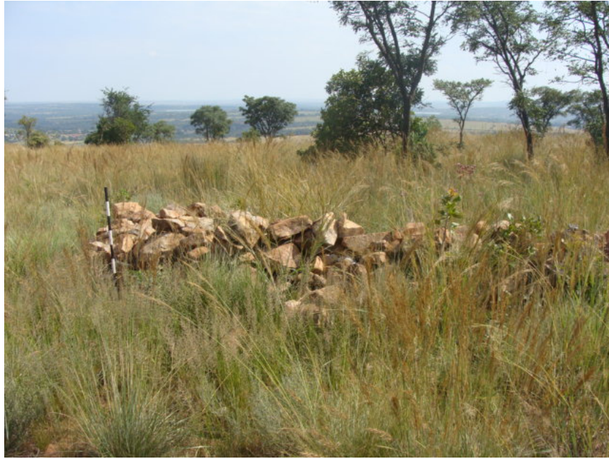
Figure 3 A section of the stone walling at site no. 1.