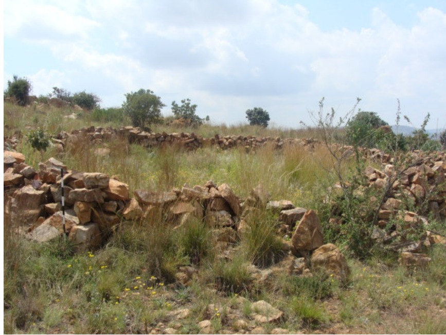
Figure 6 One of the circular stone walled structures at site no. 4.

The site is more than likely not older than 60 years and therefore do not have a historical value. However it is part of the living and social heritage of the people of the area and therefore needs to be preserved.