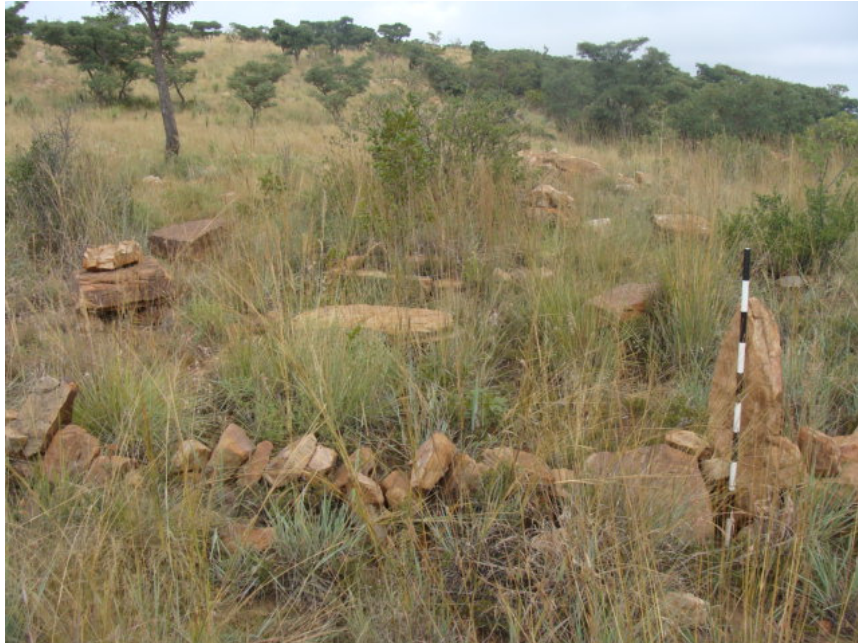
Figure 9 A section of the stone walling at site no. 7.

The site is more than likely not older than 60 years and therefore do not have a historical value. However it is part of the living and social heritage of the people of the area and therefore needs to be preserved.