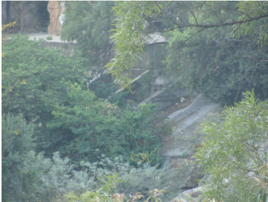
Figure 14 One of the associated structures at site no. 10.