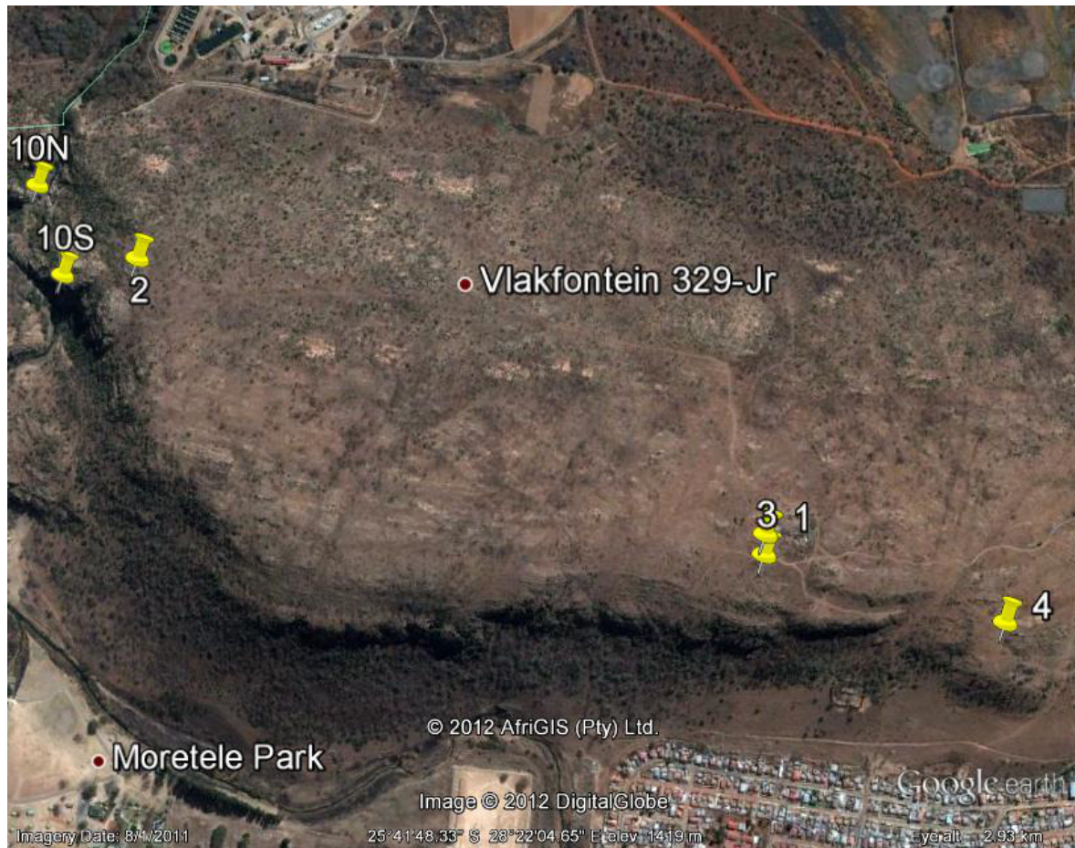
Figure 17 Closer view of area where sites 1-4 and 10 were identified.