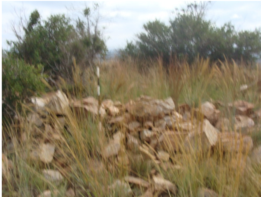
Figure 11 A section of the stone walling at site no. 9.

The site is older than 60 years and therefore has a historical value. Although more research is needed, it is believed that the one circle rather is a blockhouse with the second one, an enclosure for mules nearby.