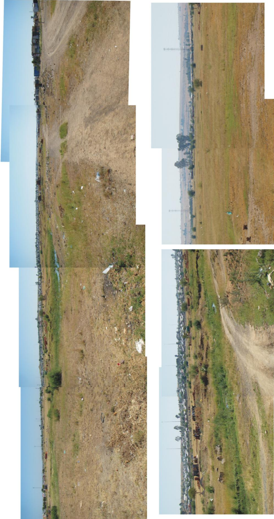
Figure 3. The affected area, looking northeast (above), north (below left) and east (below right).