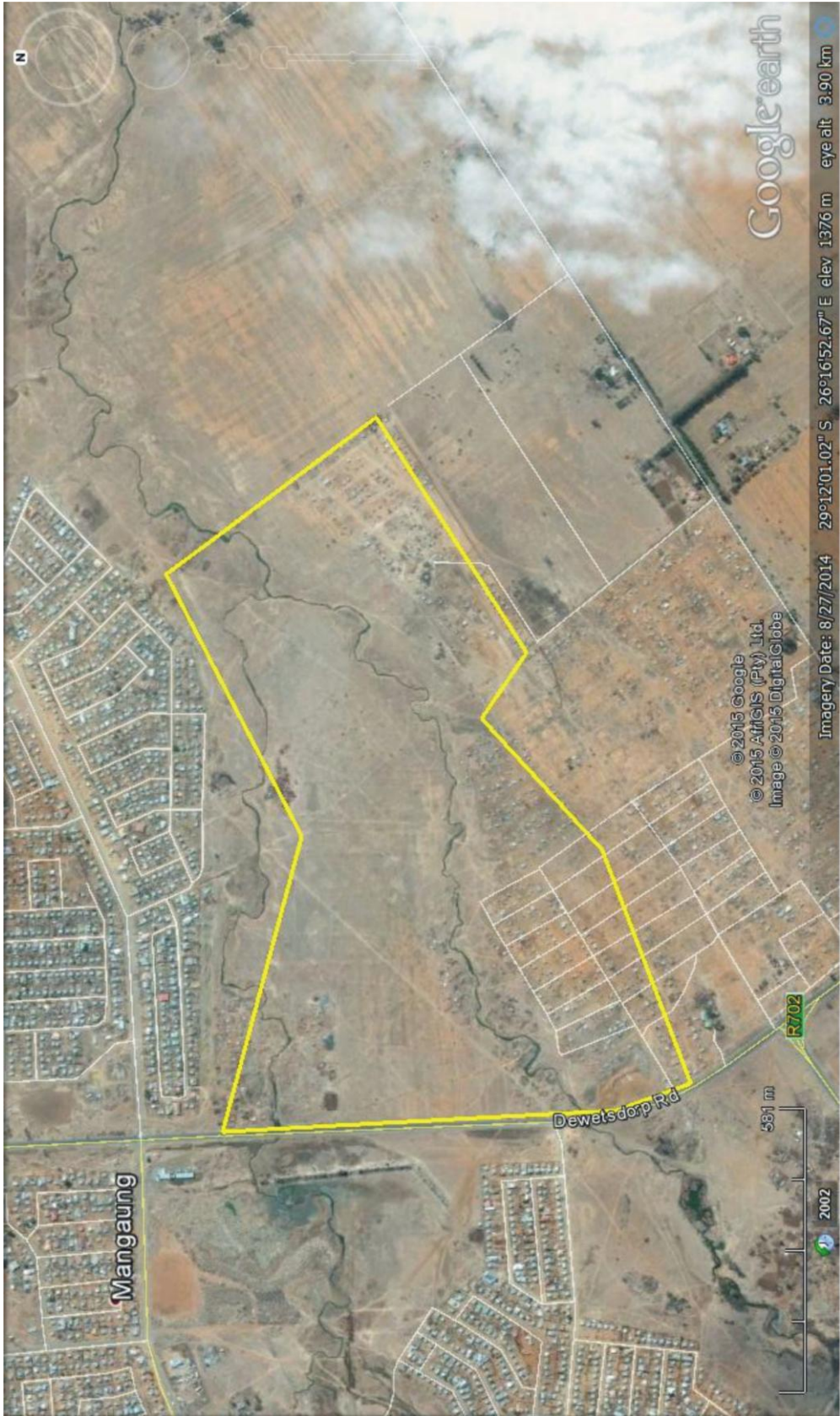
Figure 2. Aerial view of the affected area.