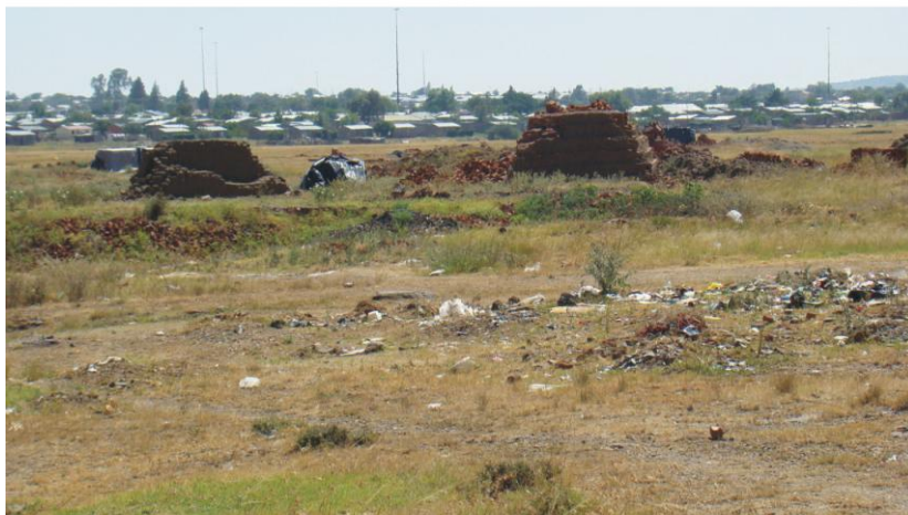
Figure 4. The site has been impacted by informal residential development and industrial activities (brick-making sites).