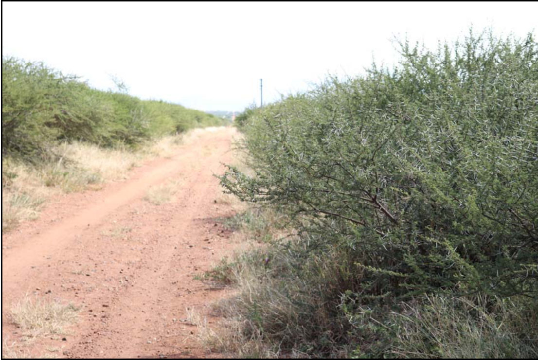
Figure 4: The gravel road alongside the Railway line