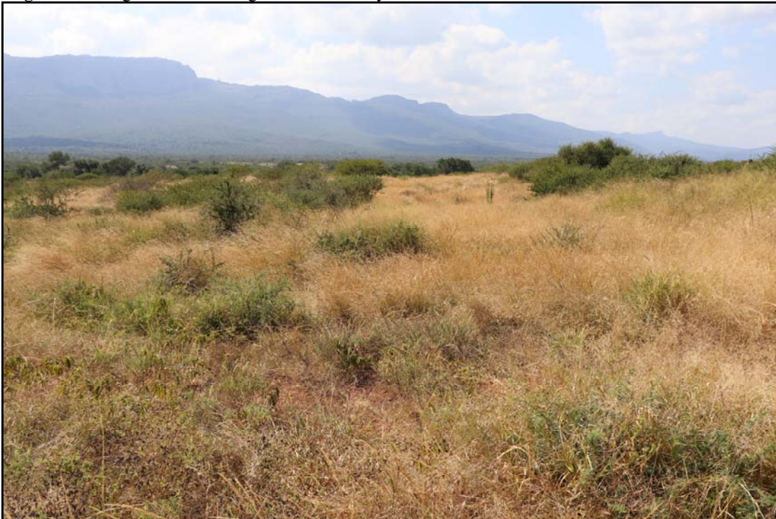
Figure 5: View of the study area