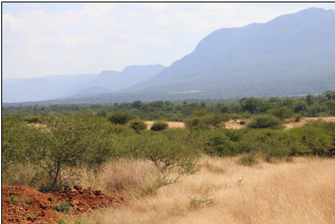
Figure 3: View of the study area dominated by Acacia tortilis and A. Karoo

hectars of land dominated by soils and gravel mounds. The proposed area stretch from the Dorp River bridge, with the main tarred road forming the north-eastern border while the railway line from the southern boundary. The site covers roughly 13 hectares of land dominated by the geology and soils of the Soutpansberg group. Miscellaneous soils which including acidic dystrophic to mesotrophic sandy to loam soil occurs in rocky areas towards the Soutpansberg. The vegetation of the study area has been largely influenced by the geology and falls within the Soutpansberg Mountain Bushveld complex. Its distribution stretch from the Blouberg to the Soutpansberg covering the lower lying areas with complex mosaic of sharply contrasting kinds of vegetation within limited areas, however subtropical moist thickets (dense bush) and poorly developed grass layer could be found in disturbed areas. The overall dominant plant taxa include Acacia Karoo , Acacia tortilis and Dichrostachys cineria (Mucina & Rutherford, 2006, Acocks, 1975).