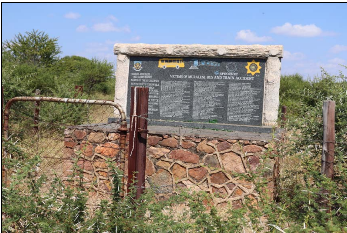
Figure 7: Commemoration Plague outside the proposed development footprint