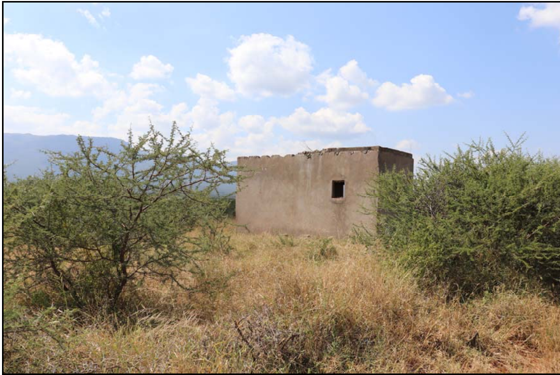
Figure 6: Recent past house remains in the area.