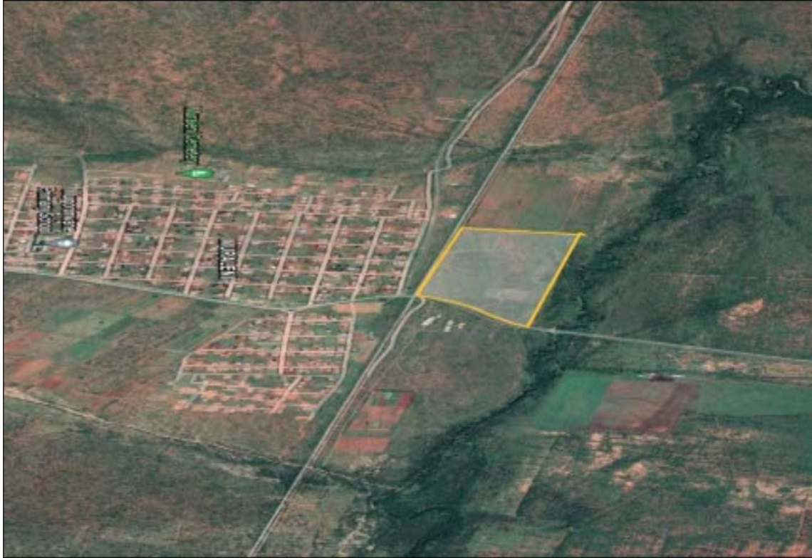
Figure 2: Google Earth Maps

The objective behind this development is to provide social services to Muraleni and the surrounding villages and furthermore creating job opportunities to the local people during the construction phase of the proposed project. In terms of EIA Regulations promulgated on 4 December 2014, read with Section 44 of the National Environmental Management Act (Act 107 of 1998), the proposed development falls within listed Activity.