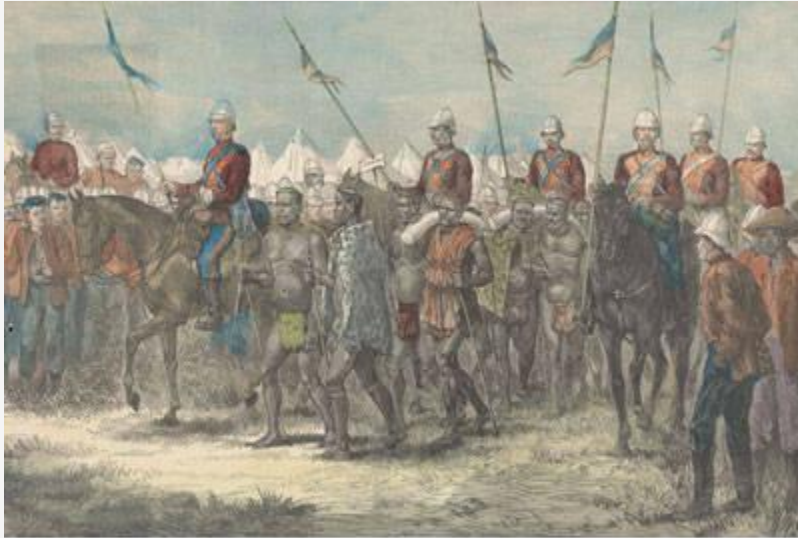
Cetshwayo sends ambassadors to the British Army. From the Illustrated London News, 23rd August 1879

Cetshwayo, heir to the Zulu throne had his father, Mpande, worried over his rapid gain of influence amongst the Zulu. Mpande decided therefore to encourage the rivalry between Cetshwayo and his brother Mbuyazi by suggesting Mbuyazi could be chosen instead as the royal heir. The situation became fraught, and when John Dunn, who came to negotiate a peace between the brothers, offered his services to Mbuyazi, battle was inevitable.