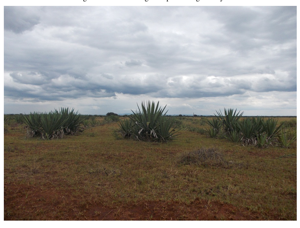
Fig 3. View of existing cultivated sisal