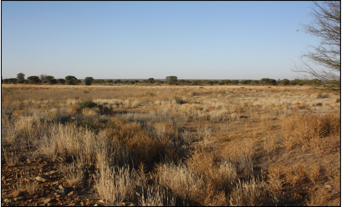
Figure 2: View of the study area towards the south west.