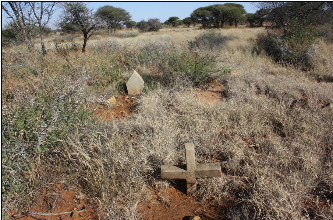
Figure 8: A graveyard indicated by concrete headrest approximately 104 graves were recorded