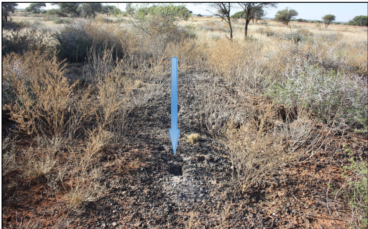
Figure 6: Some of the items collected from different ash midden include spoon, earthen wares, iron items and glass, below indicated by an arrow is a concentration of ash midden