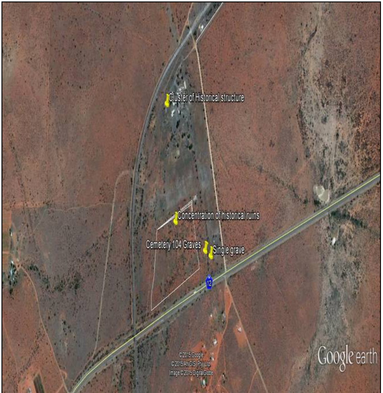
Figure 9: Google Earth map of the study area adopted from Google earth Program