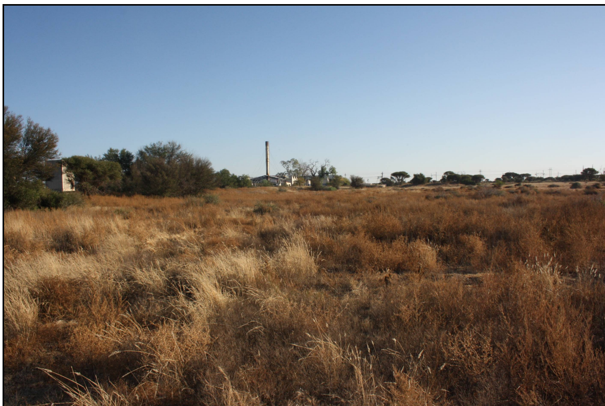
Figure 1: View of the study area towards the north and overgrown cover on the disturbed surface