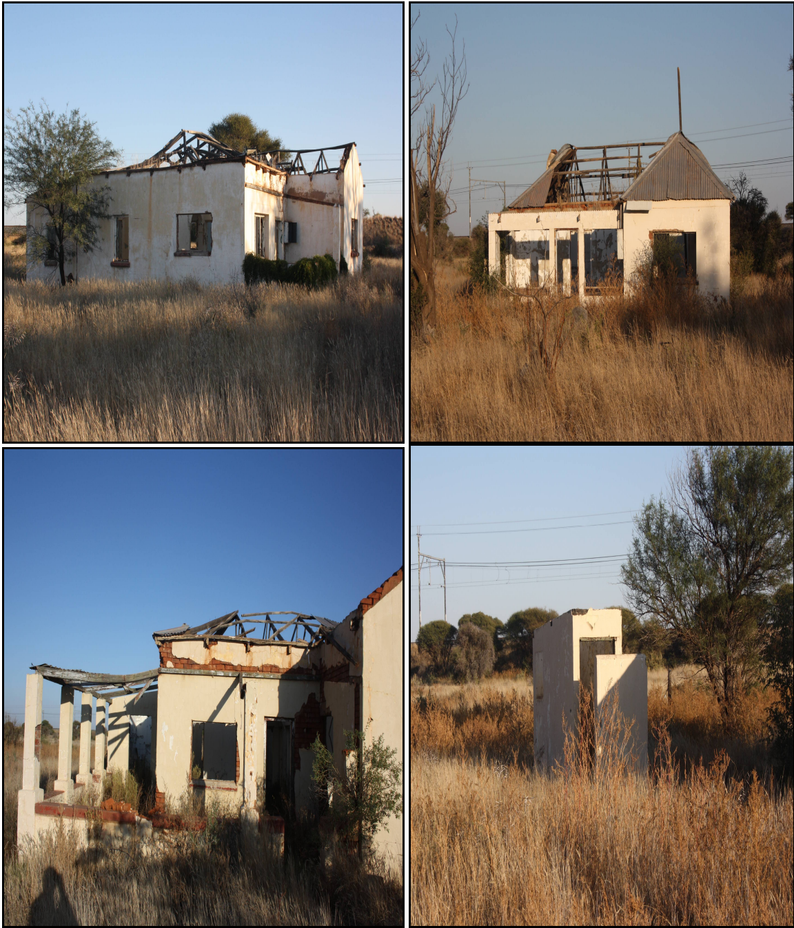
Figure 5: A cluster of three historical structures