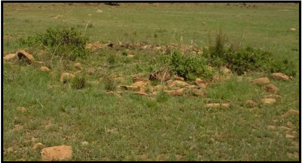
Figure 7. Photograph of later Iron Age Site 1