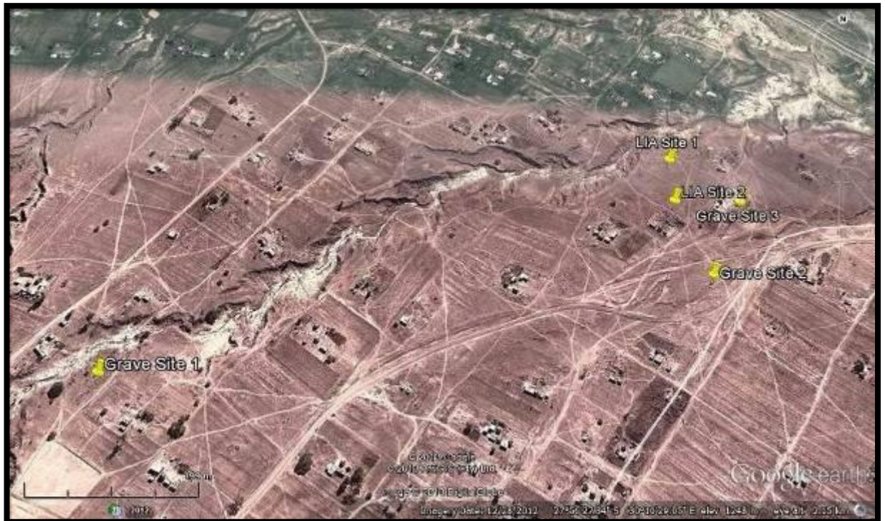
Figure 3a. Google aerial photograph showing the location of heritage sites in the northern section of project area. None of these sites occur within the proposed mining band expansion