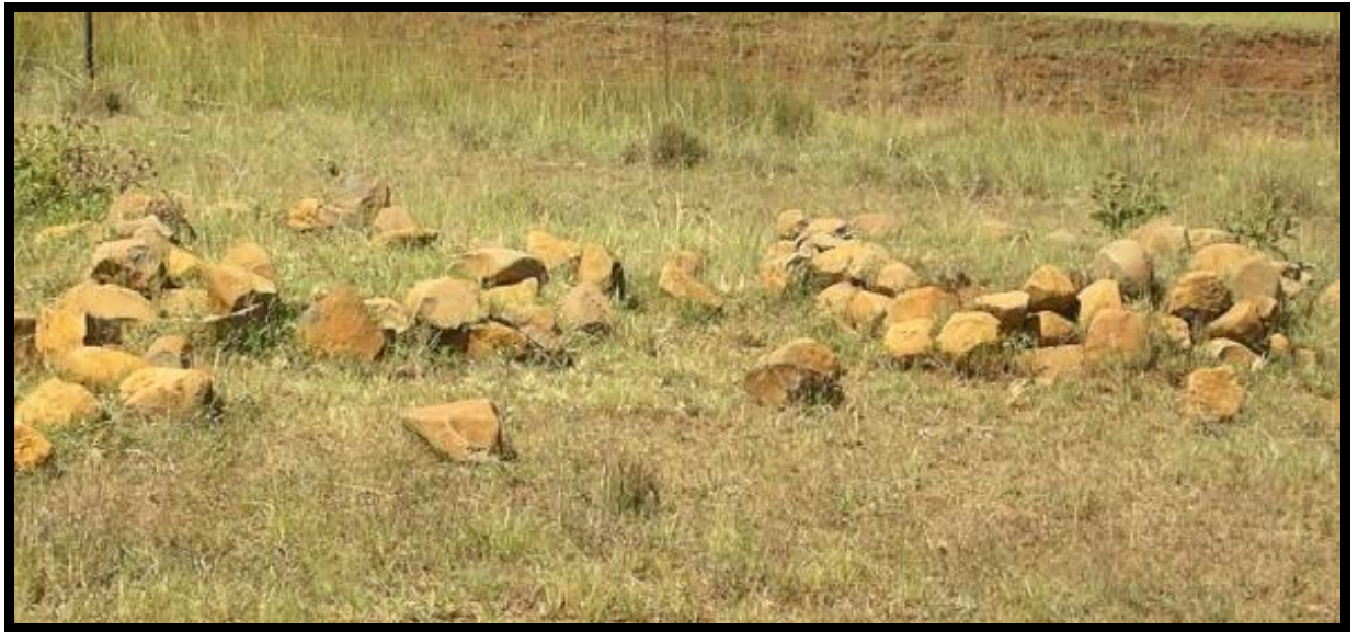
Figure 5. Photograph of Grave Site 2