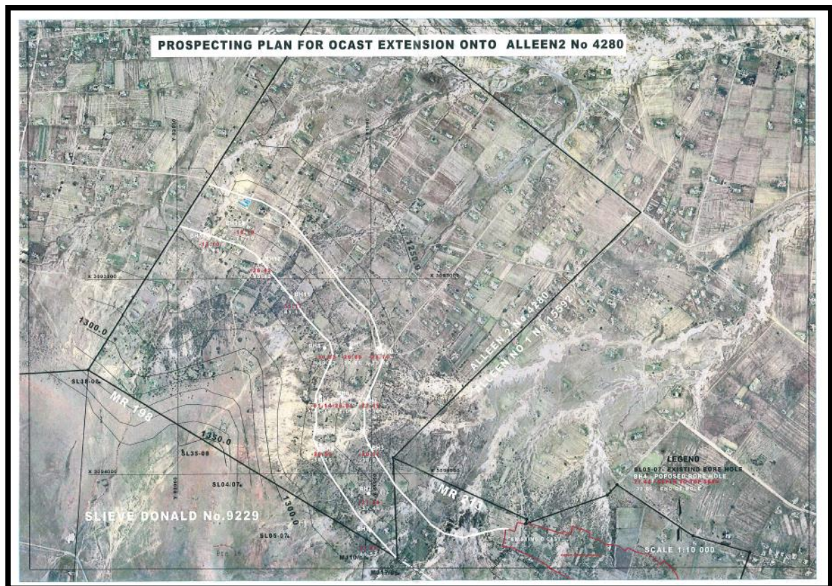
Figure 2. Map showing the locality of the project area. The white demarcated area indicates the proposed mining band extension.