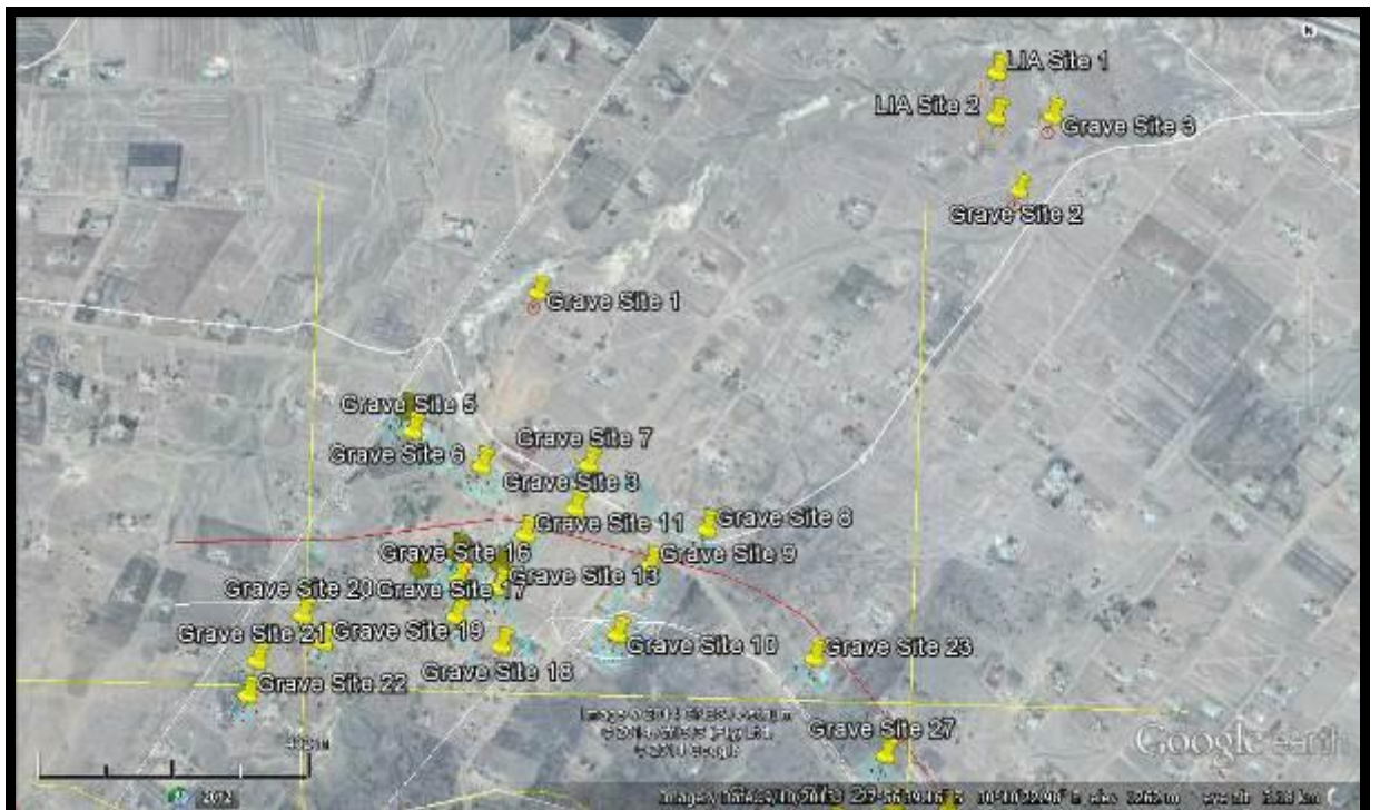
Figure 3b. Google aerial photograph showing the location of heritage sites in the central section of the project area. The red line indicates the area demarcated for the proposed mining band expansion.