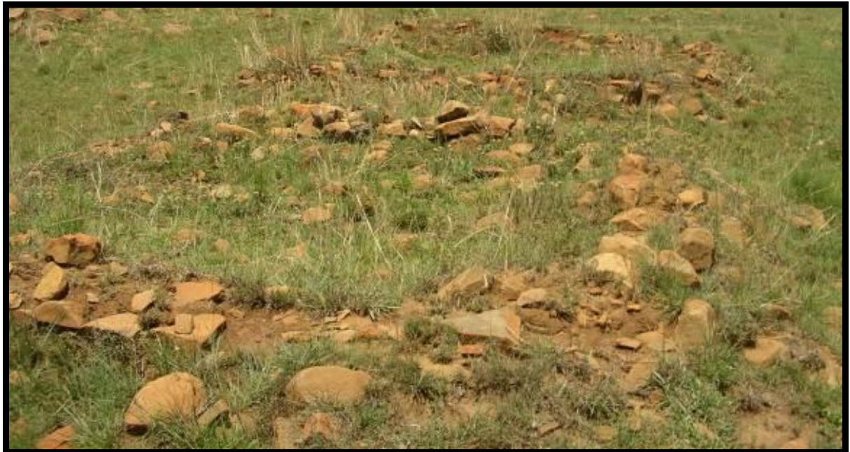
Figure 8. Photograph of Iron Age Site 2. This site may be an extension of Iron Age Site 1