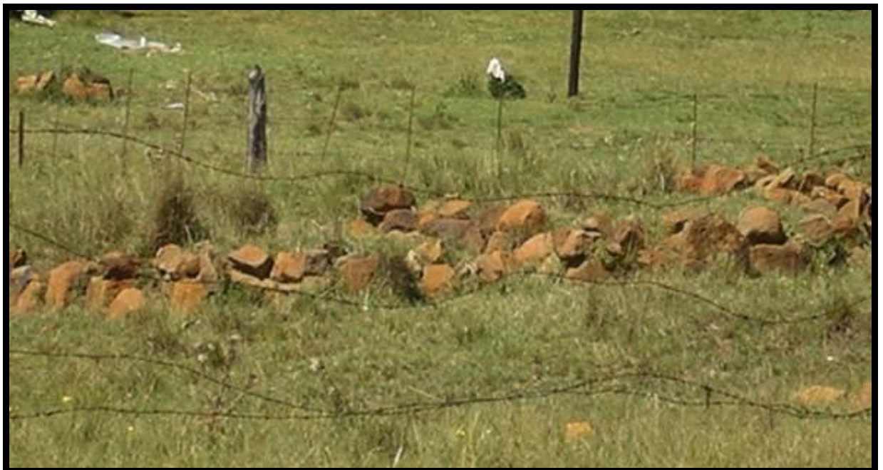
Figure 6. Photograph of Grave Site 3