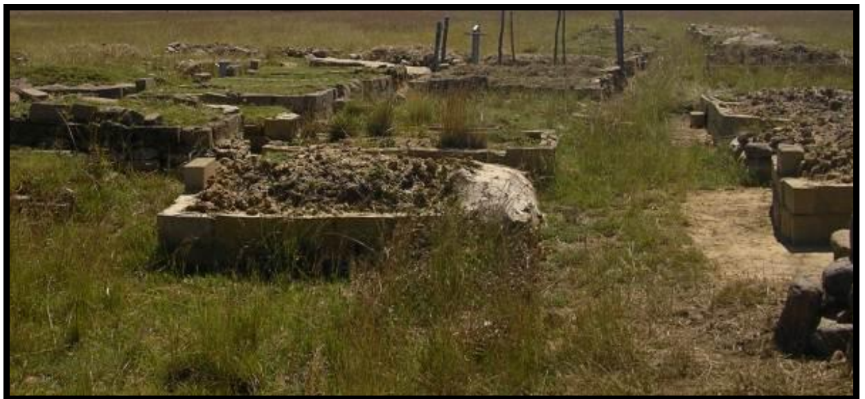
Figure 4. Photograph of Grave Site 1 a rural cemetery containing almost 80 individual graves.