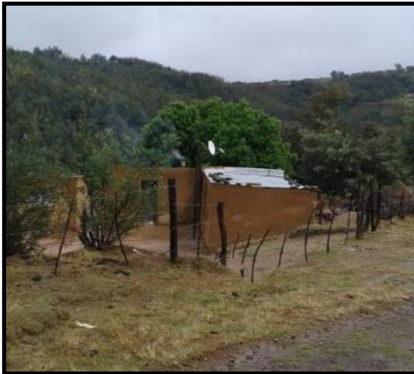
Figure 4. Contemporary homestead adjacent to Mahlathini Road. No graves were observed on the footprint.