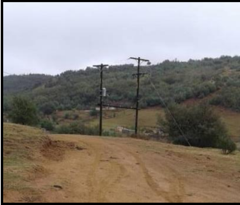
Figure 3. The existing Mahlathini Road. Exotic wattle infestations occur adjacent to large sections of the road.