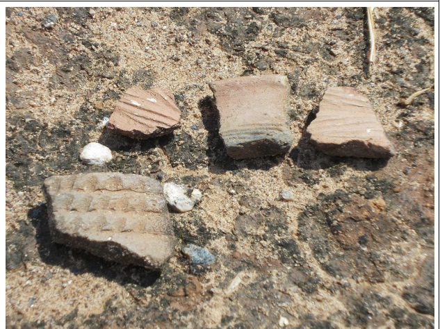
Fig 5. ceramic pieces