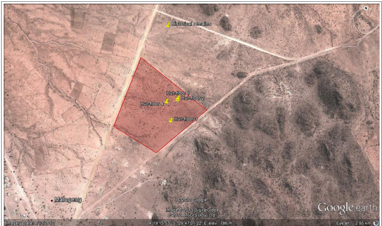
Map 1. Demarcation of heritage material recorded on site