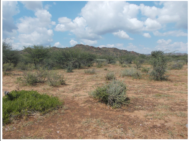
Fig 7. General view