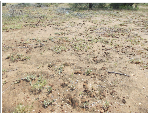
Fig 2. Hut-floor 4

Hut-floors 1: S24° 19' 12.5" E29° 46' 57.6" 2: S24° 19' 12.9" E29° 46' 57.5" 3: S24° 19' 17.4" E29° 46' 55.9" 4: S24° 19' 13.3" E29° 46' 54.9"