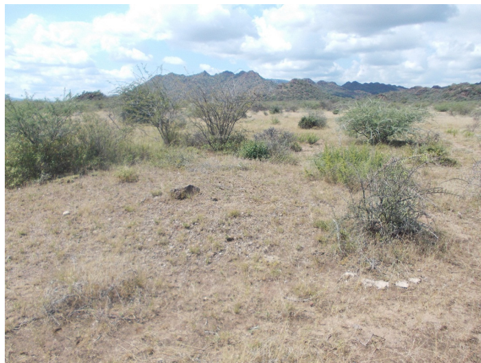
Fig 1. view of historical foundation

Site 1. Historical period hut foundation remains: S24^{\circ} 18' 56.9'' E29^{\circ} 46' 55.2''