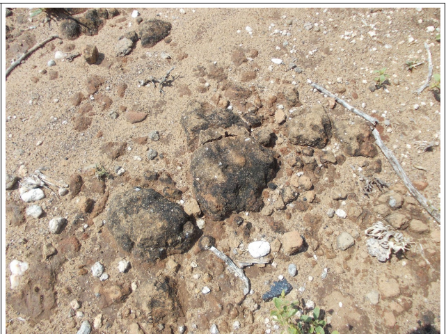
Fig 3. Hut-floor1 detail