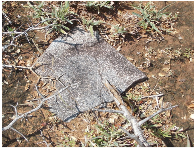
Fig 6. Lower grinding-stone