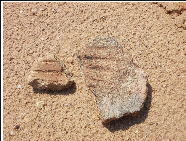
Fig 4. Ceramic pieces