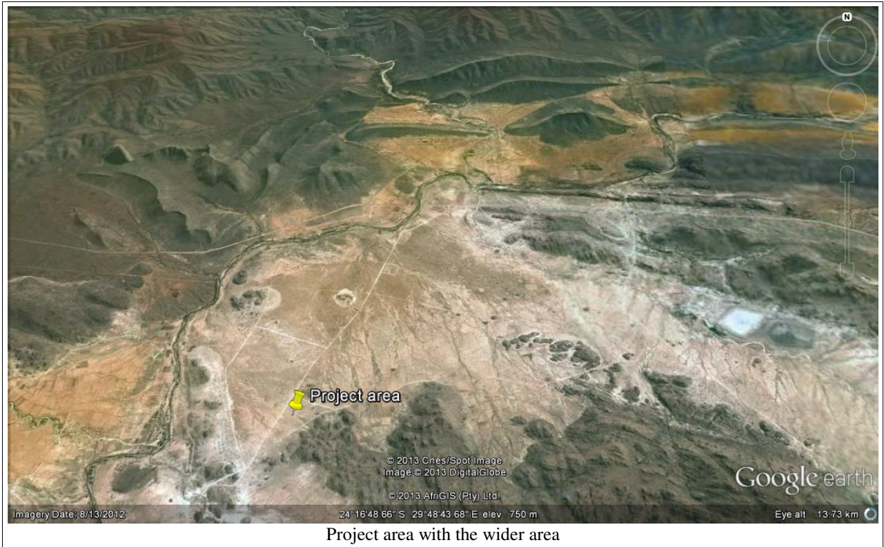
Project area with the wider area