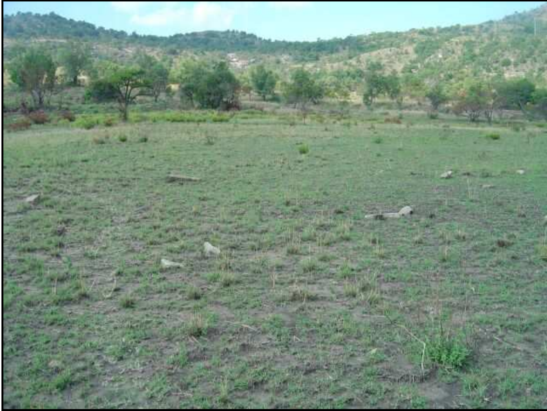
• Figure 8 - General site photo