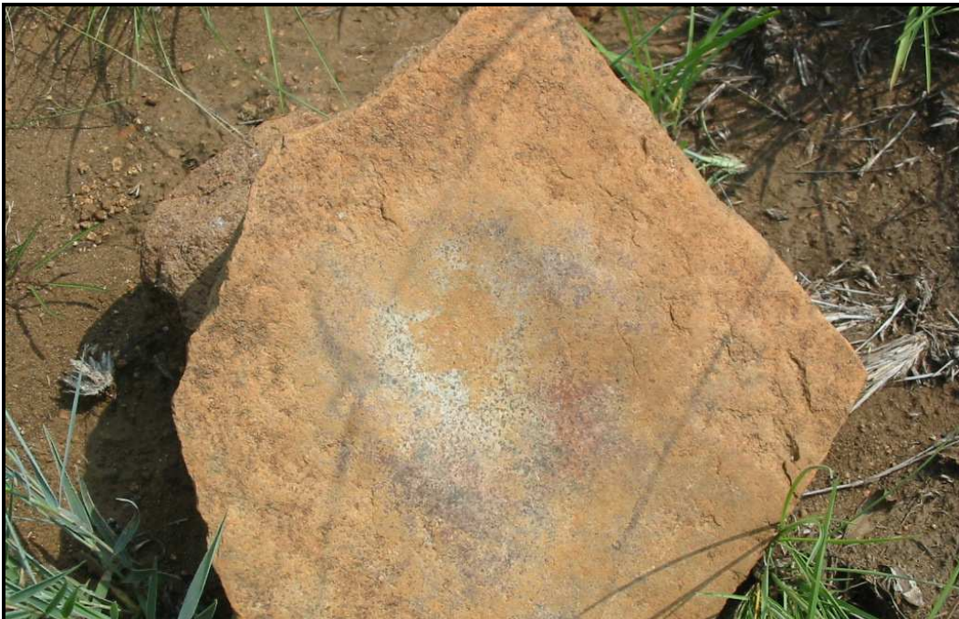
• Figure 2 – Lower grinding stone