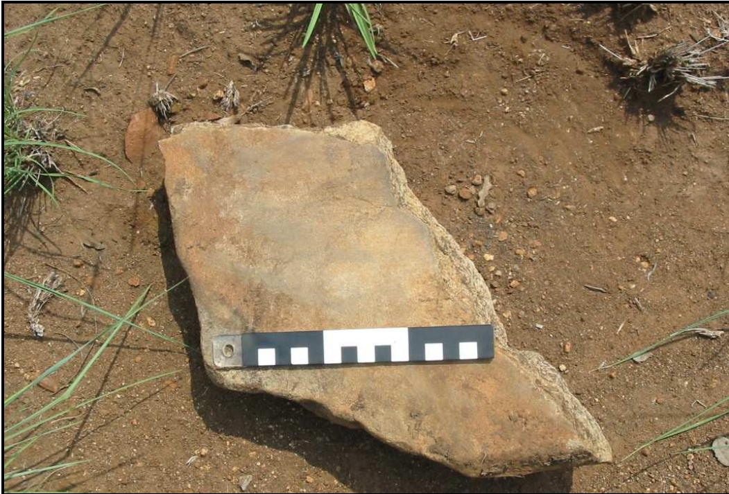
• Figure 1 – Lower grinding stone