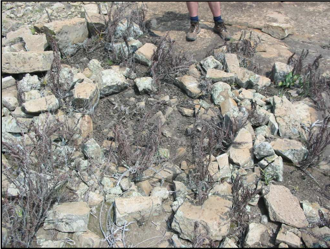
• Figure 4 – Dilapidated stone feature

are therefore of low significance on its own. However, the structure might be linked to the Iron Age site ( MHC001 ) which will constitute a higher significance to the site.