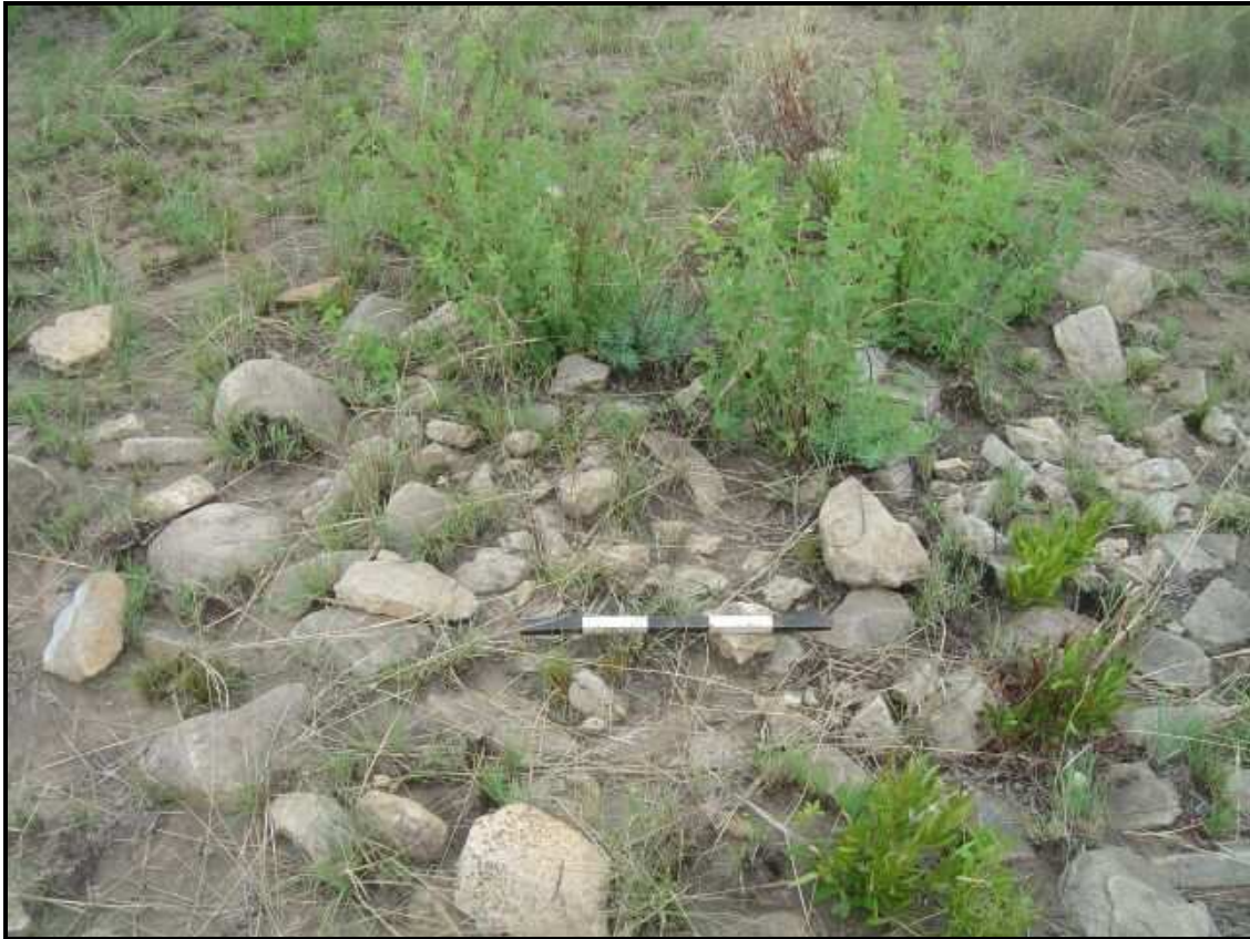
• Figure 7 – Grain bin platform