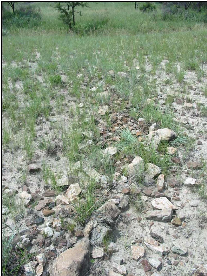
• Figure 5 - Disturbed stone walling

This is the location of a low stonewall that is constructed of double packed stones that serves as foundations, the space between was subsequently filled in with rubble and conforms to Iron Age building methods. The feature shows the same characteristics as some of the stone wall features found at site MHC001 . The feature is close to a rock bed and no significant deposit is present. There for the site is of low significance and the mitigation on site MHC001 will suffice in the clarification and relationship of the sites.