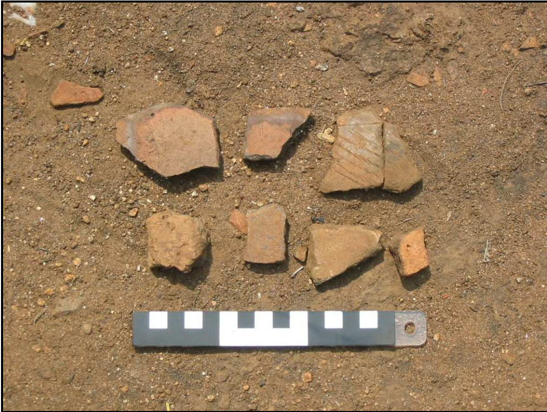
• Figure 3 – Decorated and undecorated ceramics