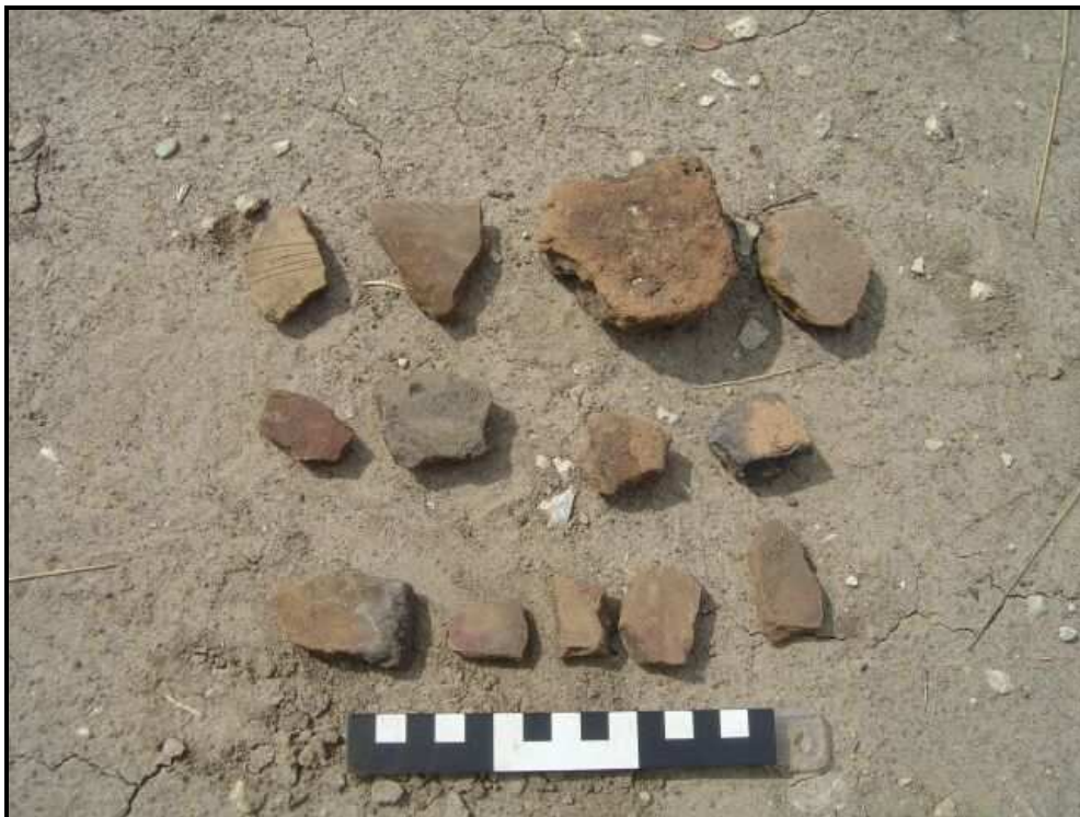
• Figure 6 – Collection of ceramics from the site

If the site is impacted upon, the relationship between the stonewall features and the Moloko ceramics needs to be clarified through small test excavations. The site is of medium significance.