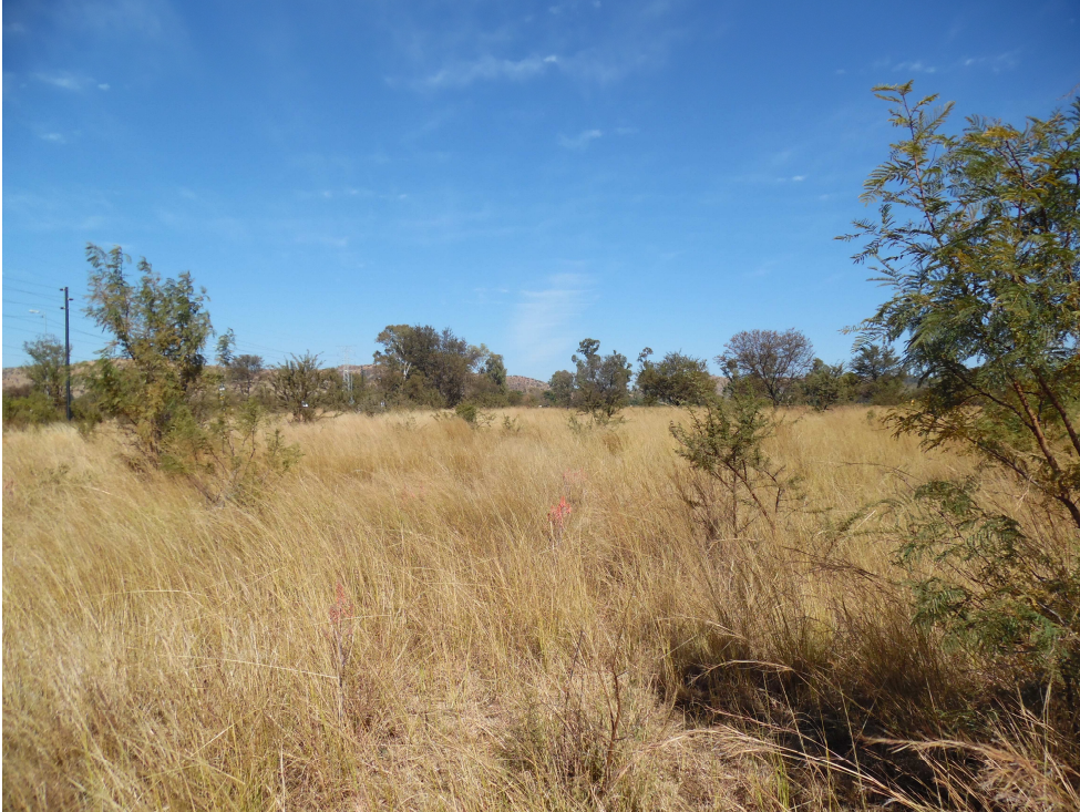
Figure 5: Site characteristics: Photograph taken towards the south