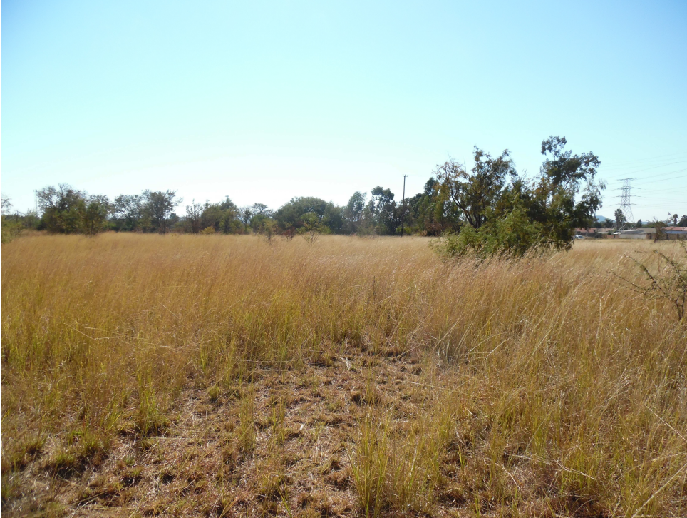
Figure 3: Site characteristics: Photograph taken towards the north