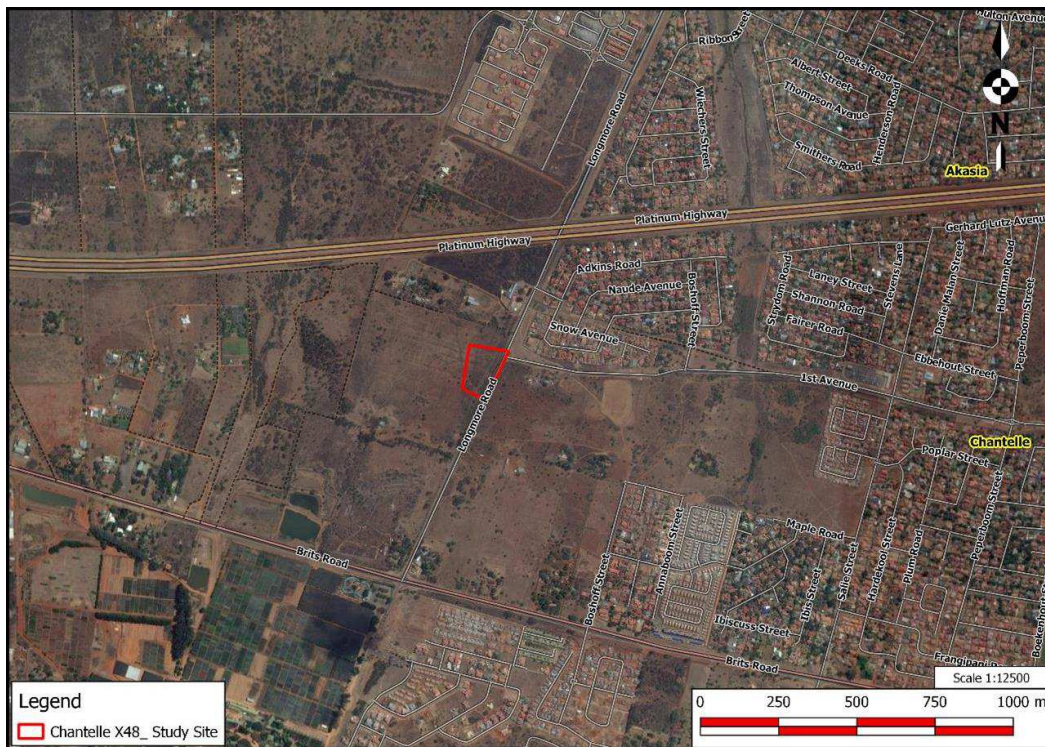
Figure 2: Aerial map