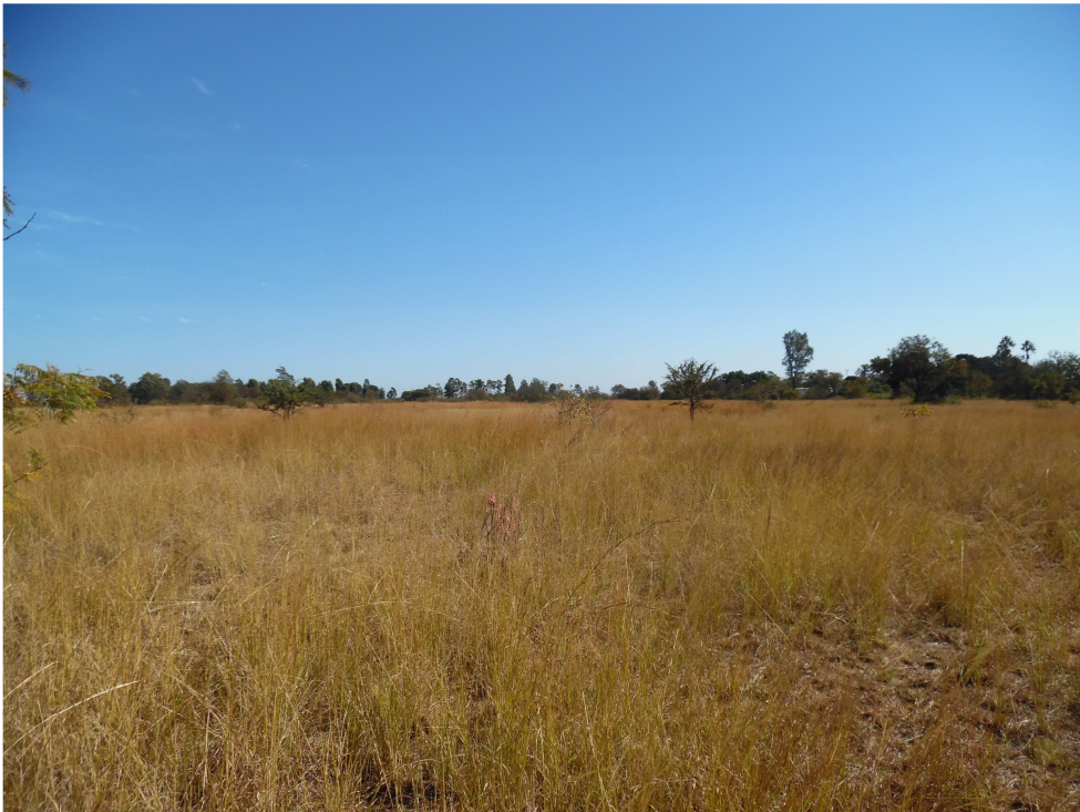
Figure 6: Site characteristics: Photograph taken towards the west