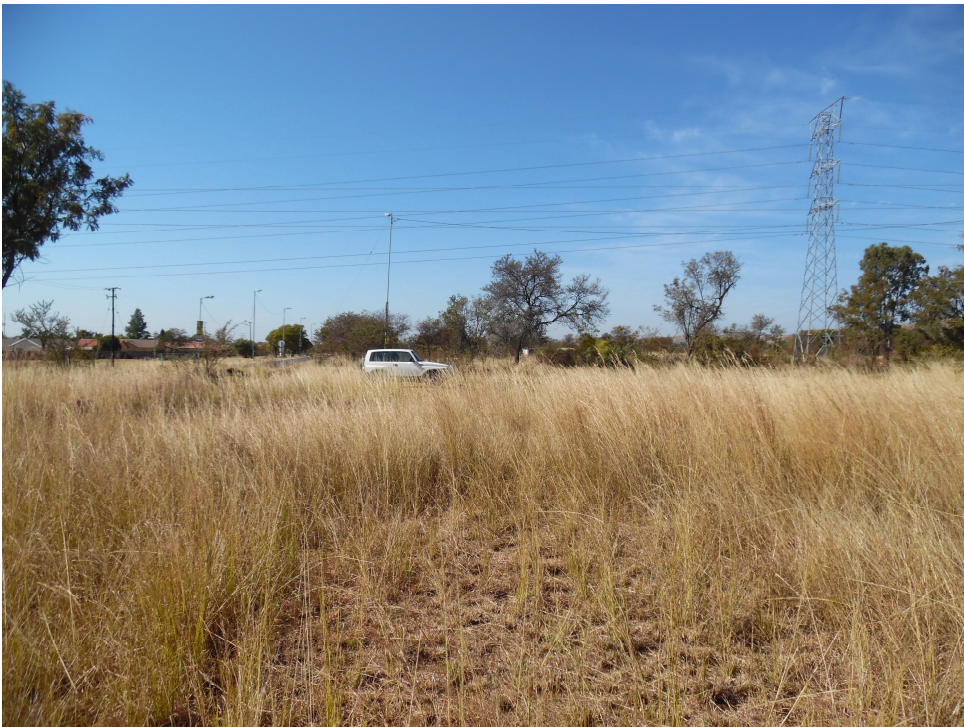
Figure 4: Site characteristics: Photograph taken towards the east