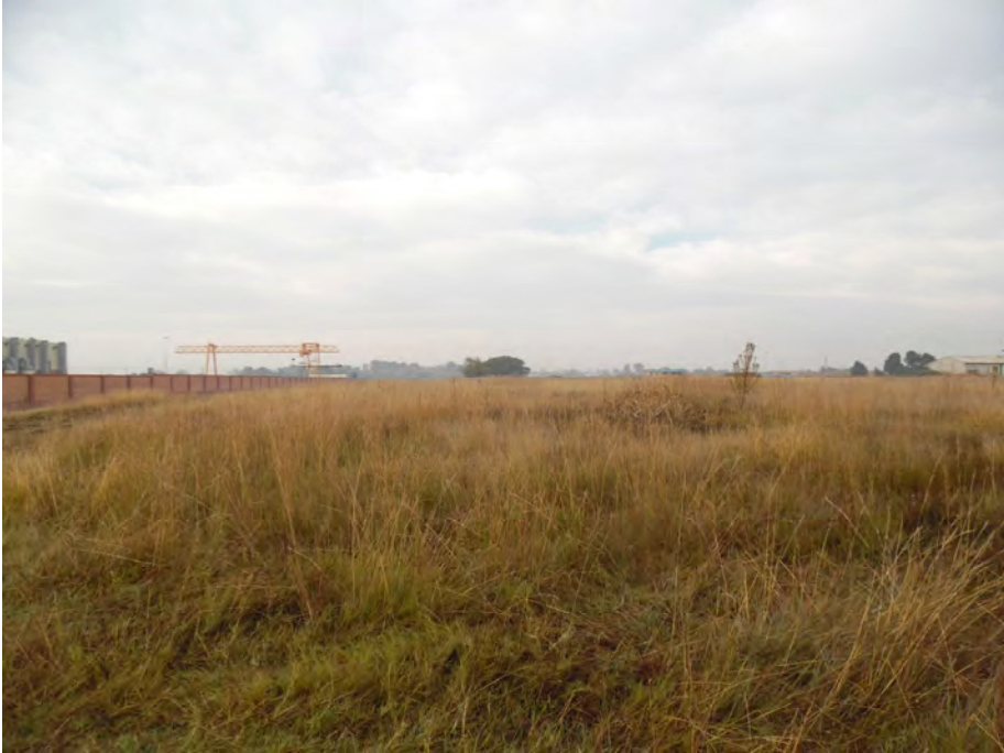
Figure 4: Area earmarked for development: Photograph taken towards the south