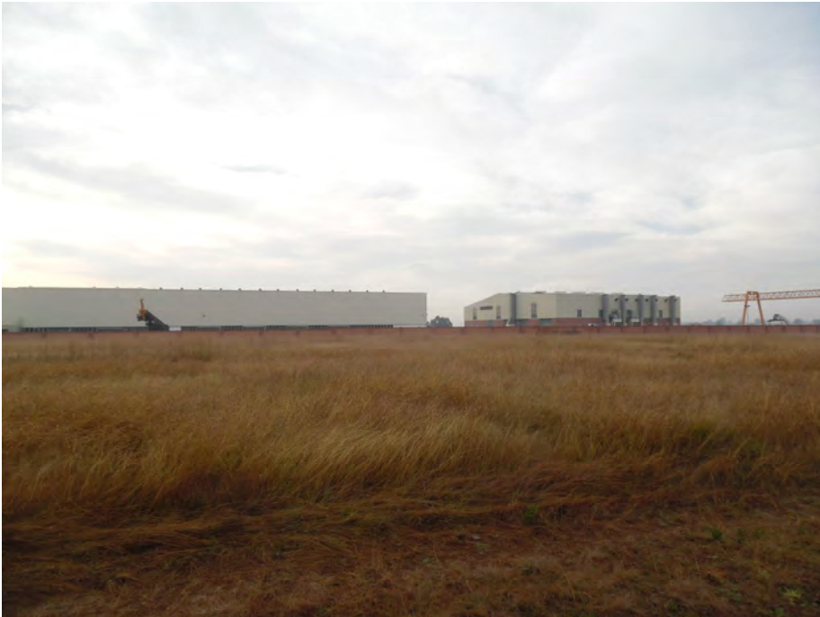
Figure 5: Area earmarked for development: Photograph taken towards the east