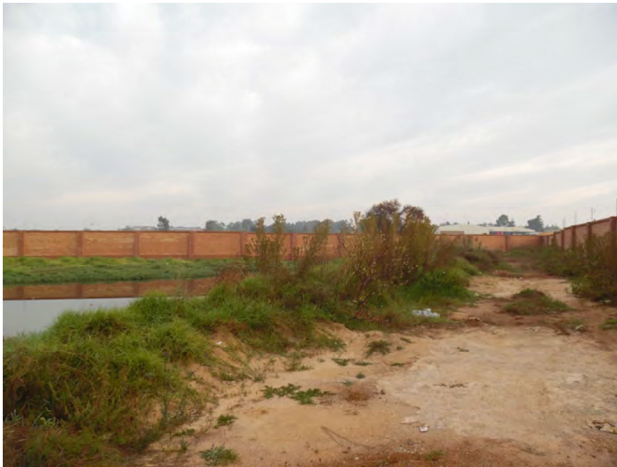
Figure 3: Area earmarked for development: Photograph taken towards the north