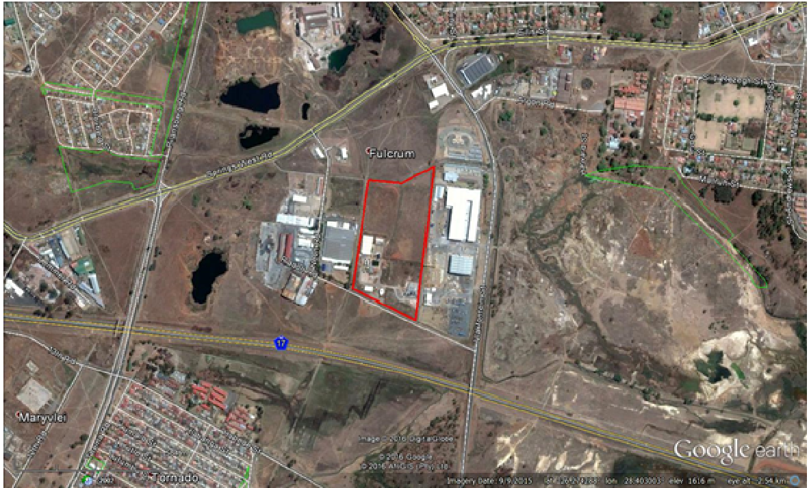
Figure 2: Location of study area