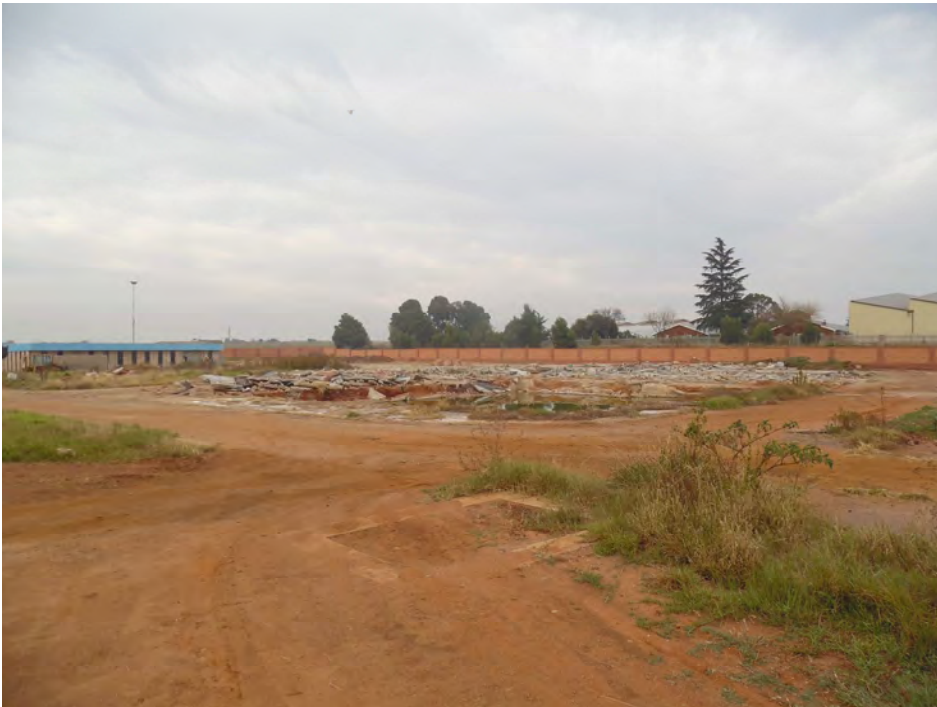
Figure 7: Area earmarked for development: Photograph taken towards the west