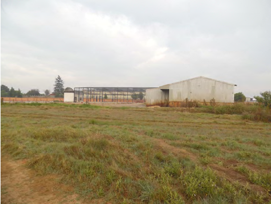
Figure 6: Area earmarked for development: Photograph taken towards the west