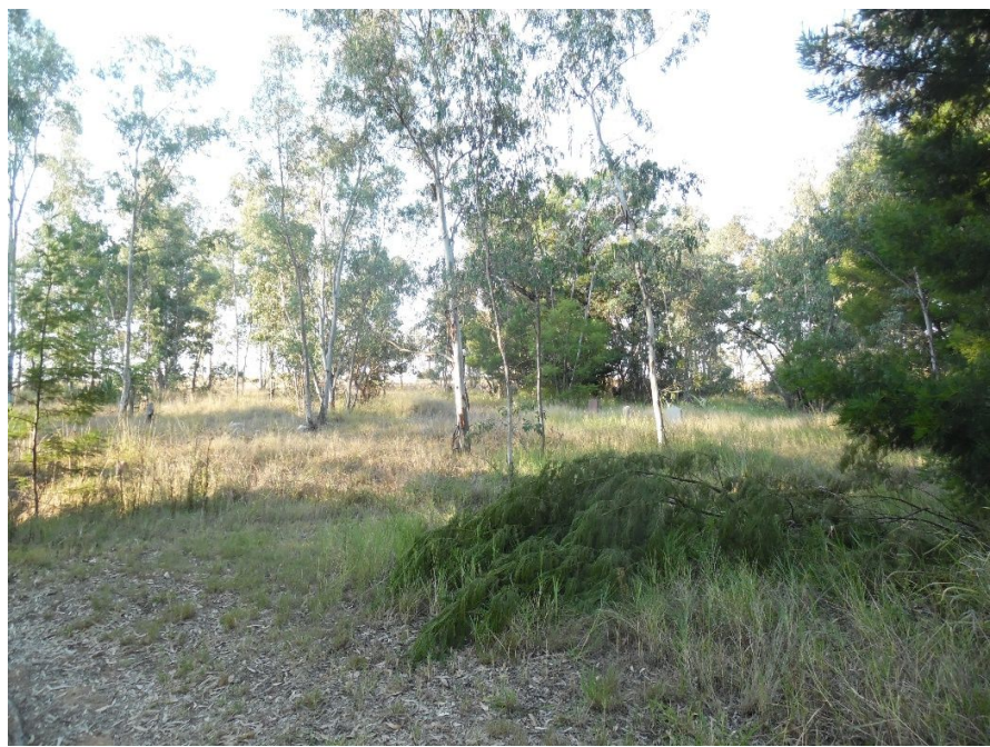
Figure 8: Site characteristics