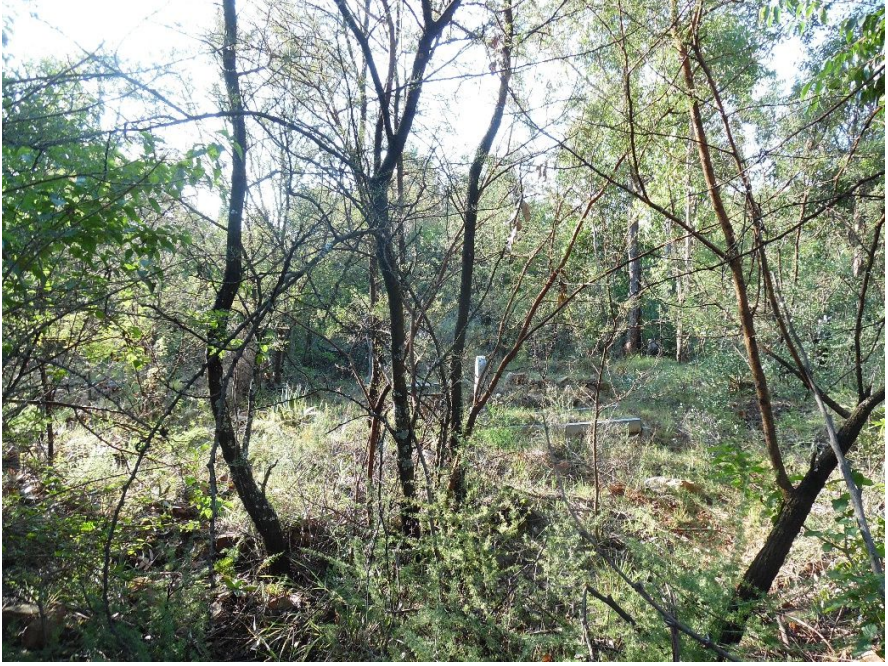
Figure 4: Site characteristics