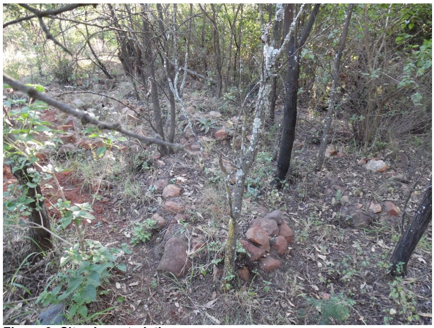
Figure 3: Site characteristics