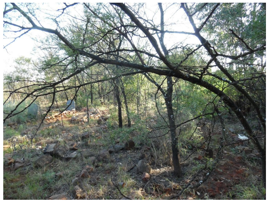
Figure 2: Site characteristics