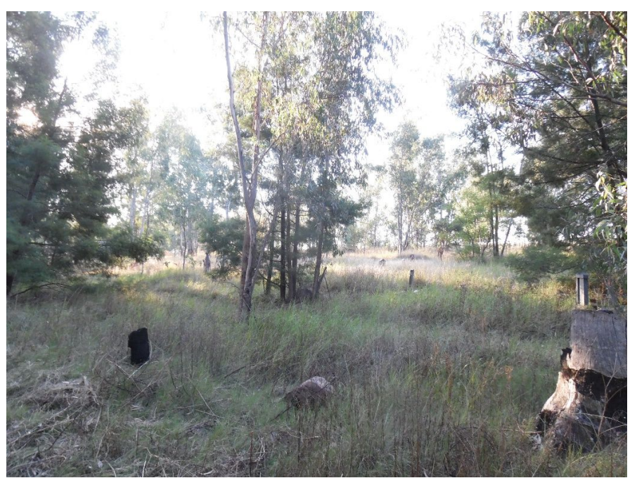
Figure 6: Site characteristics

Cemetery 2 situated at co-ordinates S25° 39'31.8" E028° 33' 08.6"