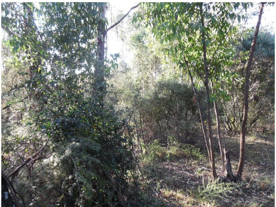
Figure 5: It appears that a fence was erected at some stage to demarcate the cemetery