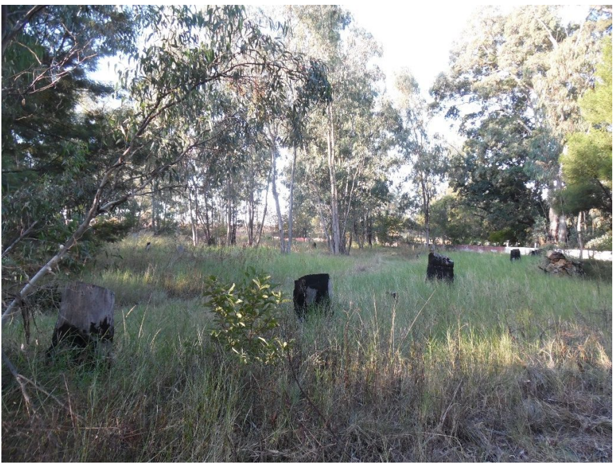
Figure 7: Site characteristics