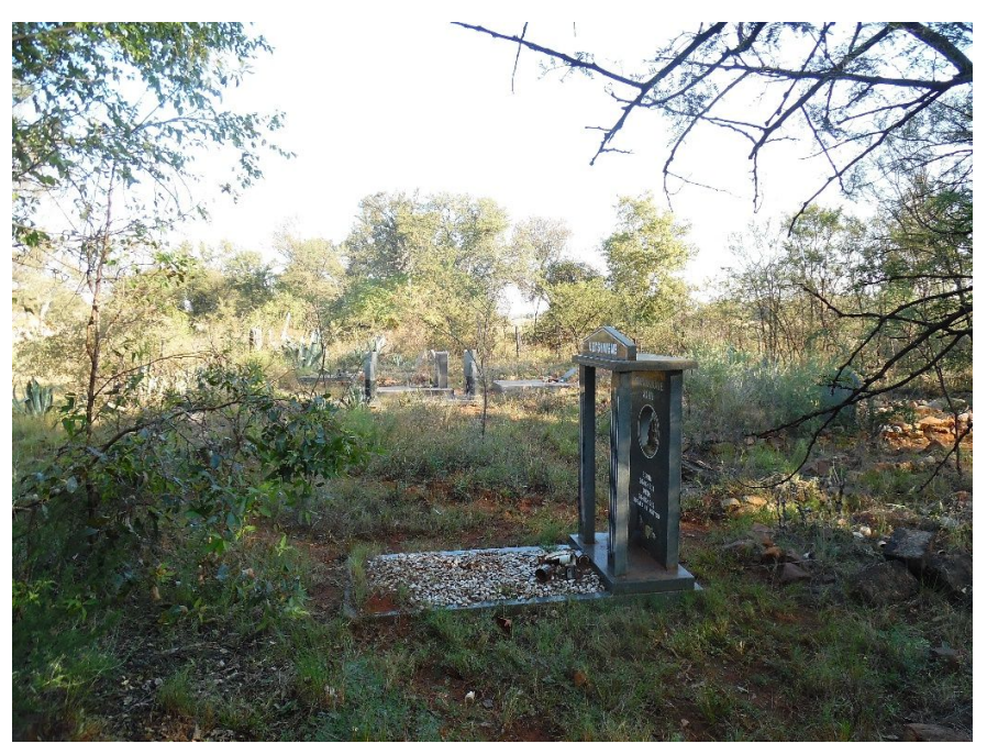
Figure 1: Site characteristics

Cemetery 1 situated at co-ordinates S25° 39'23.7" E028° 32' 26.8"