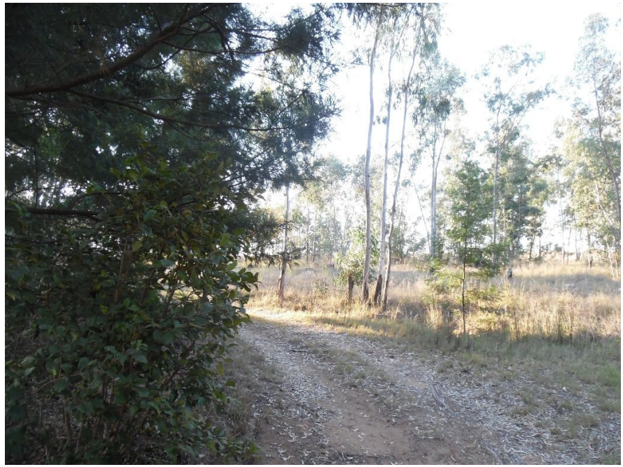
Figure 9: Site characteristics