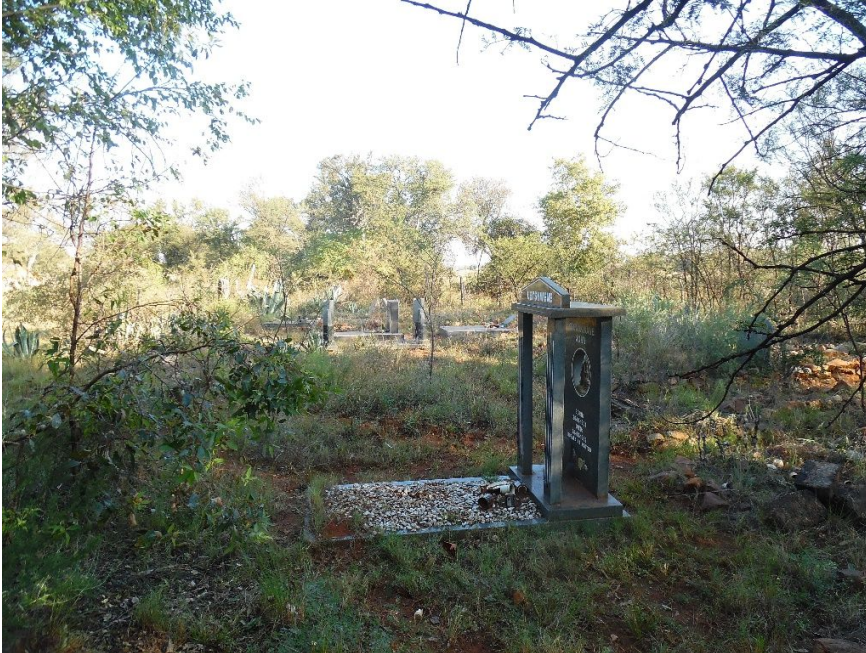
Figure 1: Site characteristics

Cemetery 1 situated at co-ordinates S25° 39'23.7" E028° 32' 26.8"