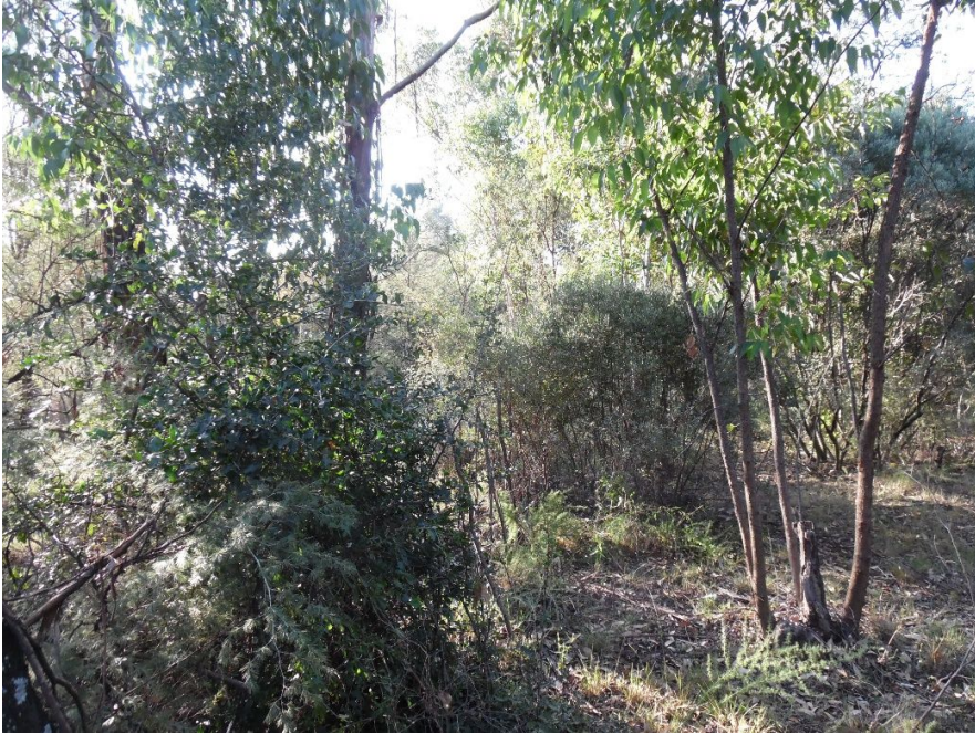
Figure 5: It appears that a fence was erected at some stage to demarcate the cemetery