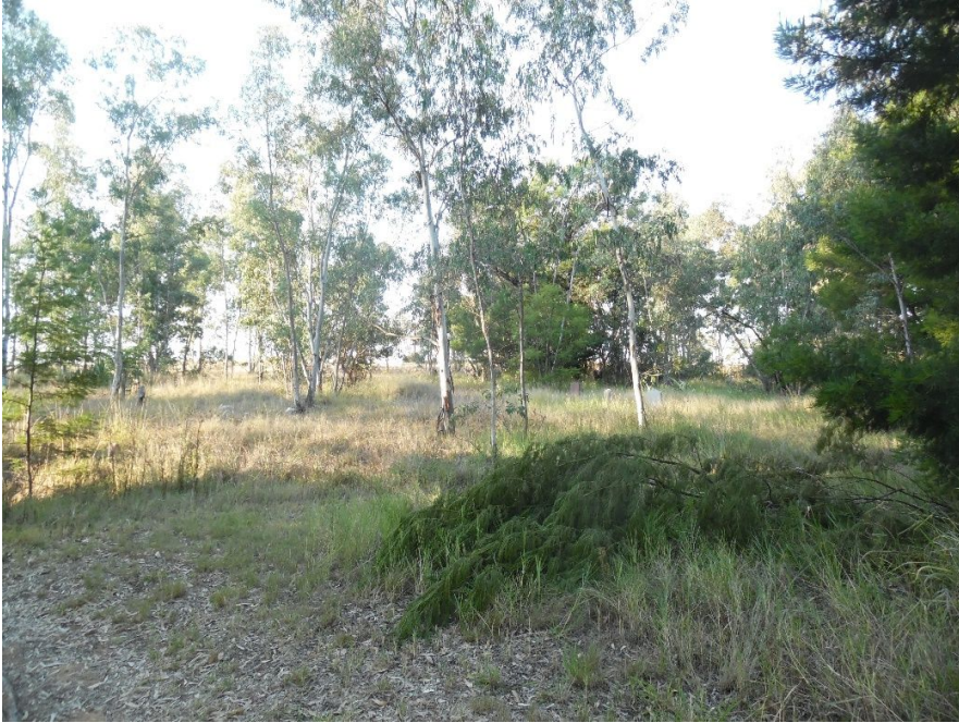
Figure 8: Site characteristics