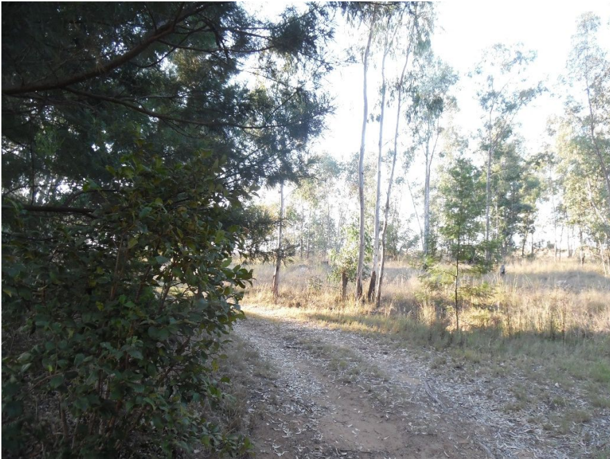
Figure 9: Site characteristics