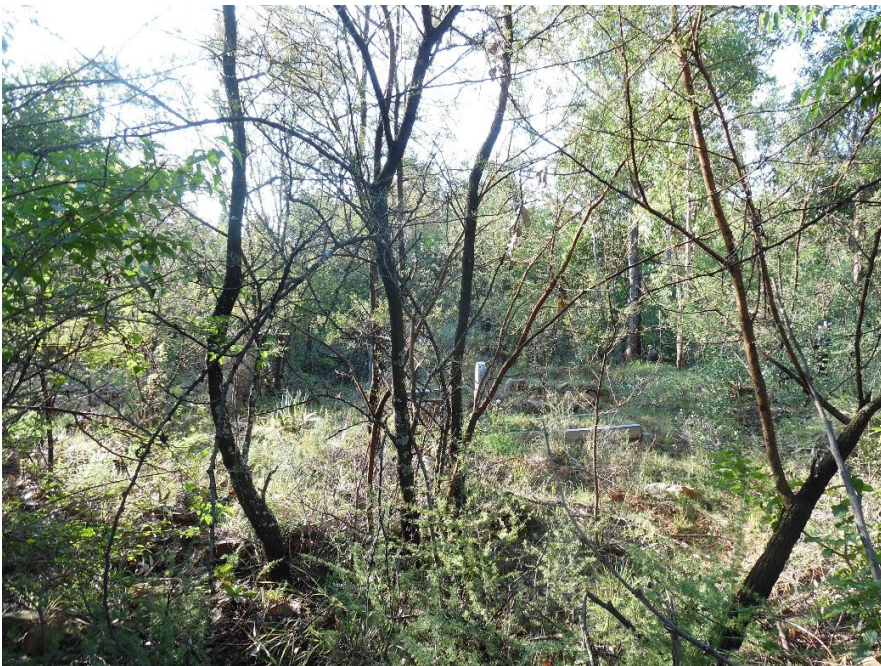
Figure 4: Site characteristics