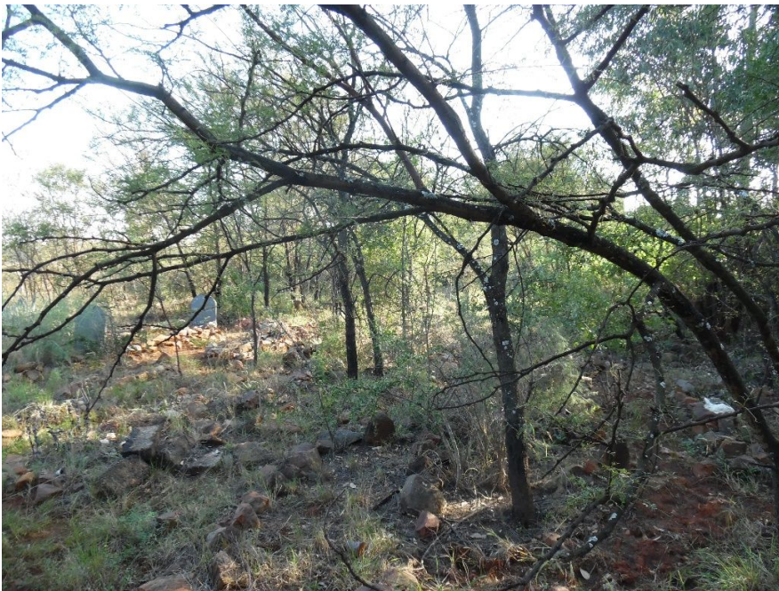
Figure 2: Site characteristics