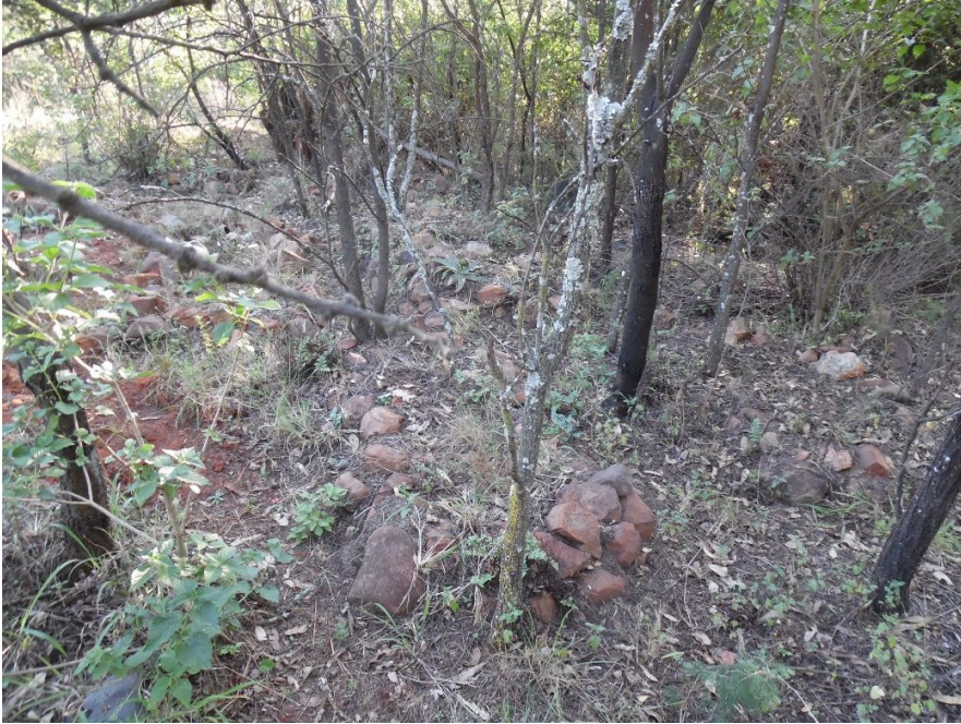
Figure 3: Site characteristics