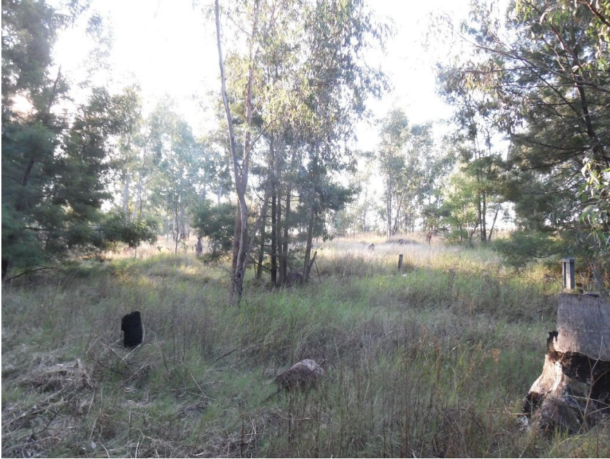
Figure 6: Site characteristics

Cemetery 2 situated at co-ordinates S25° 39'31.8" E028° 33' 08.6"