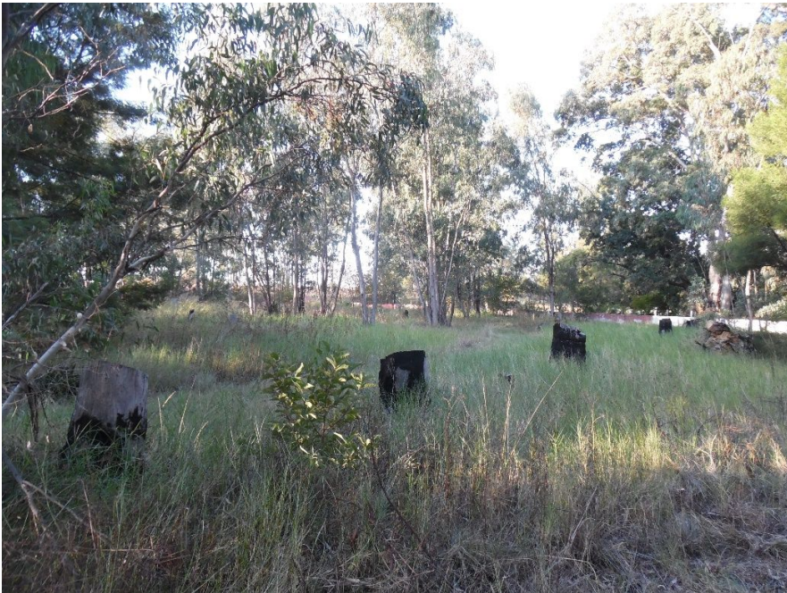
Figure 7: Site characteristics