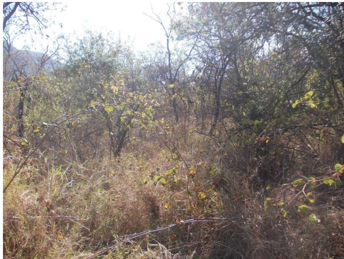
Fig 2. View of vegetation density