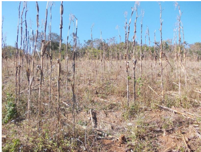
Fig 1. View of agricultural field