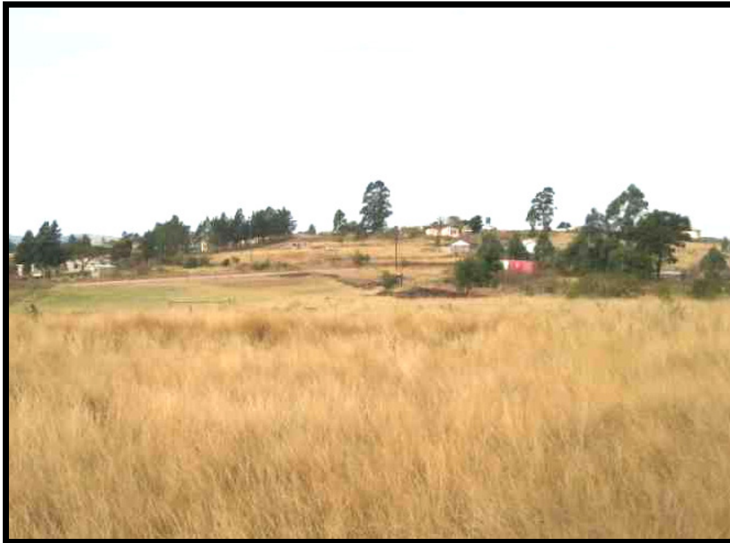
Figure 3. Photograph showing the area demarcated for the proposed Mpaphala Clinic