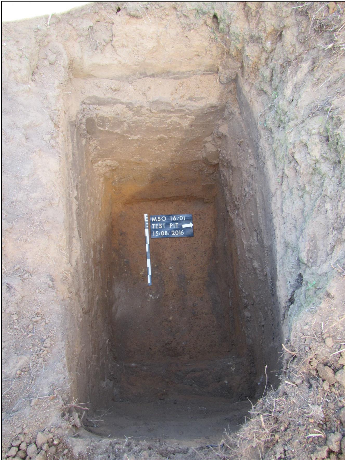
Figure 6 – MSO 16/01, Burial pit.