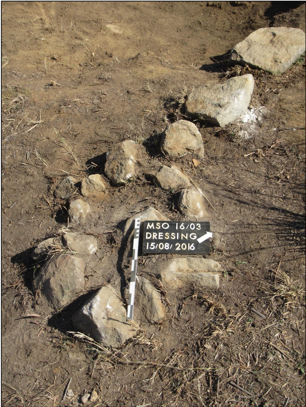
Figure 10 – MSO 16/03, Dressing.