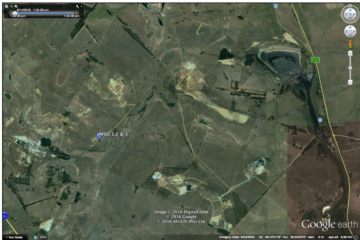
Figure 13 – Location of the site in relation to the Msobo Coal (top right).