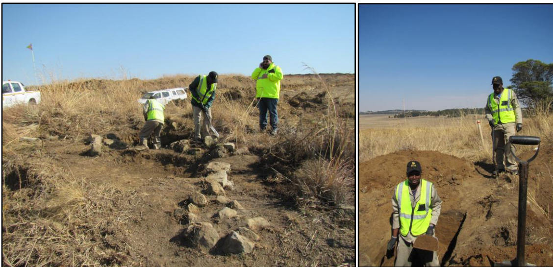
Figure 1 & Figure 2 – The test excavations were conducted by hand.

The grave pits in MSO 1 and 2 were quite easy to follow and both were excavated until culturally sterile soil was reached. No human or cultural remains were found in either case. MSO 3 was also excavated but did not contain a grave pit or human remains. The three excavations are detailed below, under section 3.2.