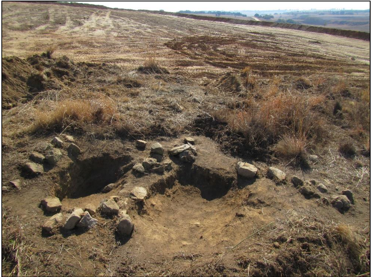
Figure 3 – View of the three features before excavation. The indentation demarcating MSO 1 & 2 can clearly be seen. MSO 3 is to the right.