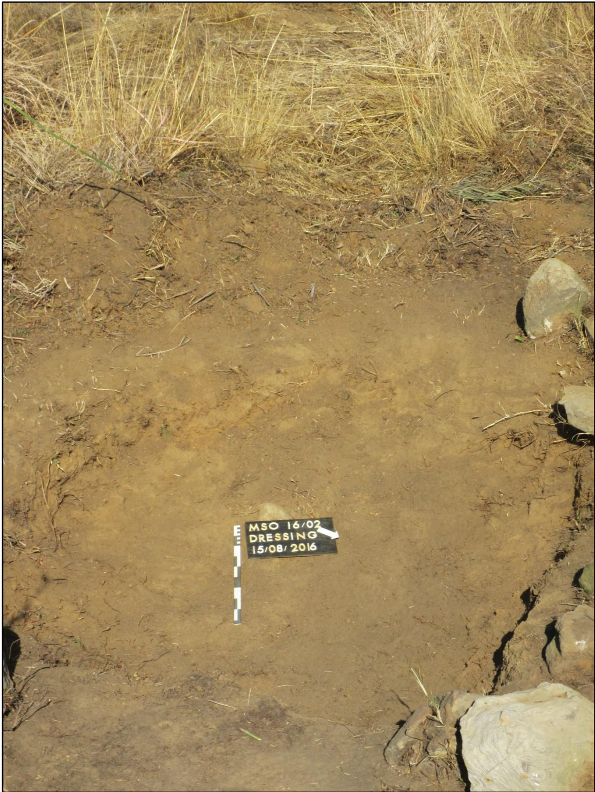
Figure 7 – MSO 16/02, Dressing.