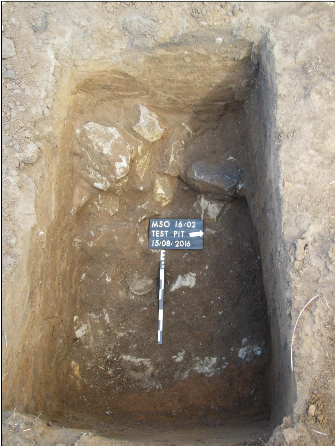
Figure 8 – MSO 16/02. Rocks used to backfill the grave pit after the previous excavation. The rocks were possibly previously part of the grave dressing.