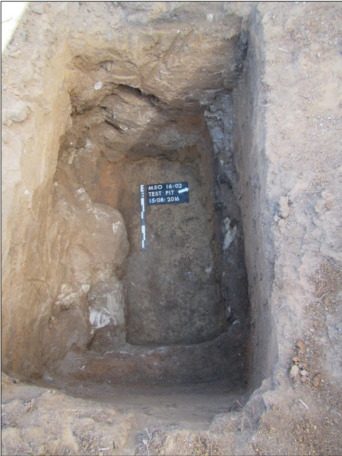
Figure 9 - MSO 16/02. Bottom of grave pit