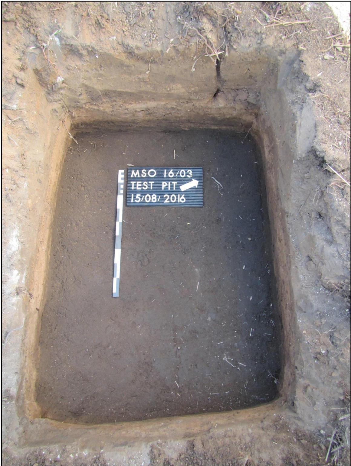
Figure 11 – MSO 16/03, bottom of excavation.