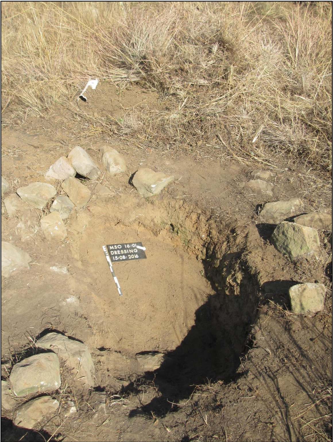
Figure 5 – MSO 16/01, Dressing.