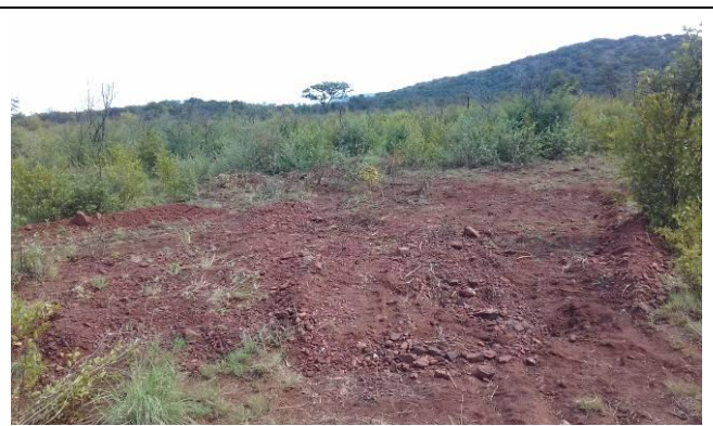
Fig 2. View of borrow pit 0 area