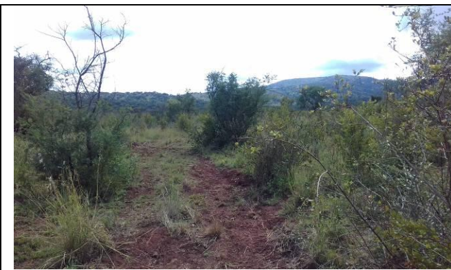
Fig 1. View of borrow pit 0 area

Proposed development: Establishment of a new borrow pit (0) for the N11 upgrading