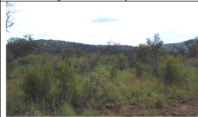
Fig 3: View of borrow pit 0 area