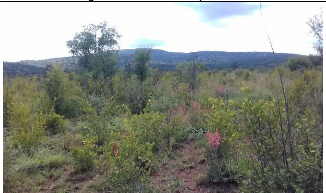
Fig 4. View of borrow pit 0 area