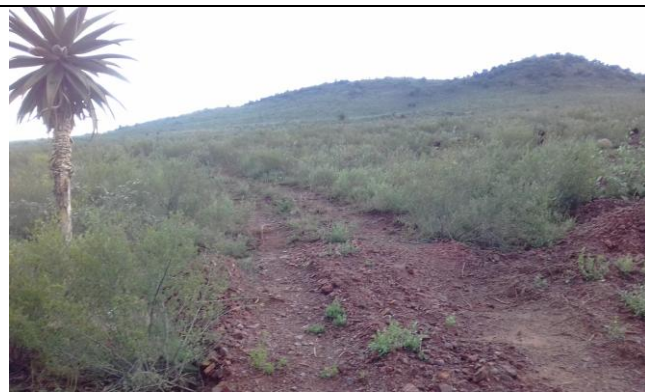
Fig 1. View of borrow pit 4a area

Proposed development: Establishment of a new borrow pit (4a) for the N11 upgrading