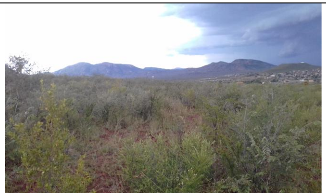
Fig 2. View of borrow pit 4a area