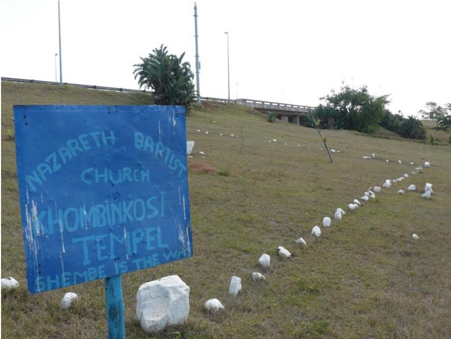
Plate 3. The sign of the Nazareth Baptist Church at the place of worship.