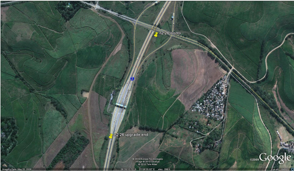
Figure 2. Google Earth image of isonto location.