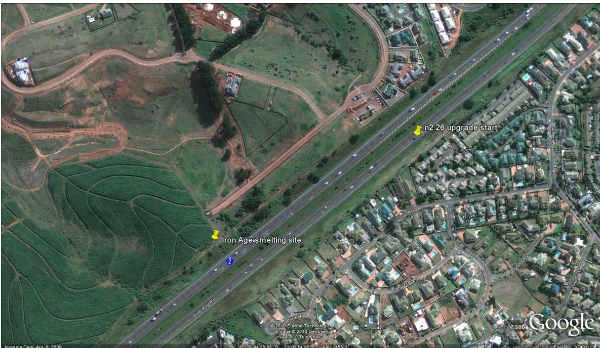
Figure 3. Google Earth image of smelting site location.

An Iron Age smelting site is located within the northbound road reserve just before the start of the proposed road upgrade, at S29 44 19.40; E31 02 49.44 (Figure 3). It extends down the westward slope onto surrounding residential estates. Its significance is unknown at present.