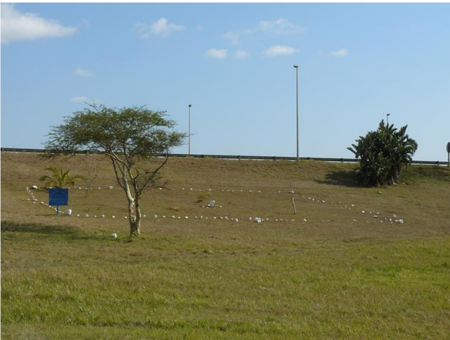
Plate 2. The Shembe place of worship north of the proposed development area.