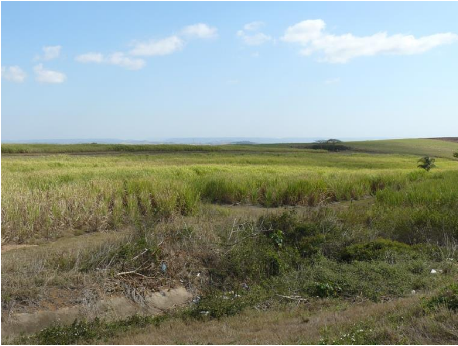
Plate 1. Canelands surrounding the proposed development area north of Durban, KwaZulu-Natal.