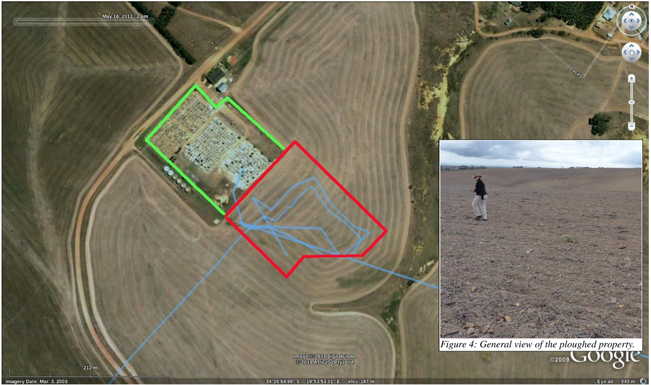
Figure 3: GPS tracking of the property.