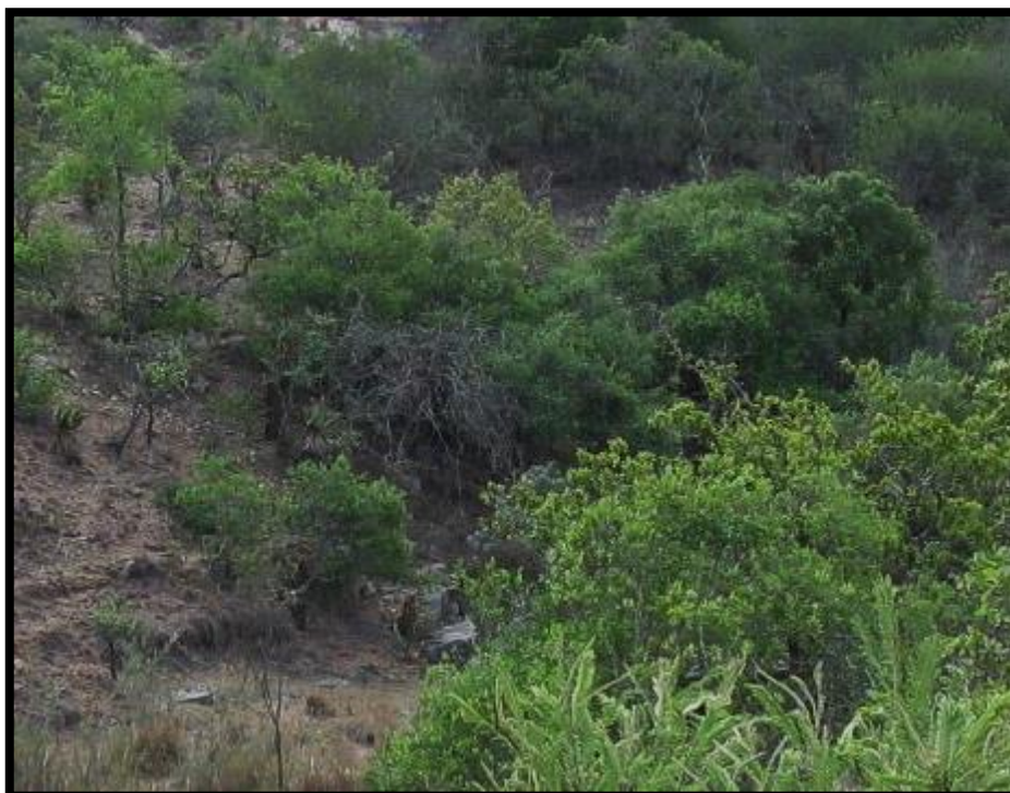
Figure 3. Area earmarked for expansion of DOT Borrow Pit 23.