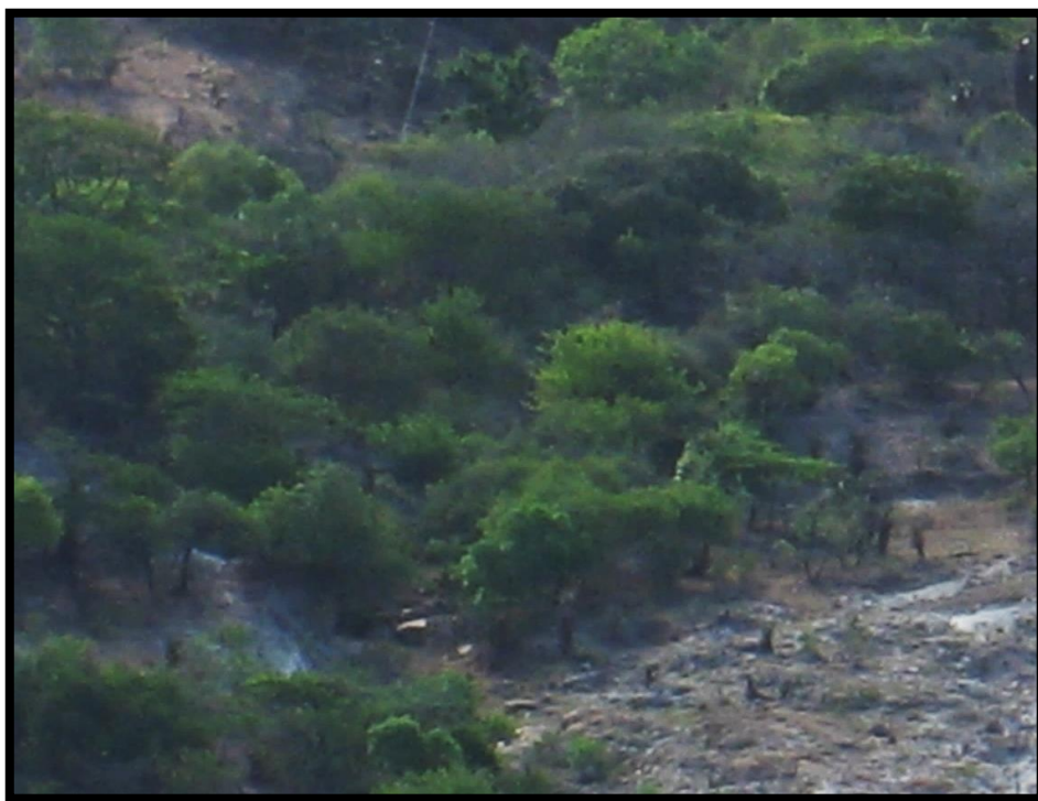
Figure 2. View over DOT Borrow Pit 23 and area earmarked for expansion