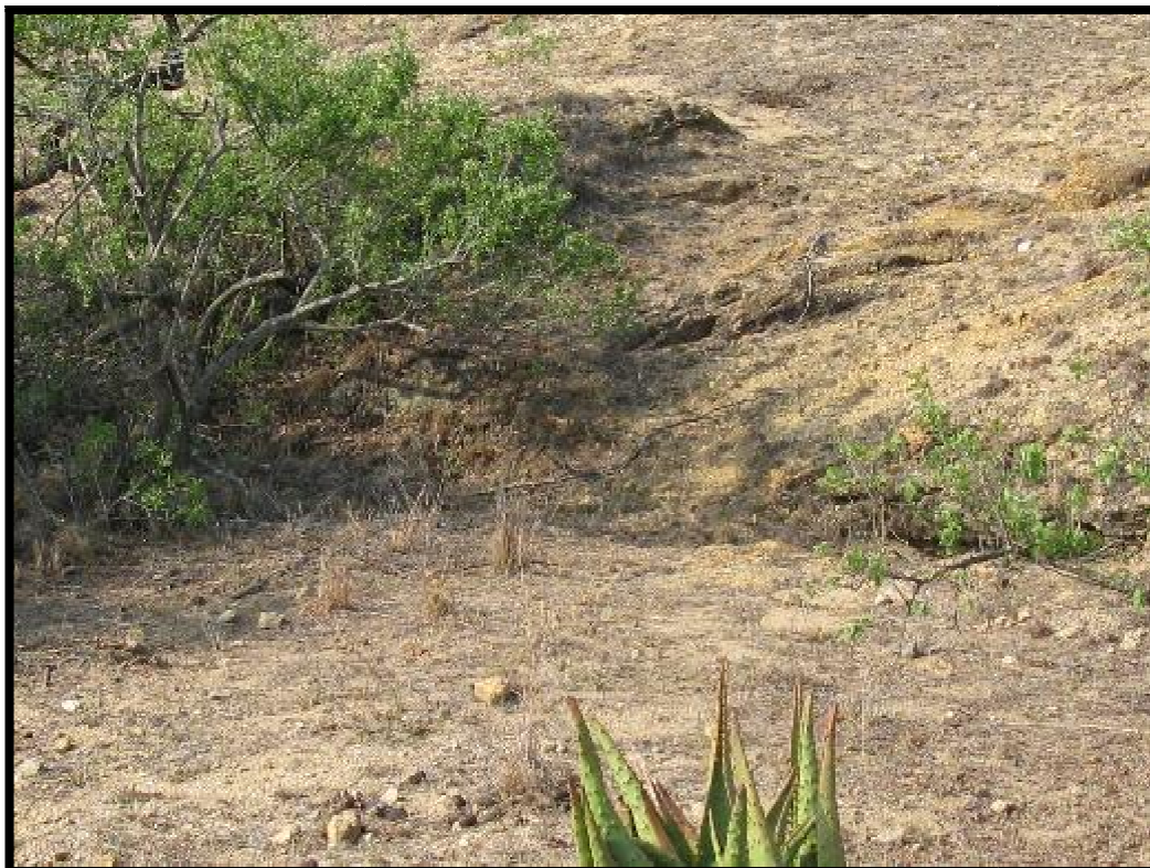
Figure 2. DOT Borrow Pit 27