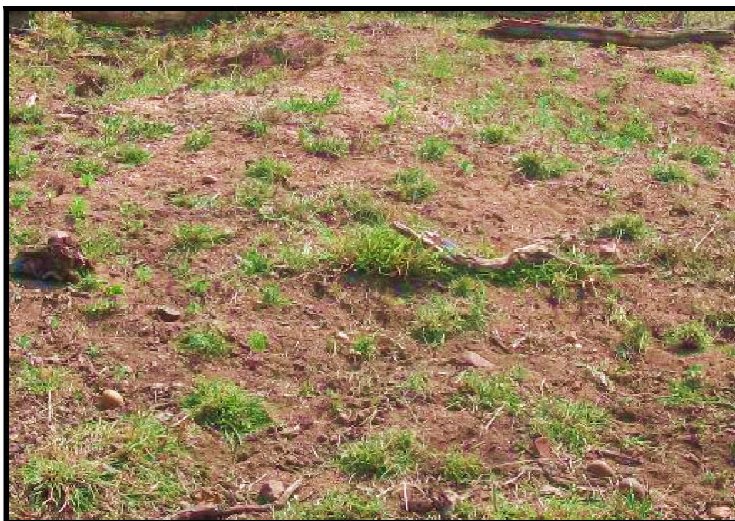
Figure 3. Area earmarked for expansion.