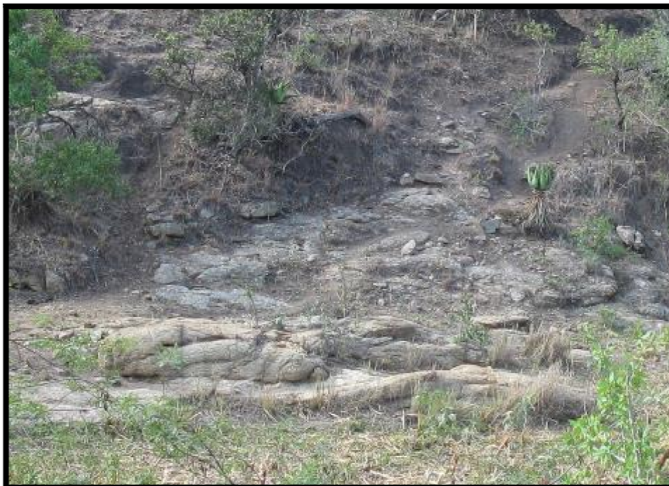
Figure 2. DOT Borrow Pit 29 near Nongoma