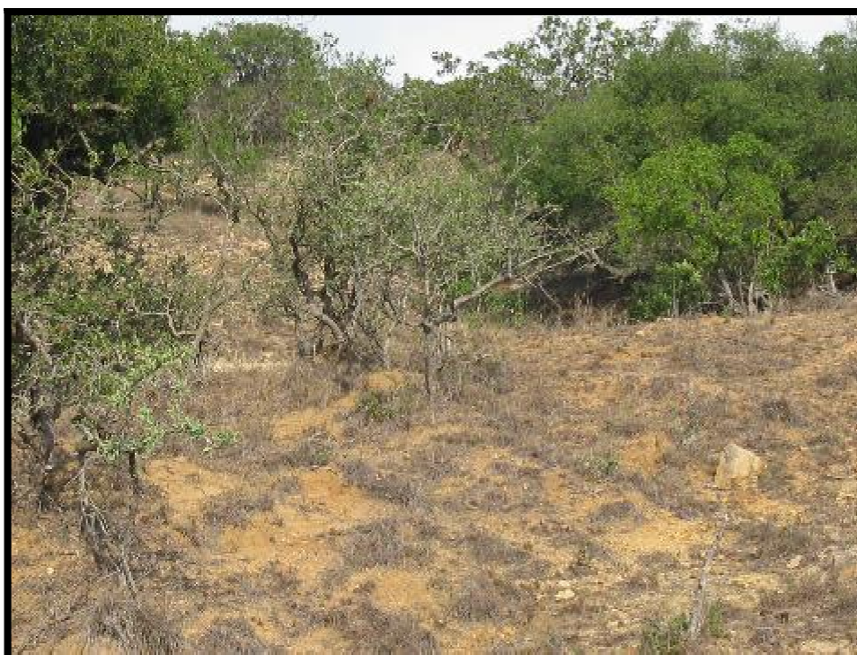
Figure 3. Area earmarked for expansion of DOT Borrow Pit 29.