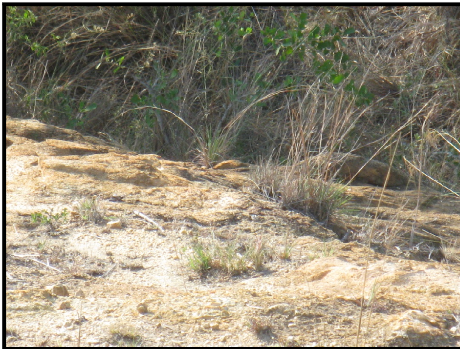
Figure 2. Edge of DOT Borrow Pit 33