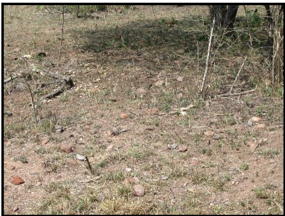
Figure 3. Area earmarked for expansion.