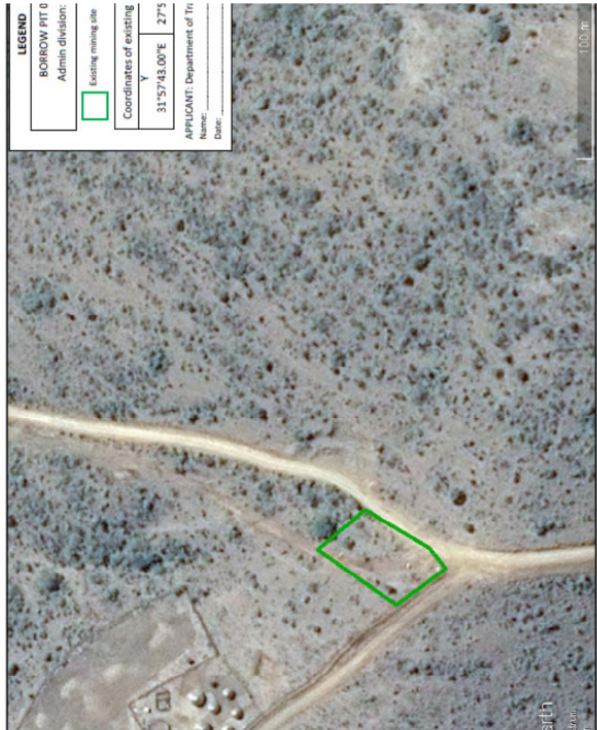
Figure 1. Google aerial photograph showing the location of Borrow Pit 36.