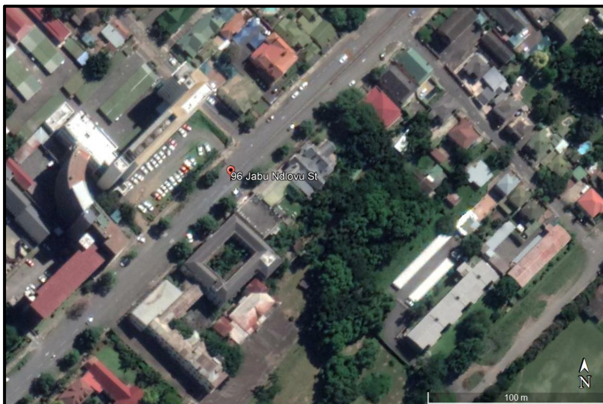
Figure 2: Satellite image showing where the site footprint is located, on the southern side of the road on the property where the old Grey's Hospital building stands.