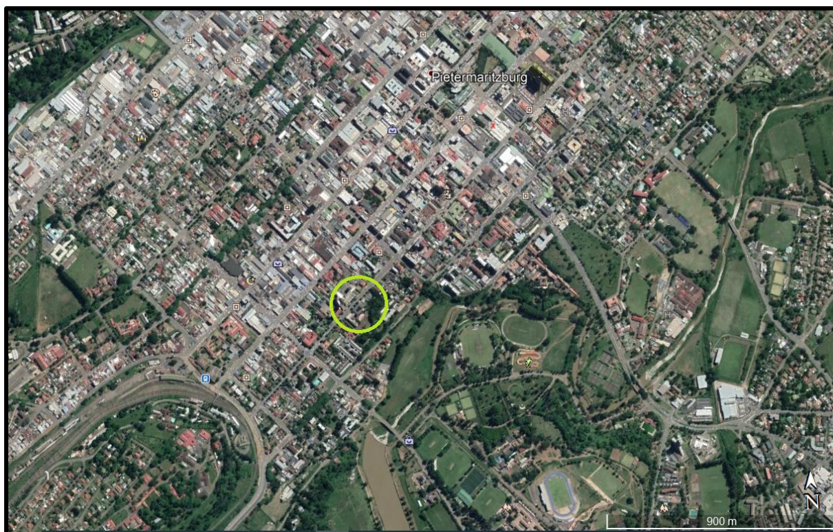
Figure 1: Satellite image showing the area of Pietermaritzburg where this development will take place, indicated with the lime-green circle. As can be seen, the area is already very urbanized and built-up so it is very likely that buried fossil material has already previously been damaged or destroyed.