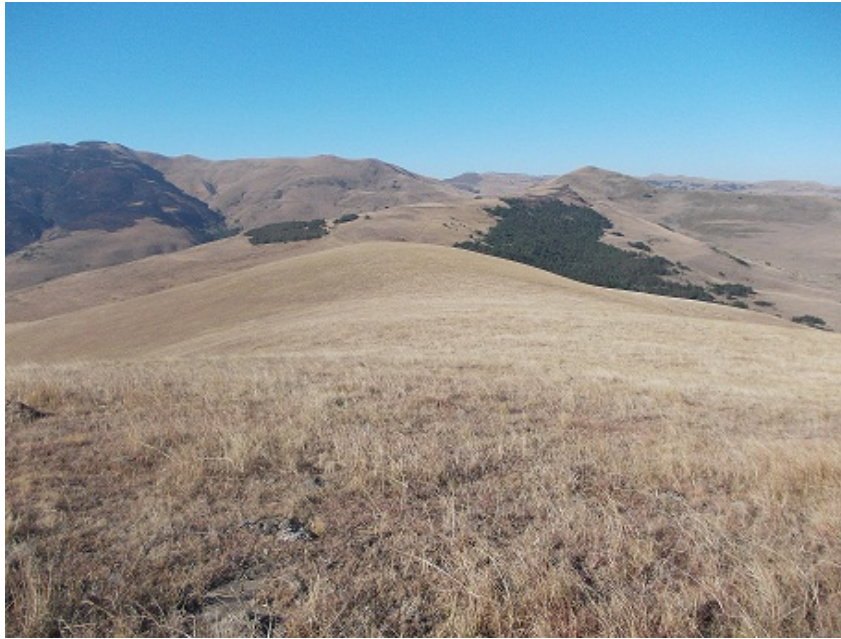
Fig 1. General view of proposed development area- North to South

General GPS co-ordinate: S30° 13' 13.5" E29° 47' 29.1"