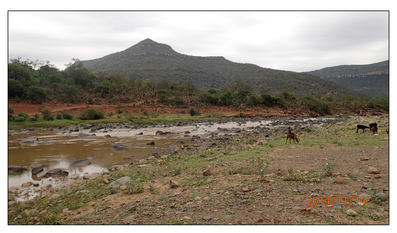
Figure 2. Proposed location of bridge