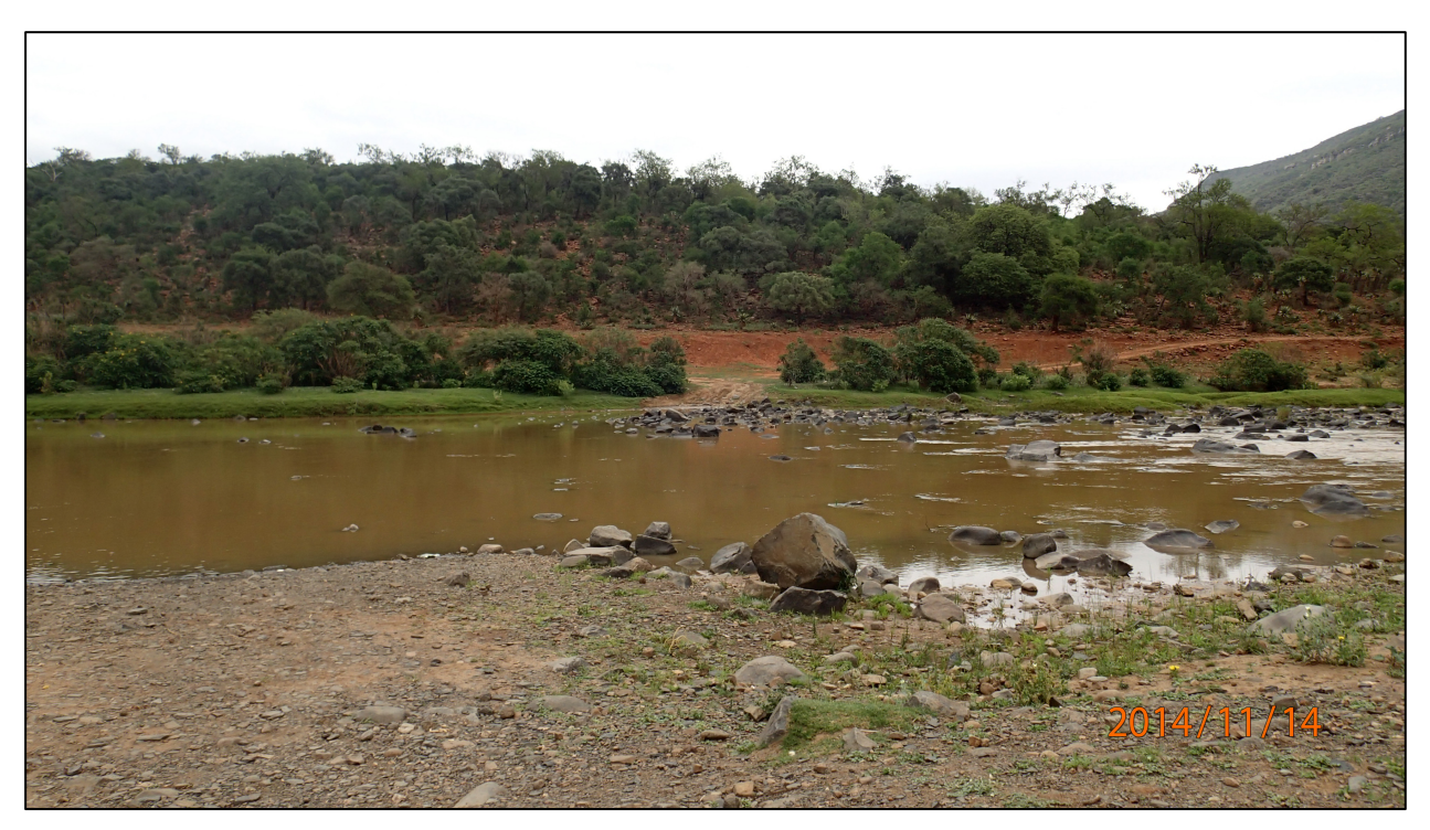
Figure 1. Location for proposed bridge