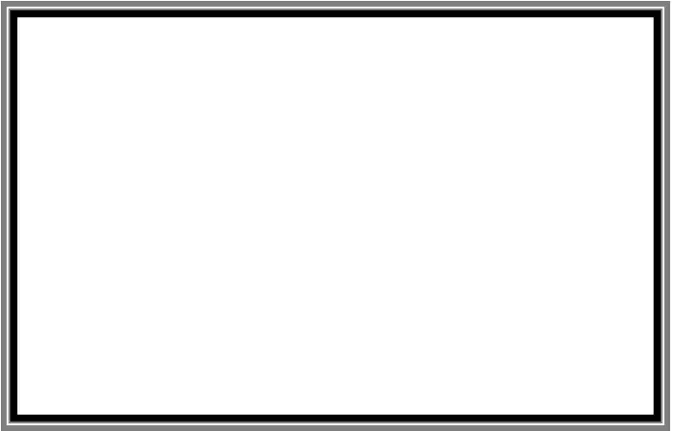
FIGURE 2 REGIONAL LOCATION OF PROPOSED DEVELOPMENT SITE (SOURCE: GOOGLE EARTH).