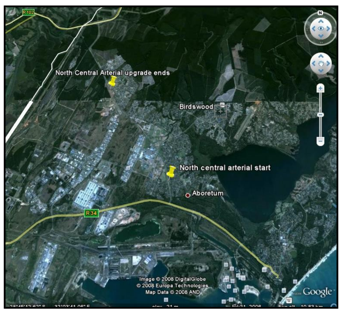
FIGURE 1: LOCATION OF THE PROPOSED AREA