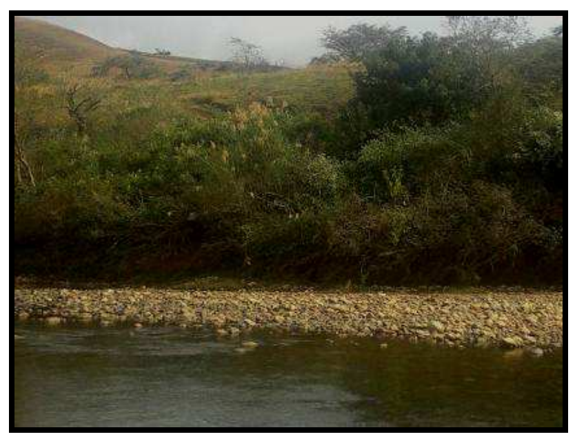
Figure 3. Location of the proposed Ngomankulu/Nsuze Bridge