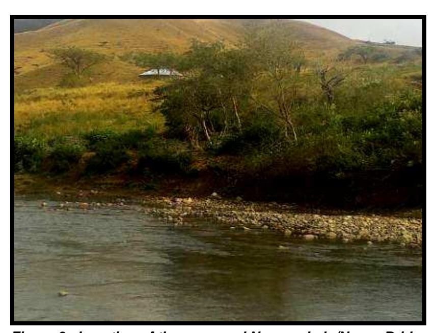
Figure 3. Location of the proposed Ngomankulu/Nsuze Bridge.