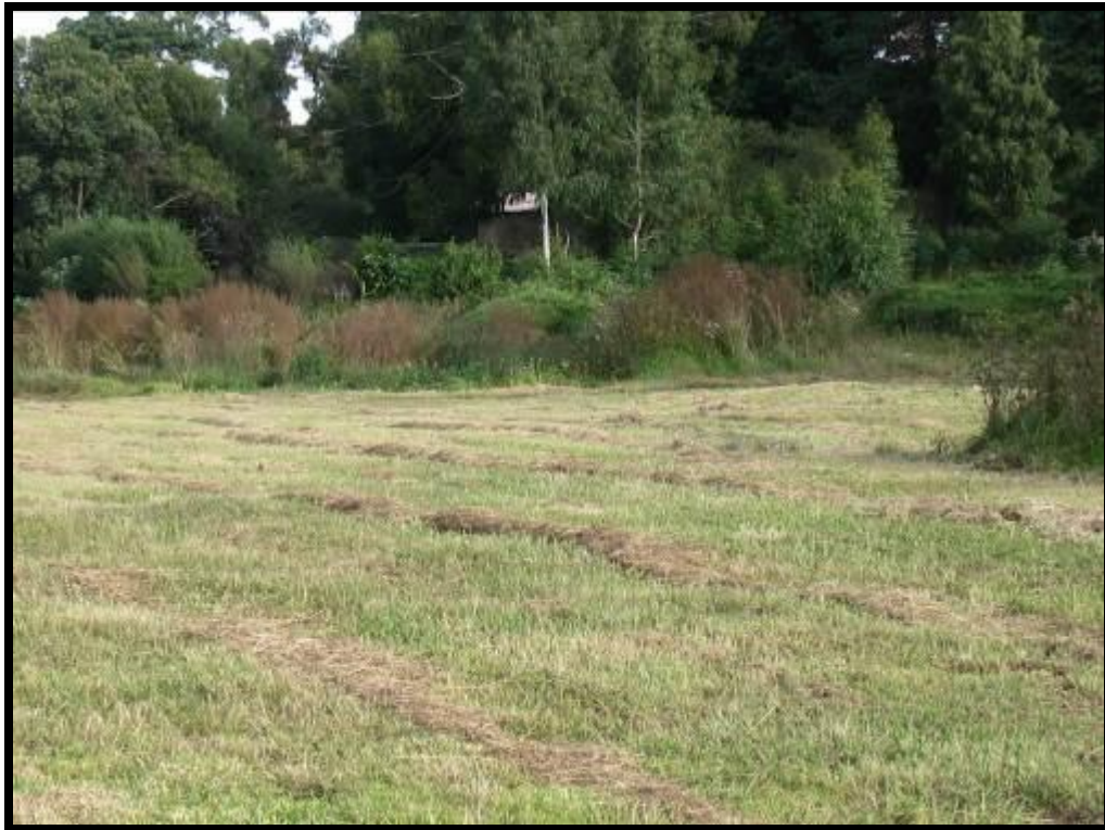
Figure 3. Photograph of the south western section of the proposed development area.