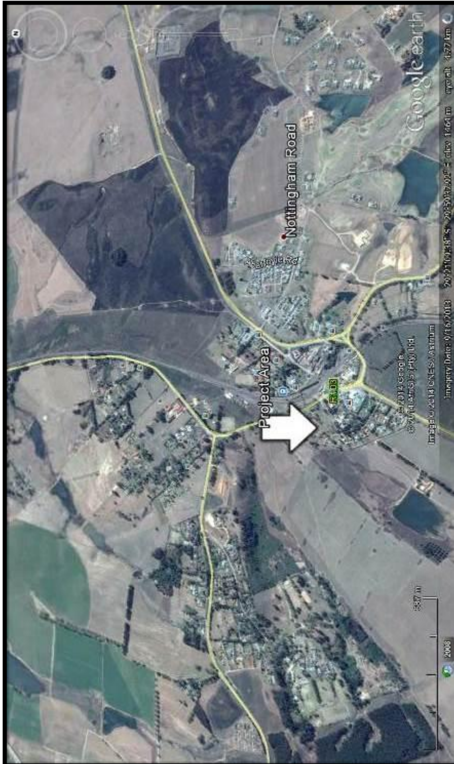
Figure 1. Google aerial photograph showing the location of the Project Area relative to Nottingham Road.