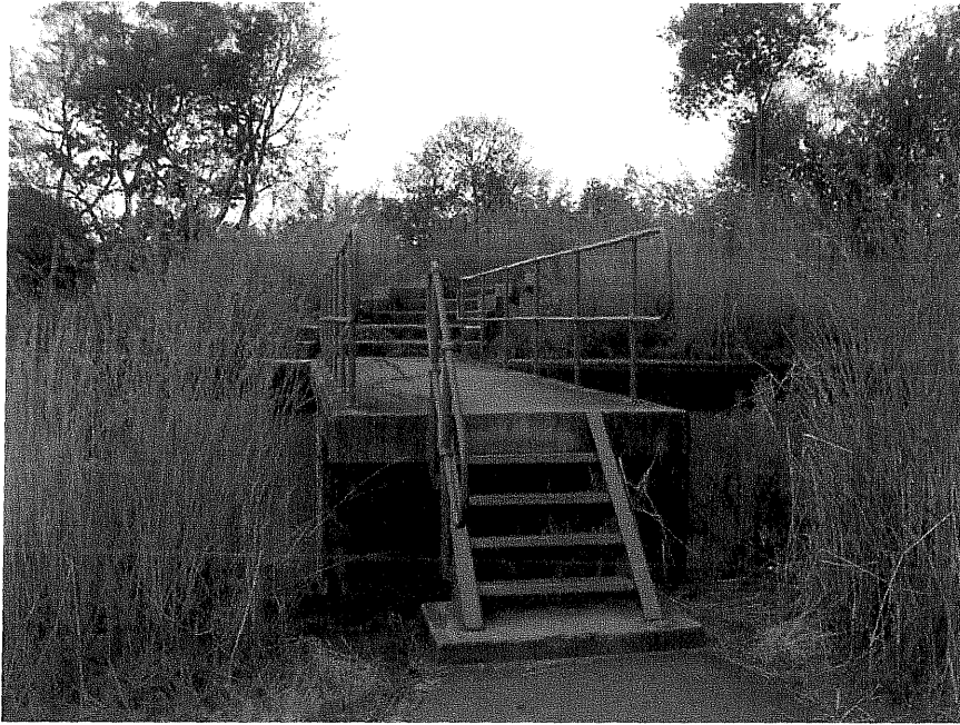
Figure 6 The steps to the dam wall.