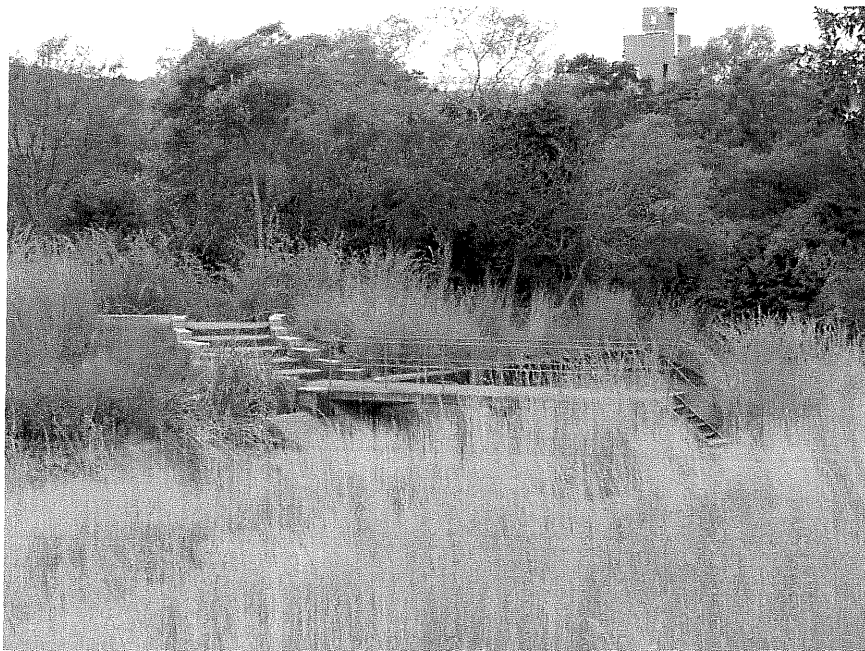
Figure 7 The steps and bridge at the dam wall.