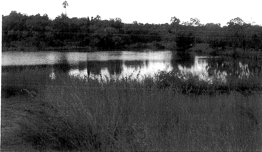
Figure 4 Another view of Struben Dam.