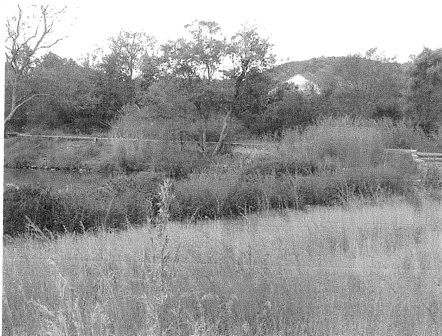
Figure 8 The dam wall from a distance.