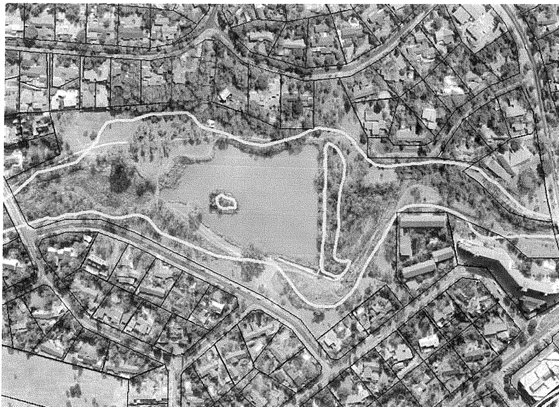
Figure 2 Aerial view of the Struben Dam.