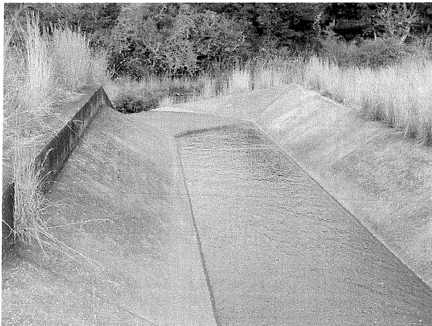
Figure 5 The overflow weir at the dam wall.

The dam is also used for fishing. In September 1984 the dam wall was upgraded and since 1985 it also serves as flood control dam (CoT brochure).