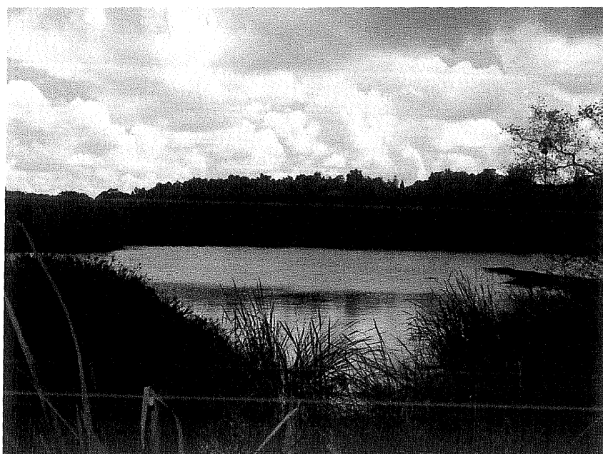
Figure 3 View of the dam.