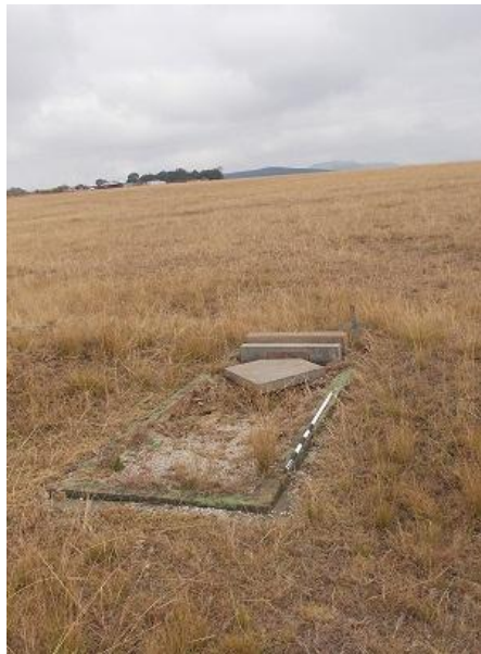
Fig 3. Cemetery 2