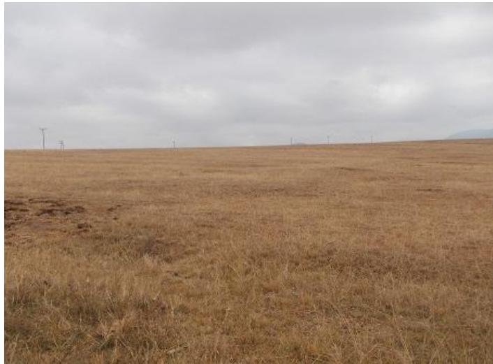
Fig 1. General view of proposed development area

General GPS co-ordinate: S30^{\circ} 25' 12.9'' E29^{\circ} 41' 24.4''