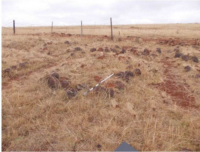
Fig 2. Cemetery 1.

GPS co-ordinate: S30° 25' 09.8" E29° 41' 35.5"