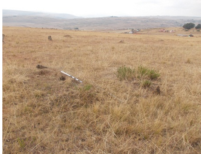
Fig 4. Cemetery 3