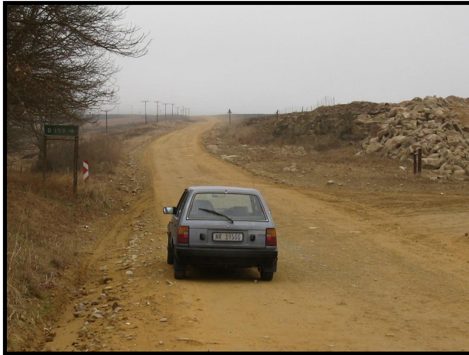
Figure 3. Photograph of the P125 at the beginning of the footprint near the P316. No heritage sites or features occur within 30m from the road reserve.