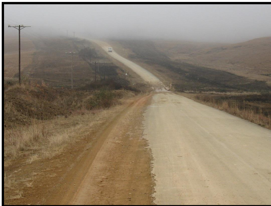
Figure 4. Photograph of the p125 near a river crossing. No heritage sites or features occur within 30m form the road reserve.