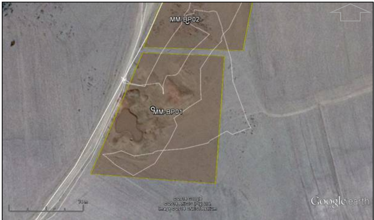
Map 5: Results of the field assessment – Borrow Pit MM_BP01 (tracklog – white)

No archaeological or cultural heritage resources, as defined and protected by the NHRA 1999, were identified during the field assessment of the Borrow Pit MM_BP01 study site.