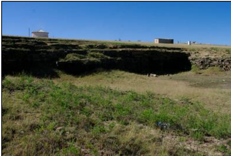
Plate 18: View of the Borrow Pit MM_BP04 study site [2]