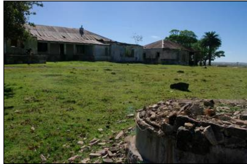
Plate 15: View of the Site MM_BP03 main residence structures from the south with remains of farming infrastructure in the foreground