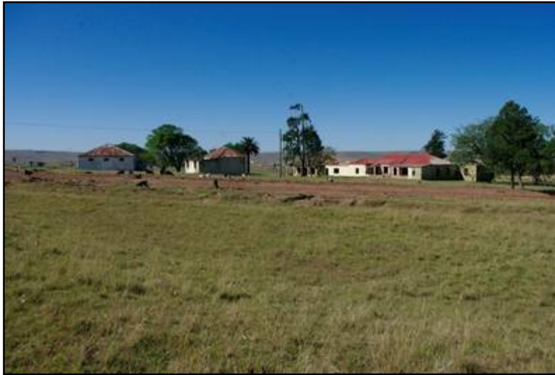
Plate 13: Site MM-BP03-S1 – The main residence and northern outbuildings