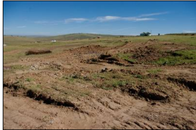
Plate 11: Close-up of exposed deposits at MM_BP03-S1