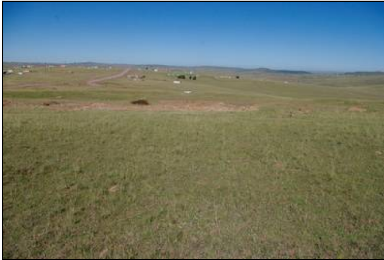
Plate 9: General view of the Borrow Pit MM_BP03 study site