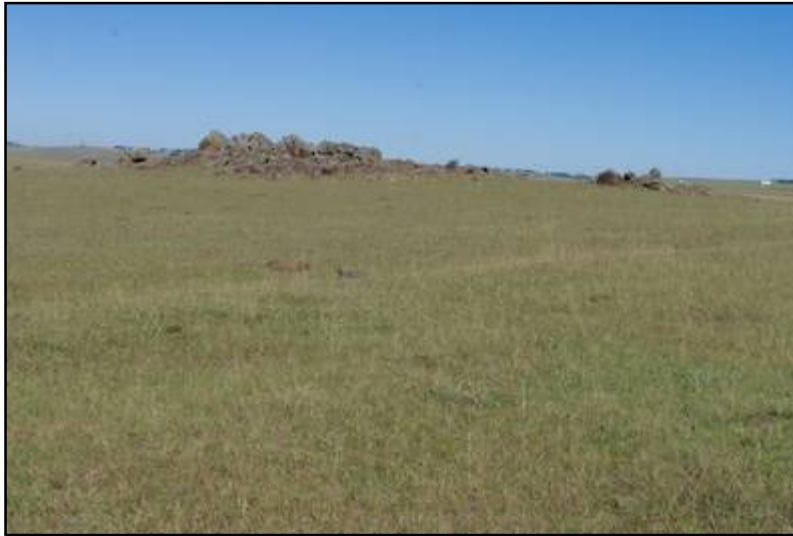
Plate 5: View of the Borrow Pit MM_BP02 study site