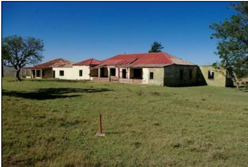
Plate 14: Close-up of the Site MM_BP03-S1 main residence