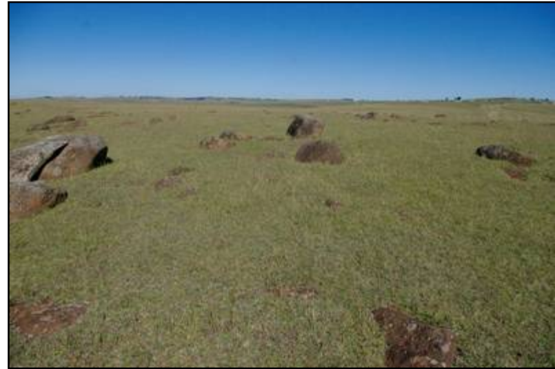
Plate 3: View over the eastern portion of the MM-PP01 study site and adjoining area