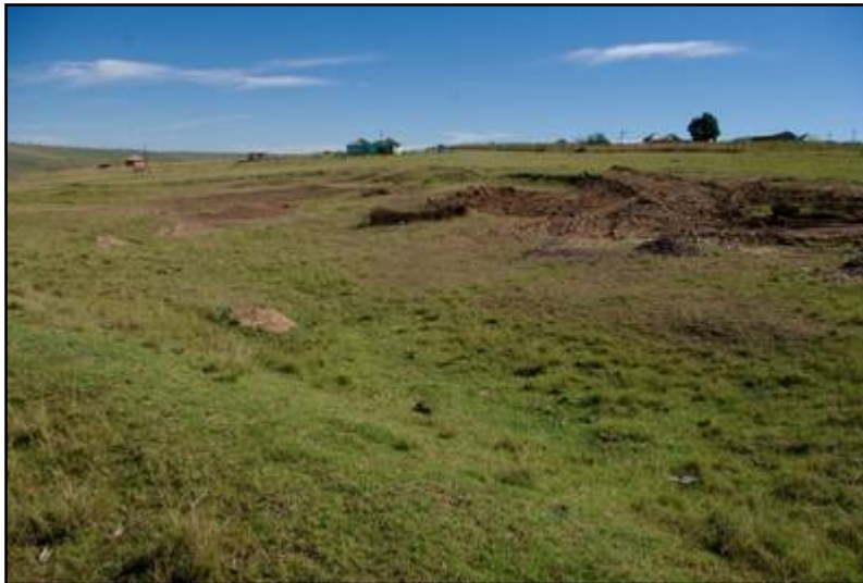
Plate 10: Close-up of exposed sections at MM_BP03 [1]