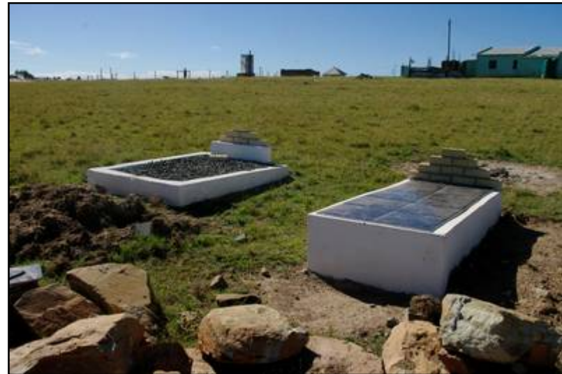
Plate 20: The 2 contemporary graves comprising Site MM_BP04-S