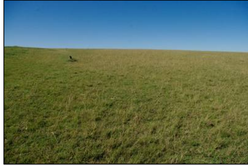
Plate 4: View over the southern portion of the MM-PP01 study site and adjoining area