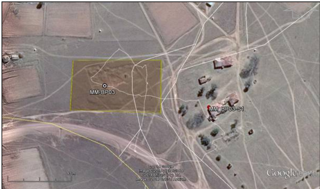
Map 7: Results of the field assessment – Borrow Pit MM_BP03 (tracklog – white)

No archaeological or cultural heritage resources, as defined and protected by the NHRA 1999, were identified during the field assessment of the direct Borrow Pit MM_BP03 study site, but a Colonial Period farmstead is situated immediately east of the study site, across the access road.