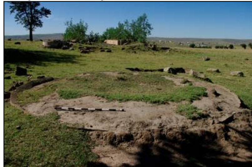
Plate 16: Farming infrastructure with the floor remains of a 'rondavel' in the foreground