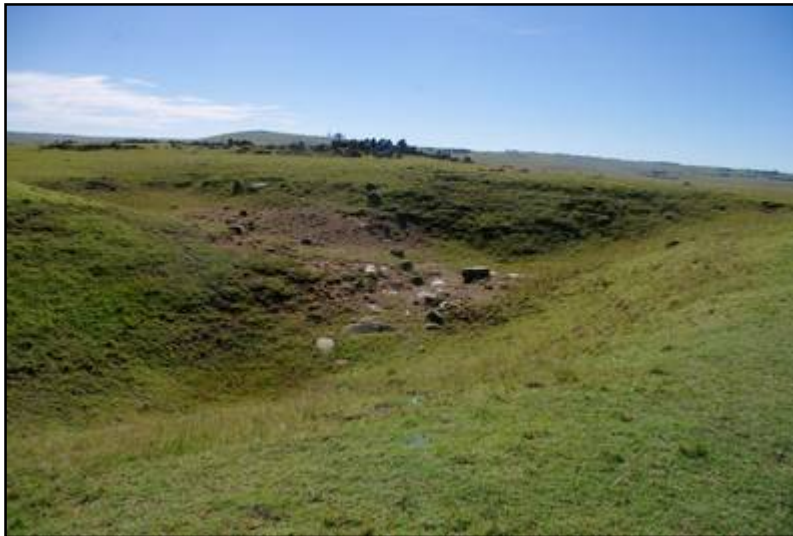
Plate 2: Existing borrowing impact at the MM_BP01 study site [2]