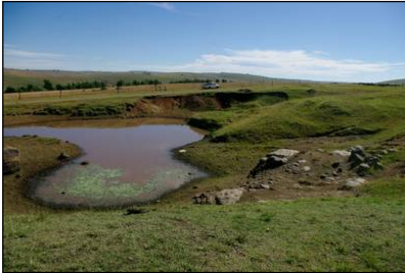
Plate 1: Existing borrowing impact at the MM_BP01 study site [1]