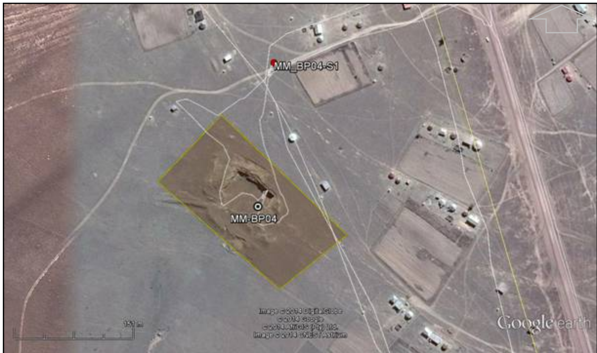
Map 8: Results of the field assessment – Borrow Pit MM_BP04 (tracklog – white)

No archaeological or cultural heritage resources, as defined and protected by the NHRA 1999, were identified during the field assessment of the direct Borrow Pit MM_BP03 study site. A small contemporary cemetery is situated in proximity to the study site, adjacent to the access road leading thereto.