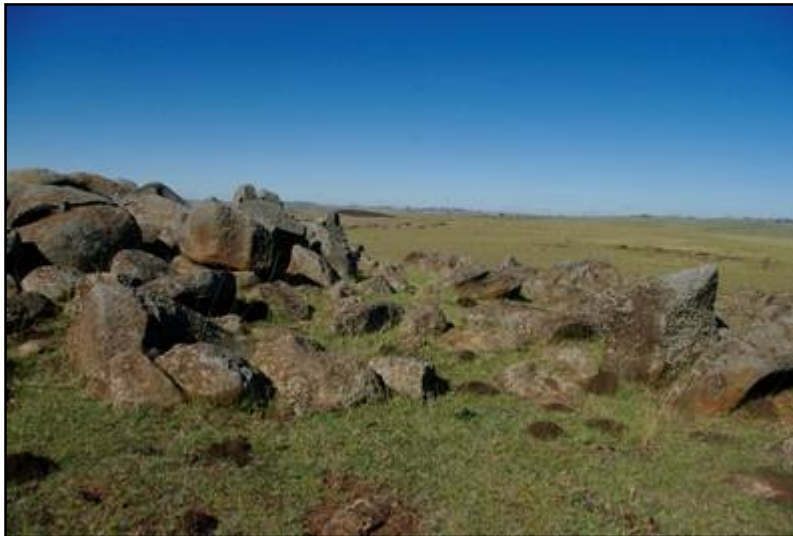
Plate 6: Close-up of the dolerite outcrop characterizing the MM_BP02 study site