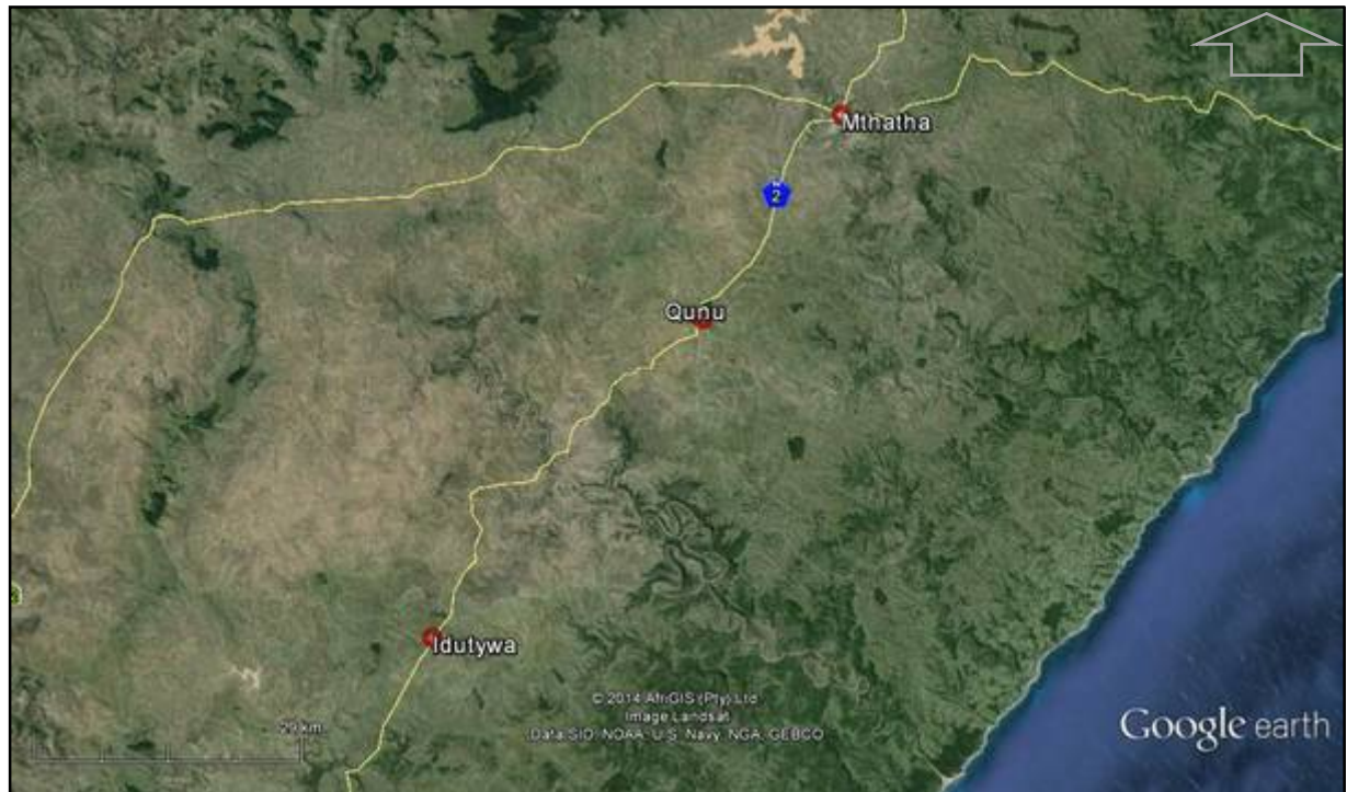
Map 1: General locality of Qunu in relation to Mthatha

indicates a basic 3m soil stratigraphy of, from top to bottom: Colluvium overlying Pedogenic soils, underlain by Residual Siltstone and Residual Shale, with the excavated basal member comprising of Alluvium.