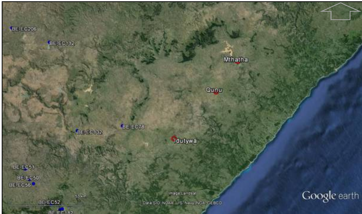
Map 4: Declared Provincial Heritage Sites in relation to the study site