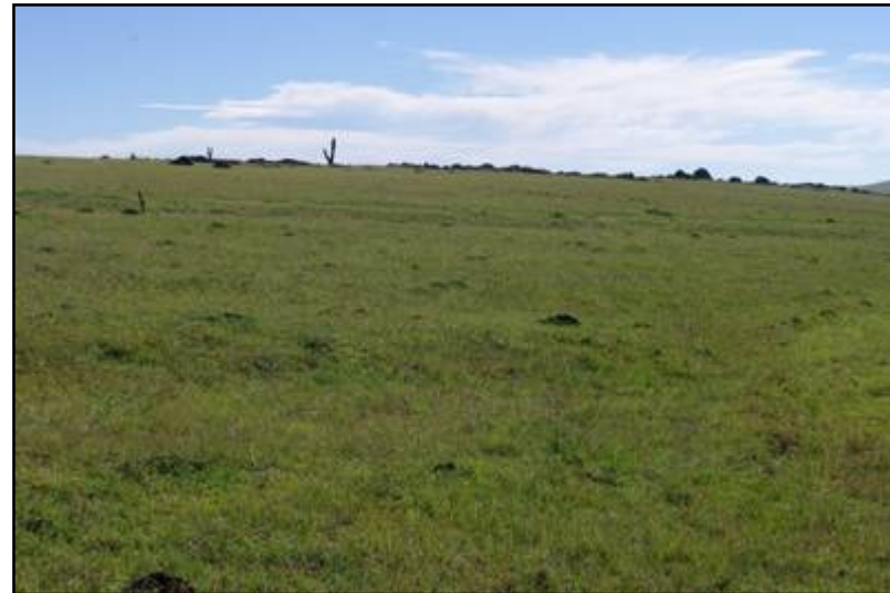
Plate 8: General view from the MM_BP02 dolerite outcrop towards the north-west