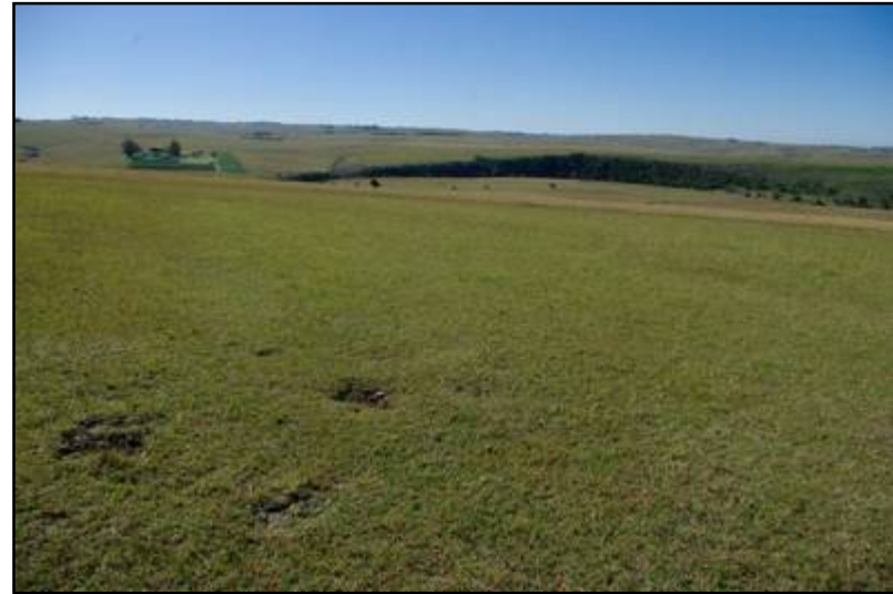
Plate 7: General view from the MM_BP02 dolerite outcrop towards the north-east