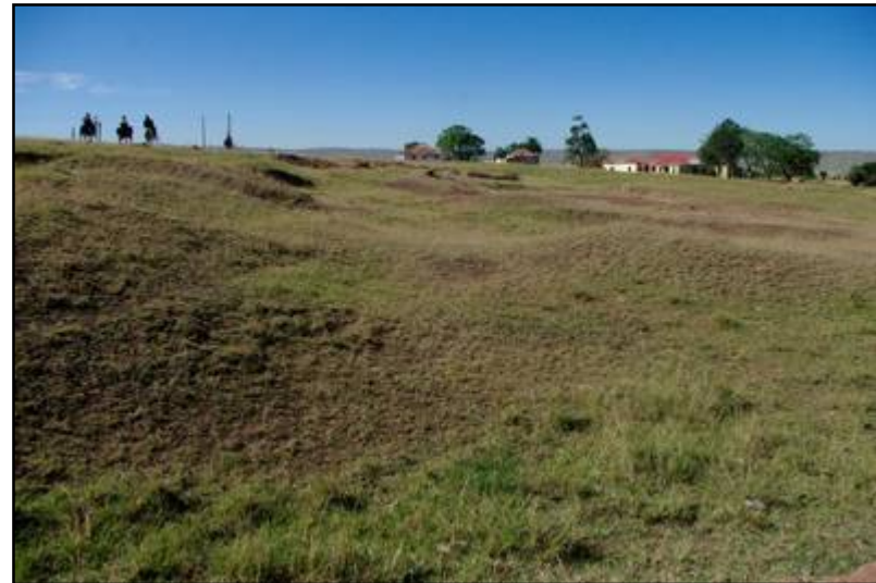
Plate 12: View of the MM_BP03 study site with the Colonial Period Site MM_BP03-S1 in the background