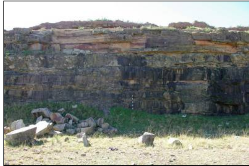
Plate 19: Close-up of large exposed sections at MM_BP04