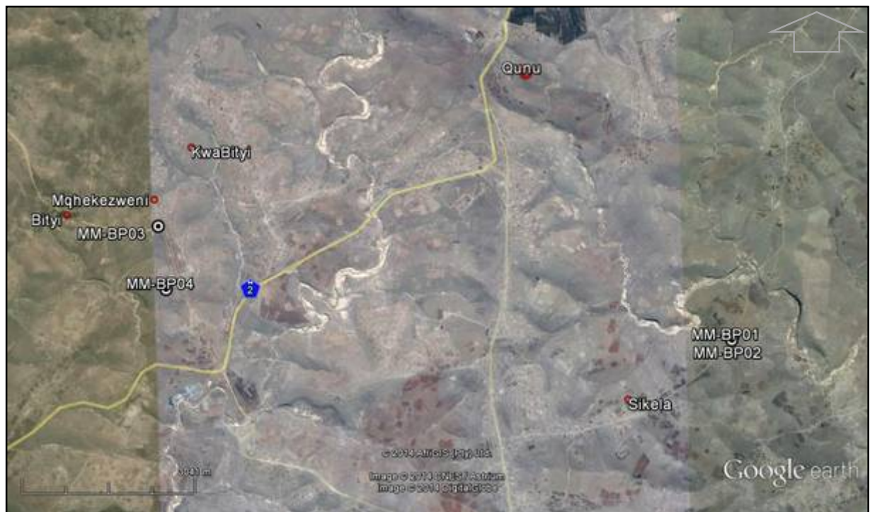
Map 2: General locality of the proposed Utilization of 4 Borrow Pits for the Masimini-Madonisi Access Road Upgrades development, near Qunu, KSDL, Eastern Cape