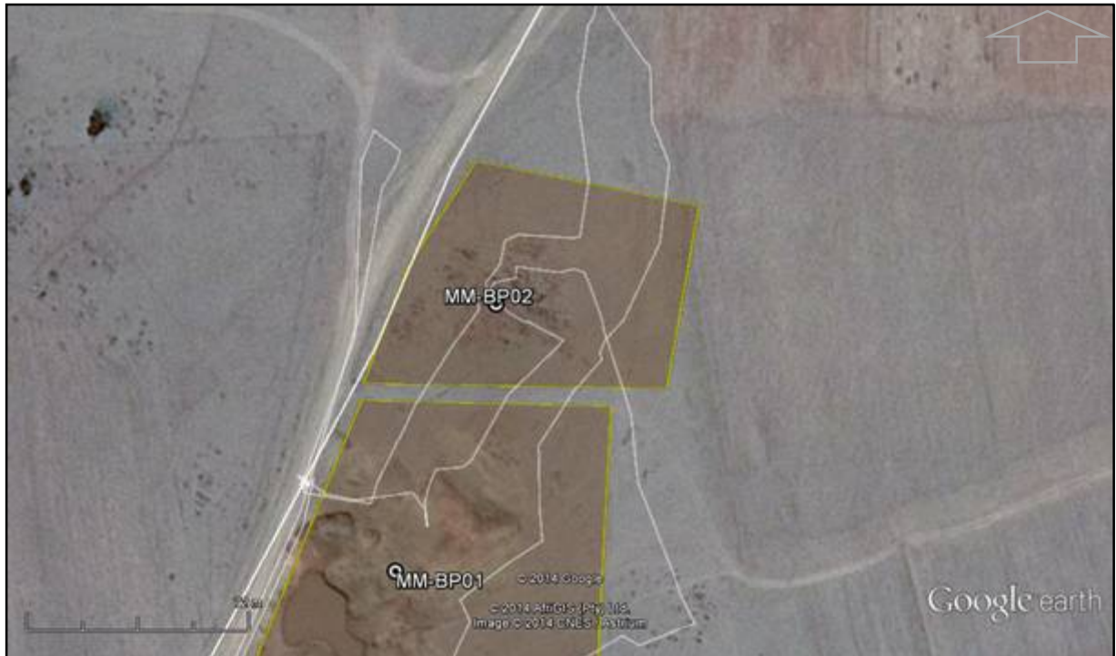
Map 6: Results of the field assessment – Borrow Pit MM_BP02 (tracklog – white)

No archaeological or cultural heritage resources, as defined and protected by the NHRA 1999, were identified during the field assessment of the Borrow Pit MM_BP02 study site.