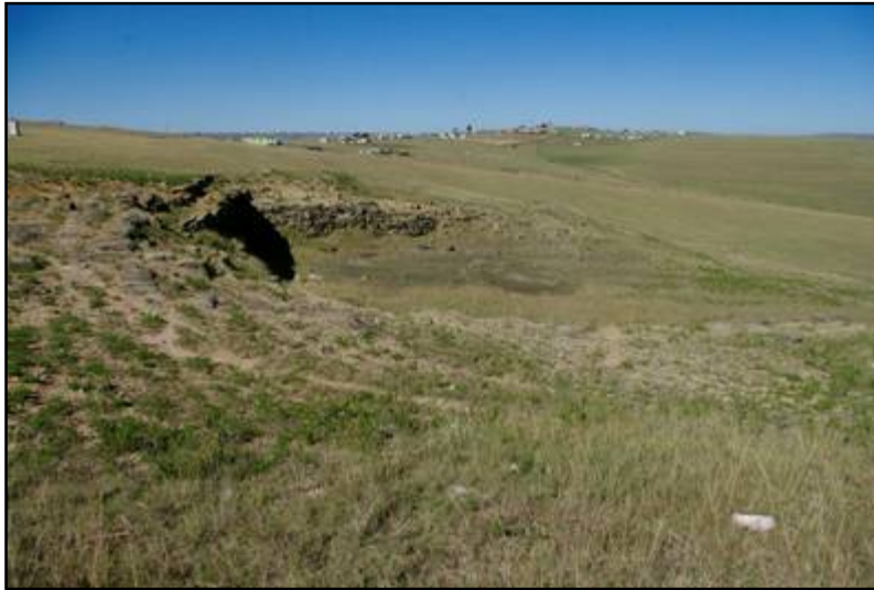
Plate 17: View of the Borrow Pit MM_BP04 study site [1]