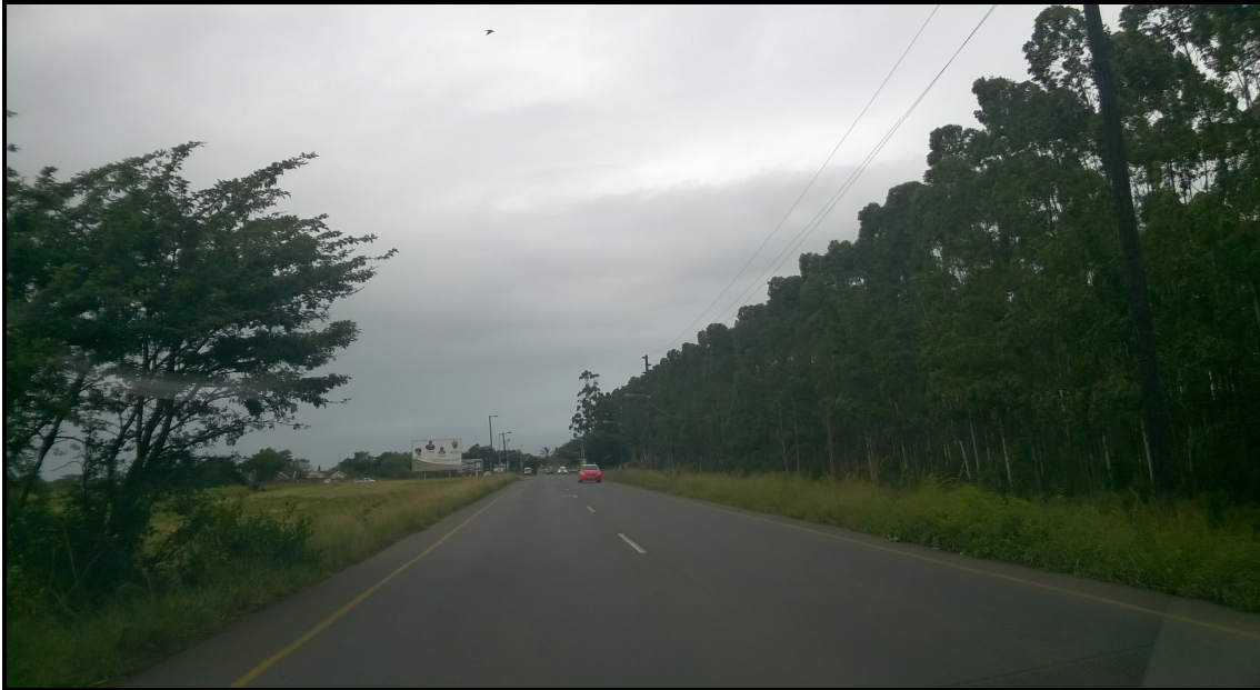
Plate 4: Typical vegetation found along some sections of the route