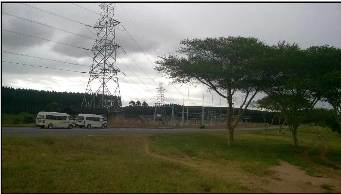
Plate 5: Fairly visible section of the route