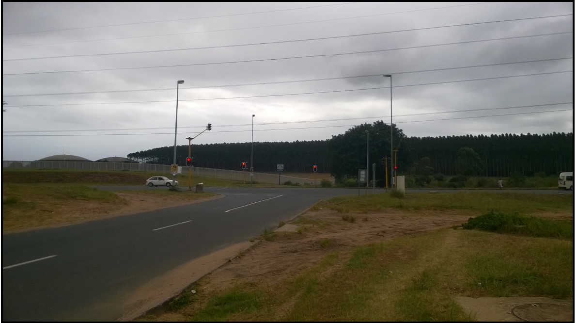
Plate 2: Plantations along the P231 Road