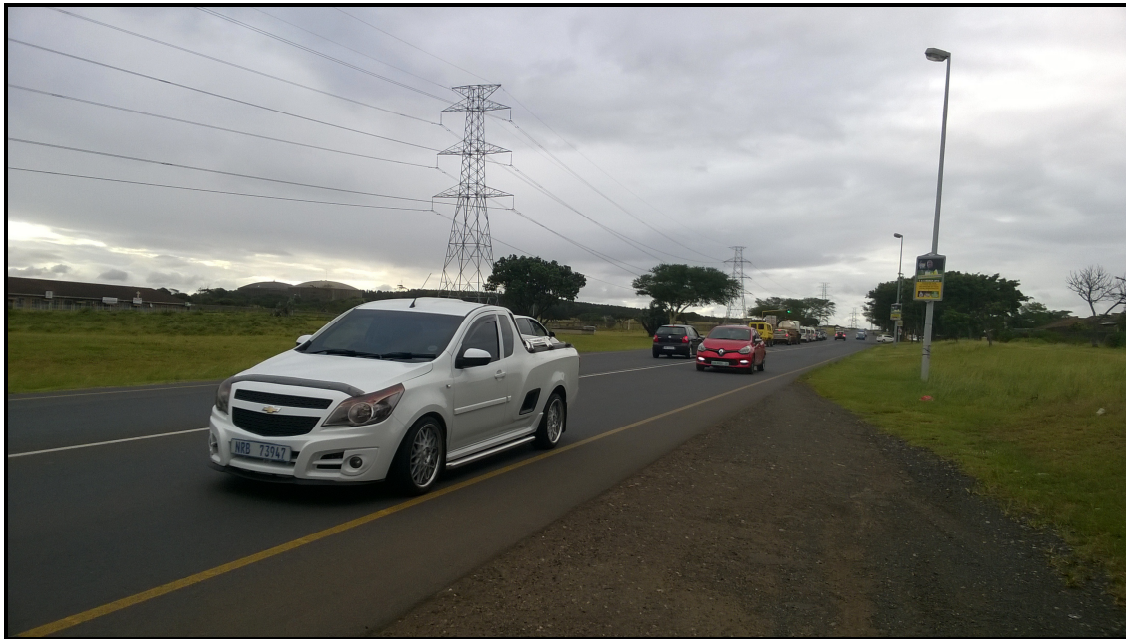
Plate 1: Road currently being used

The proposed Road P231 section that is indicated for the upgrade is currently under use (Plate 1). The land uses along the route include afforestation (Plate 2) and residential areas (Plate 3).