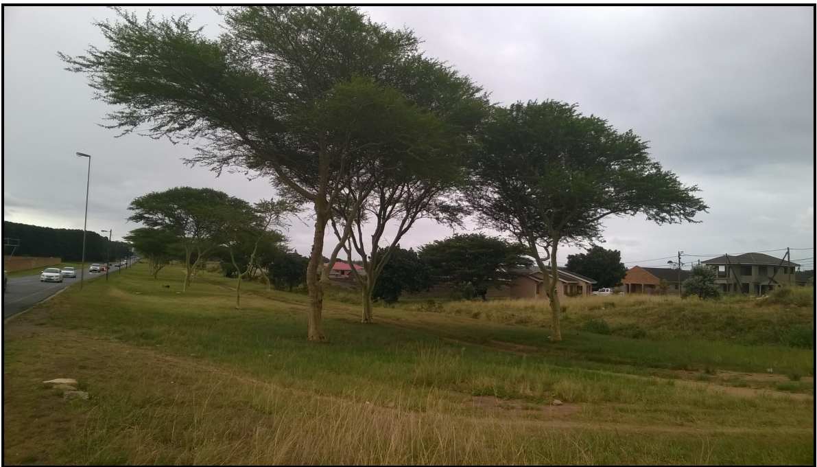
Plate 3: Residential Houses along Road P231 (Aquadene Suburb)