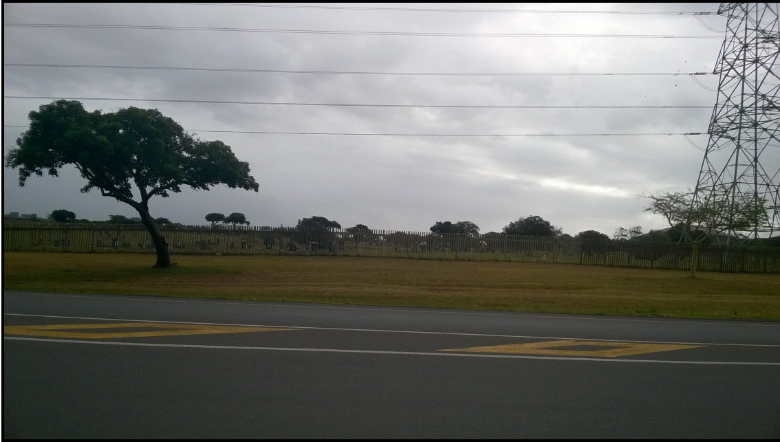
Plate 6: Brankenham Cemetery