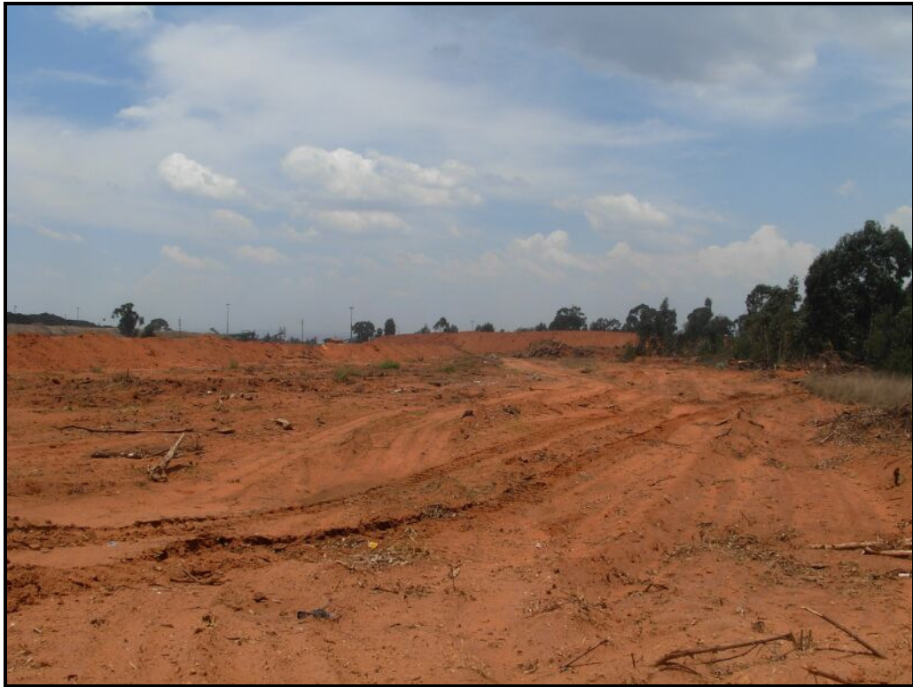
Figure 4 - Disturbed areas on site