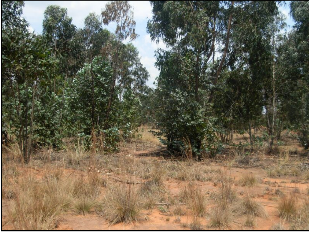
Figure 3 - View of plantation