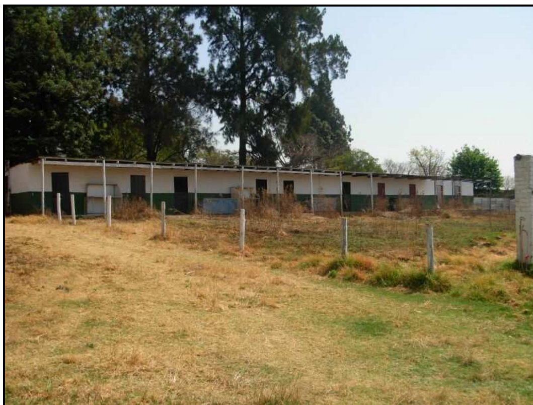
Figure 6 – Stables