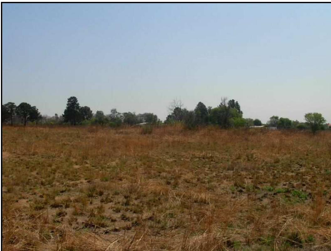
Figure 4 - Grassland on site