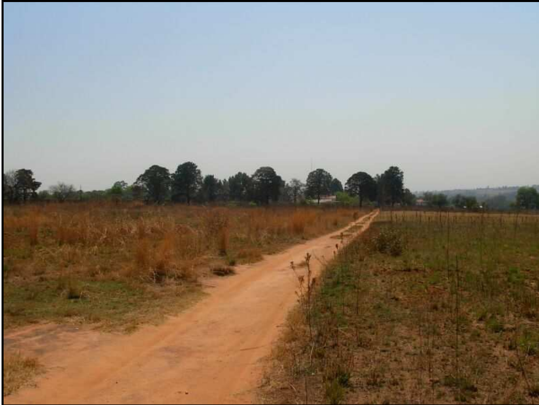
Figure 3 - General photo of the site with houses in background