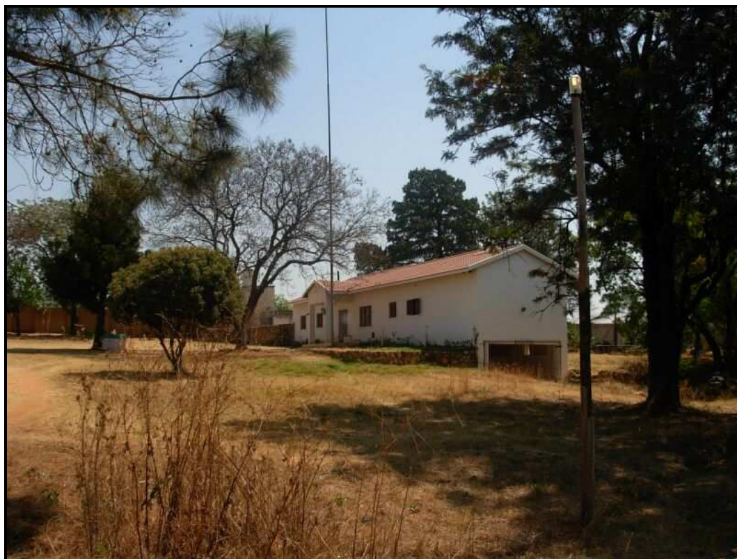
Figure 5 – Current house on site