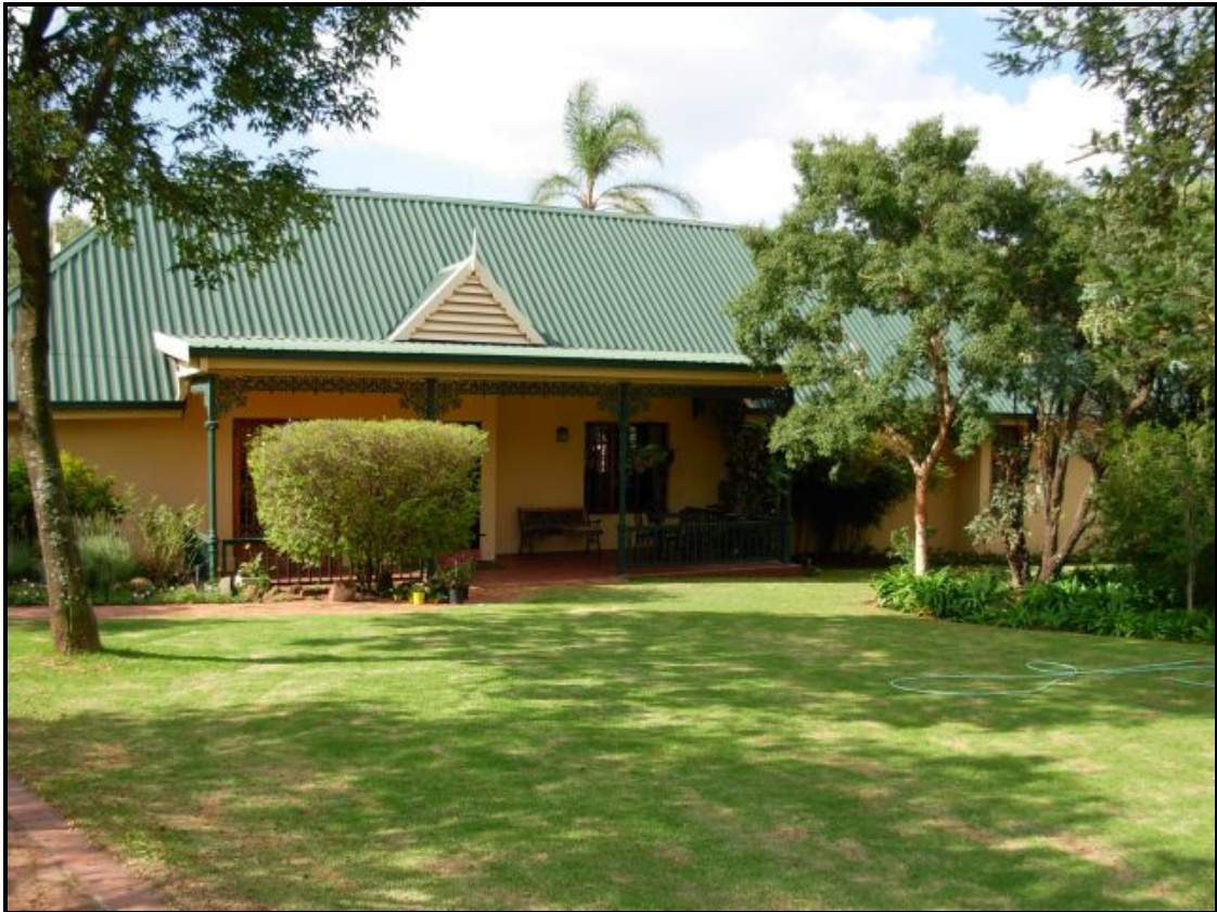
Figure 3 – House on AH 332