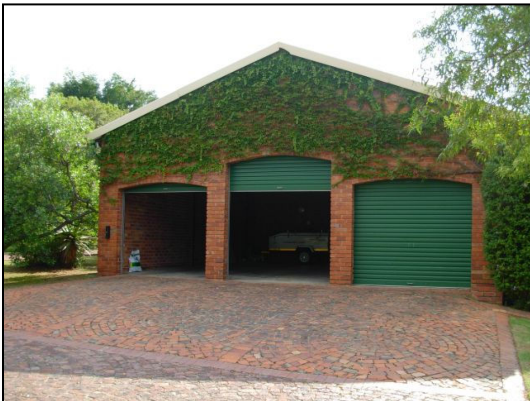
Figure 4 – Garage on site