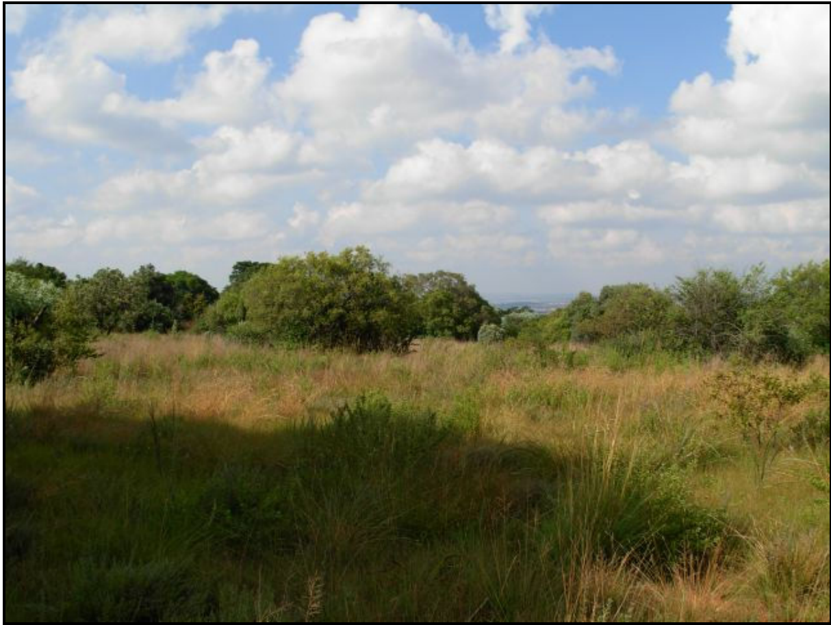
Figure 5 – General photo of holding 333

Holding 333 is currently undeveloped and consists of grassy woodlands. Sections have previously been cleared during rubble clearing of the site.