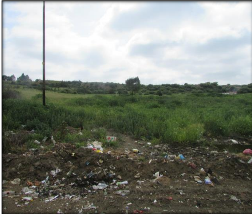
Figure 6: Another general view of the study area.