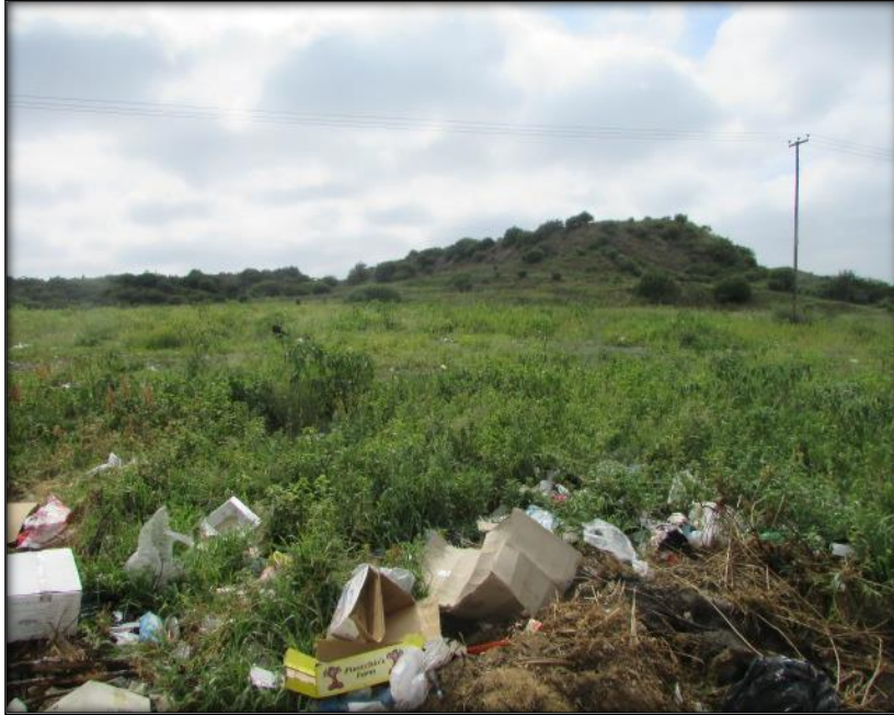
Figure 4: Another view. Note the refuse & old quarry spoil heap adjacent.