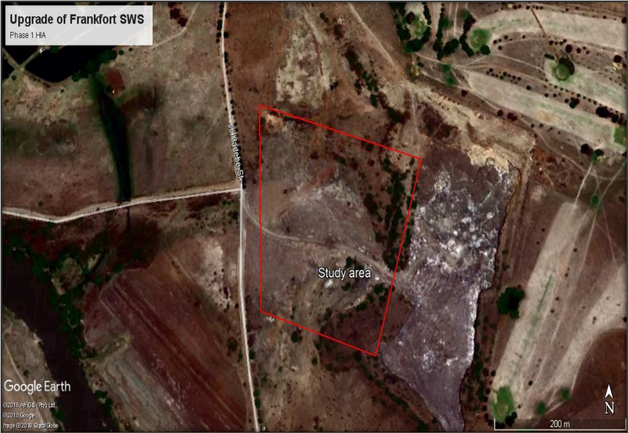
Figure 2: Closer view of study area footprint (Google Earth 2019).