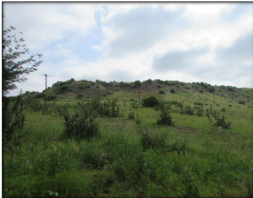
Figure 5: A closer view of the quarry spoil heap.