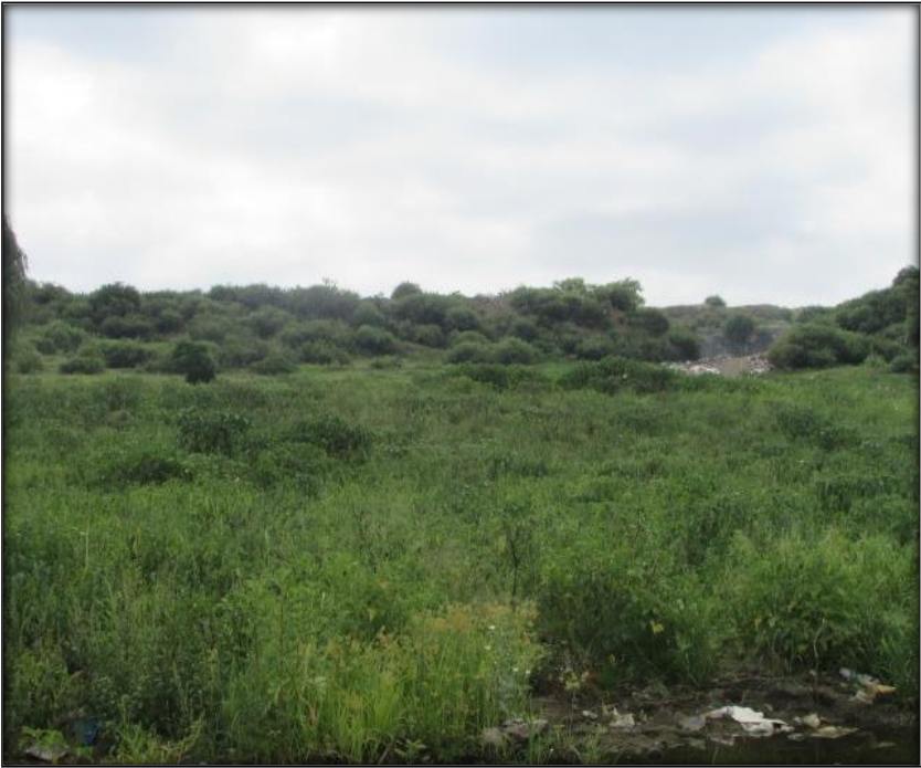
Figure 3: General view of area. Note the dense vegetation cover.