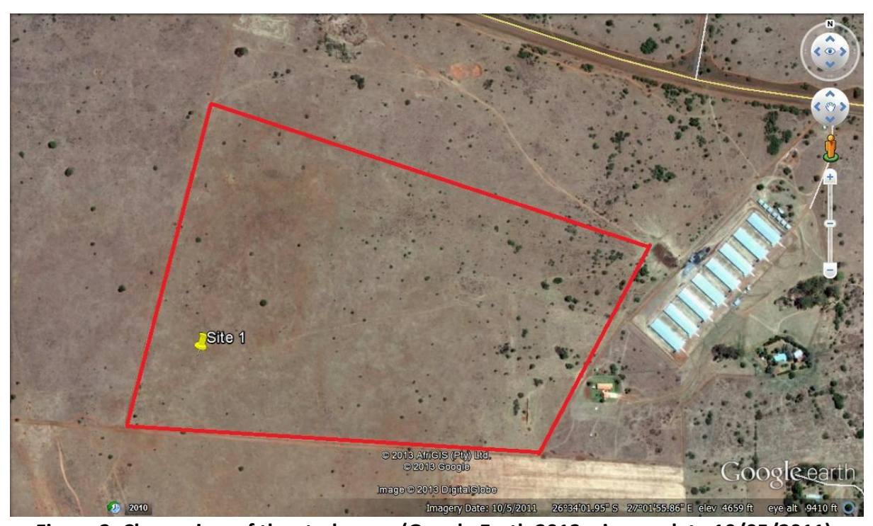
Figure 2: Closer view of the study area (Google Earth 2013 – image date 10/05/2011). Note the existing operations.