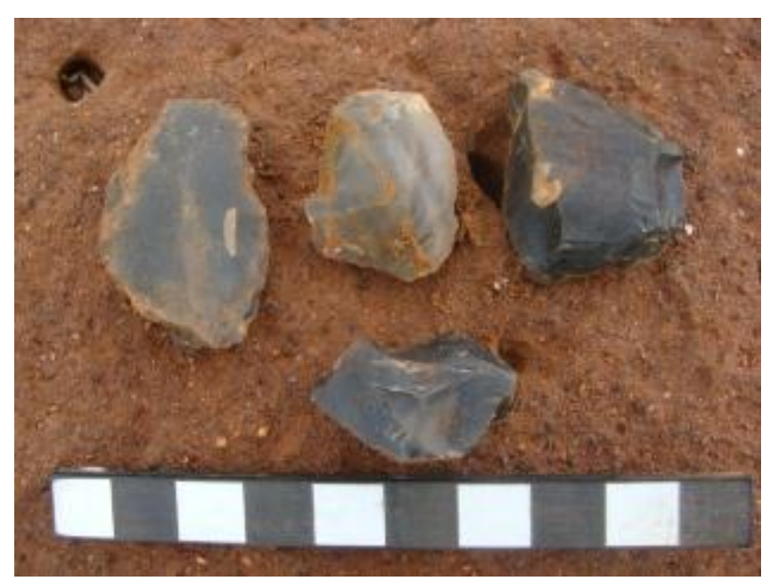
Figure 7: Stone tools found in the study area.

It is recommended however that the development steer clear of the koppie and that if any in situ material is found during the development anywhere else these should be reported to an expert to investigate.