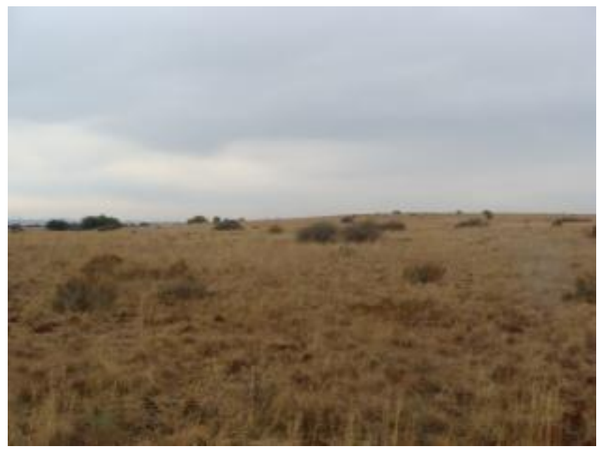
Figure 4: View of the low hill/koppie.