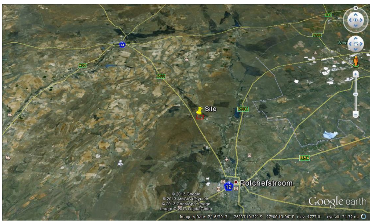
Figure 1: General location of the study area (Google Earth 2013 – image date 2/16/2013).