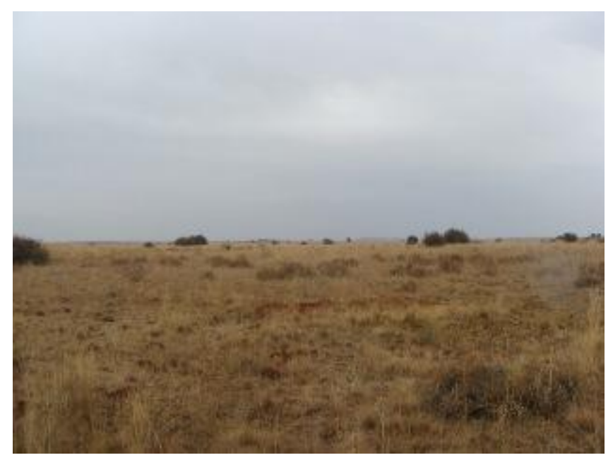
Figure 3: General view of a section of the area.