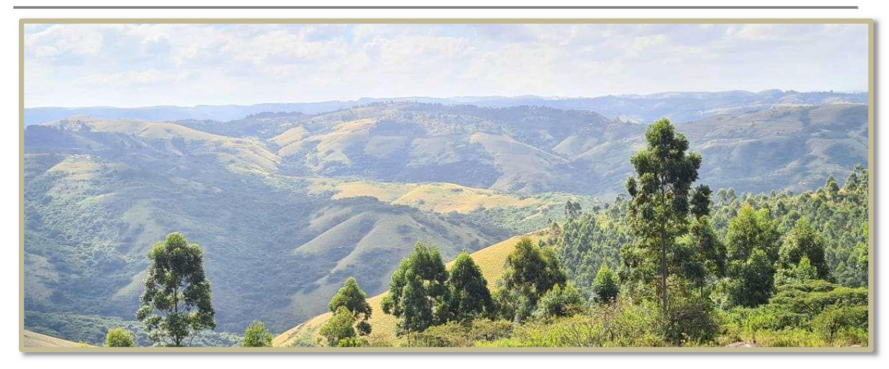
Figure 4 South facing landscape-wide view of the proposed South Block MLA and Mining Rights Application Area