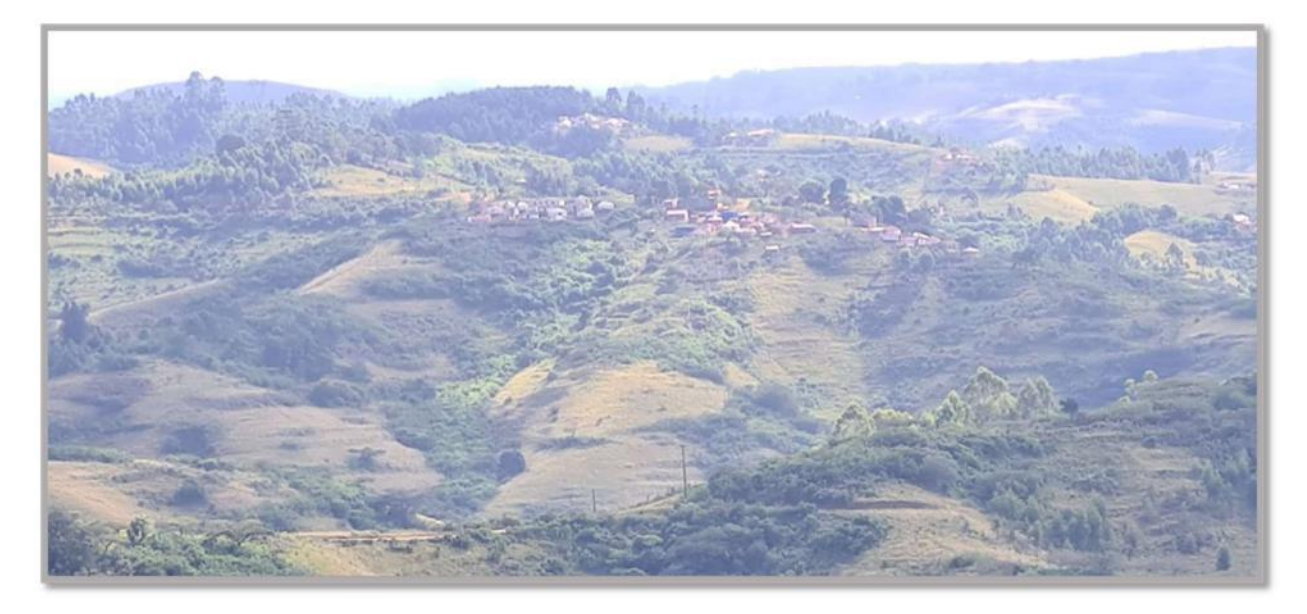
Figure 3 Typical landscape of the study area

None of these lithologies are fossil bearing and consequently, no further palaeontological mitigation is recommended.<sup>5</sup>